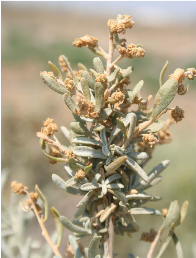
Male fourwing saltbush flowers.

1984). Several hybrid forms involving fourwing saltbush have been documented including hybrids with A. nuttallii , A. polycarpa , A. gardneri , A. obovata and A. falcata (Stutz, 1984).