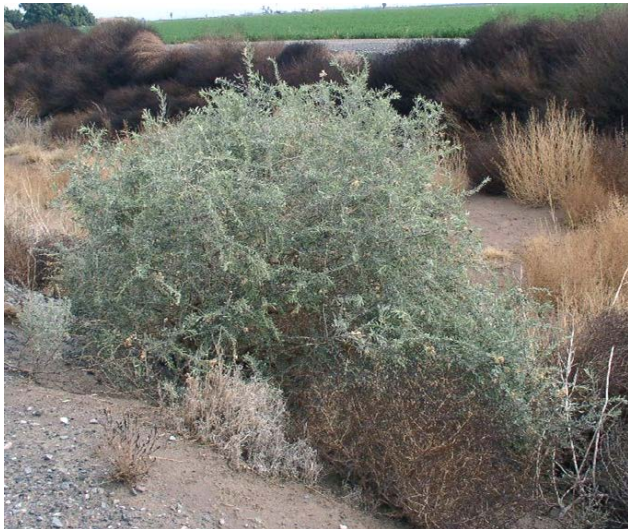
Fourwing saltbush. Photo by Steven Perkins @ USDA-NRCS PLANTS Database

Contributed by: USDA NRCS Idaho Plant Materials Program