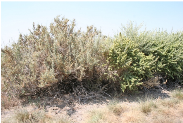
Male plant left, female plant right.

Plantings can also be established with seed. A minimum of 15 to 20 Pure Live seeds per linear foot of drill row should be planted. Hand seeding in late fall or very early spring may also be an option. Plant 5 to 10 seeds in a close group at desired spacing. The plants should be thinned to the desired spacing and ratio of male to female plants when fruiting starts (about 3 years). Full seed production may be reached the fourth year following direct seeding.