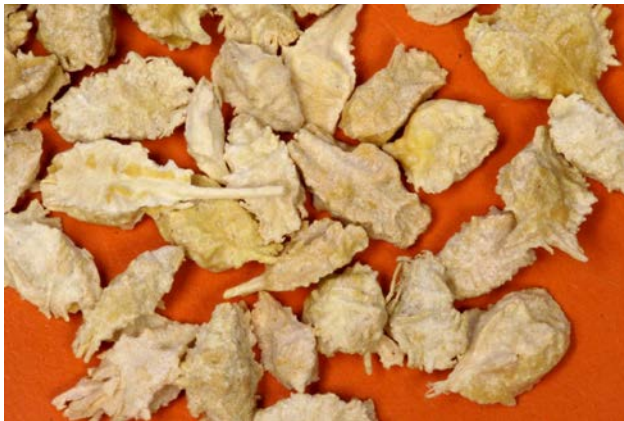
Fourwing saltbush seed that has been processed to remove the wings to facilitate flow through seeding equipment.

An adapted cultivar/release or local seed source should be used to ensure the ecotype is compatible with the site. Seed should be after-ripened for ten months and dewinged prior to planting. On moist fine soils, seed should be planted ½ inch deep. On sandy to coarse gravelly soils, plant up to ¾ inch deep. Seeding rates of 0.25 to 0.50 PLS (pure live seed) pounds per acre is recommended for rangeland seeding mixtures (3 to 7 percent of the seeding mix) to provide approximately 400 plants per acre (Ogle et al., 2011). Dewinged seed is preferred because seed flow through a drill and planting depth can be controlled more easily. There is no prechilling requirement for fourwing saltbush seed. See Seed Production section for additional planting recommendations