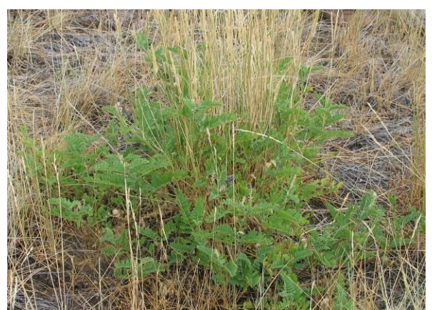
Figure 3. Cicer milkvetch grass- legume seeding mix. Dan Ogle, USDA NRCS, Custer Co. Idaho.

When harvested as hay in mountain areas, it is best if harvested in a two cutting regime because of slow spring growth and slow post cutting recovery. More frequent cutting decreases yield of cicer milkvetch hay. Yields and forage quality are also reduced if only cut once per season. First cutting should occur at 1/10^{th} bloom stage (about 2 weeks later than 1/10^{th} bloom of alfalfa). The second cutting should occur at the end of the growing season. Drying time is approximately 3 days longer than other legumes. Crimping the hay as it is cut or turning windrows reduces drying time by 30 to 50%.