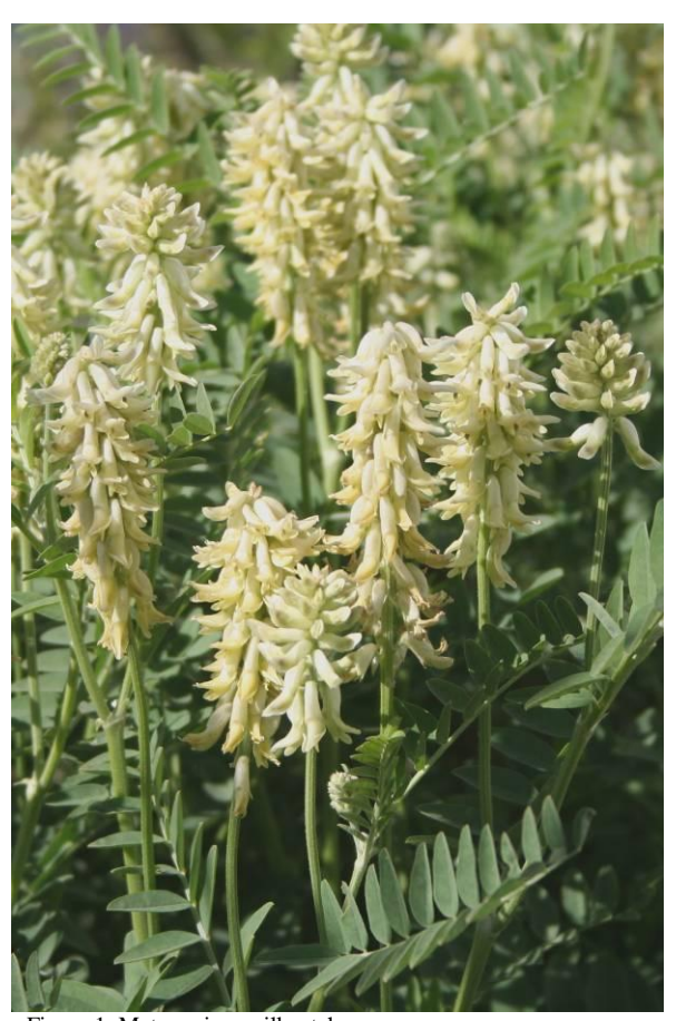
Figure 1. Mature cicer milkvetch.