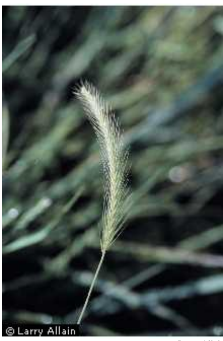
Larry Allain USDI GS NWRC @ PLANTS

Contributed by: USDA NRCS Kika de la Garza Plant Materials Center