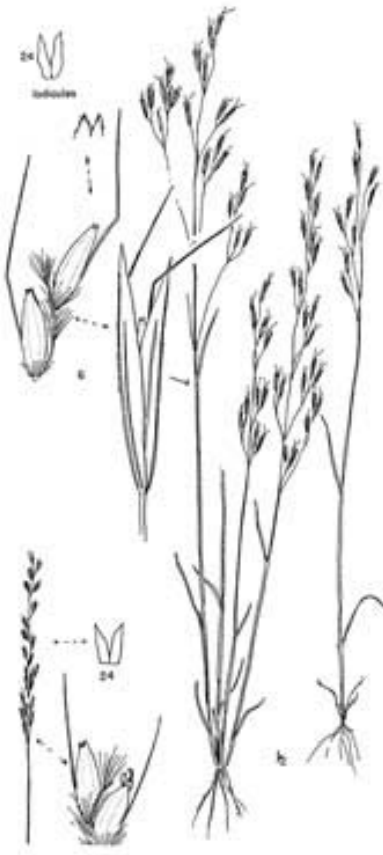
Line drawing of Deschampsia danthonioides reprinted with permission, University of Washington Press.