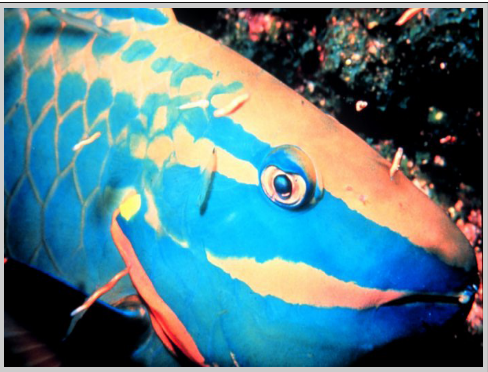
This parrotfish represents the numerous species being protected by Marine Protected Areas. While some aim to protect and restore whole ecosystems, they also can be designated to protect one single species or an area that has high cultural significance.

The Integrated Ocean Observing System (IOOS) is a federal, regional, and private sector partnership providing new tools and forecasts to improve safety, the economy, and our environment. IOOS is an interagency effort coordinated between 17 federal agencies and 11 regions.