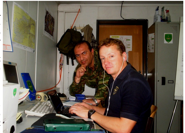
JALLC staff members deployed to ISAF. Since 2008, JALLC has had a permanent representative in HQ ISAF to provide LL support to the ISAF staff and assist Analysis Teams deploying to theatre

From the first reports, filed on some dusty shelves somewhere throughout the NATO Commands, to the recent report on Lessons Learned from OUP, endorsed by the North Atlantic Council, lots of things have changed. That tiny entity that seemed disposable to many is now one of the most appreciated realities of the NATO Command Structure, enjoying a solid reputation as NATO's Lead Agent for joint analysis. Many contributed to this amazing achievement; we, the 'JALLC founders', are particularly proud of having walked that extra mile to make this happen.