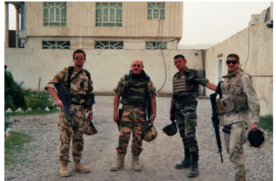
JALLC analysts deployed to Herat, Afghanistan in 2005 in support of the study on ISAF Stage II Expansion, which looked at the handover of Region West from the US-led Coalition to NATO.

With regards to operations, JALLC has investigated, understood, identified causes and presented potential solutions to issues that have been raised by Commanders of all operations and missions carried out by NATO since our activation. These issues have covered the complete spectrum from the tactical level, such as force protection in the International Security Assistance Force (ISAF), through the operational level—for example, Information Operations—to the strategic level, a good example being the 2011 JALLC study on the NATO Crisis Response Operations Urgent Requirements approval process. We