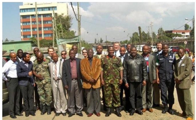
LL Outreach takes JALLC staff all over the world. In 2010, JALLC provided LL training to the African Union Exercise AMANI AFRICA Evaluation Team in Addis Ababa, Ethiopia.

In JALLC's early years, much of JALLC's outreach was done by the Production Branch, for LL issues, and by the Operations and ETEE Divisions for analysis project outputs, for instance, exercise preparation such as the STEADFAST series. Gradually, as JALLC's analysis experience expanded and capacity developed, the requirement for outreach increased. This demand has required the establishment of the JATT, for training and mentoring in LL, and a suite of media to promote LL management and JALLC analysis projects. These have included the NATO LL Portal, initiated in 2010, the publication of the JALLC Analysis Handbook (2005), the publication of the NATO LL Handbook (2010), JALLC Project Factsheets, produced from 2011, and JALLC's newsletter The Explorer , first published in October 2010.