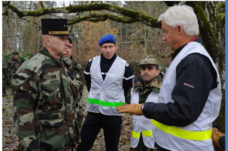
The author (r.) interviewing senior participants at the Phase II Police Operational Mentoring and Liaison Team held at French Centre National d'Entraînement de Gendarmerie in November 2010.

The recommendations given in the LI Action Plan and reports were always implemented into the next TE some months later and by doing so closed the learning loop. The LL/Analysis process together with the JALLC PDT reports have directly contributed to the high quality of ISAF PDT and are a model of how to execute a LL process.