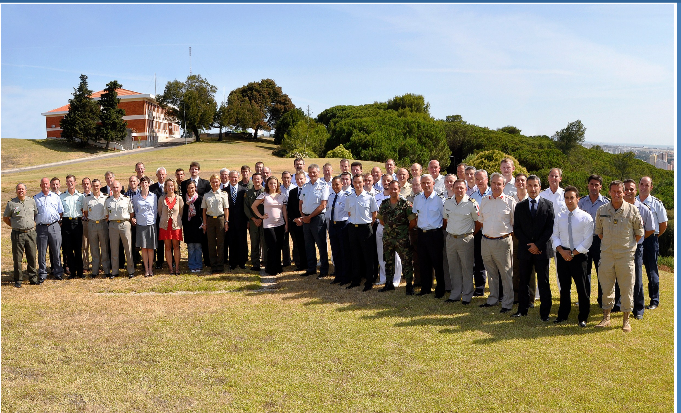
The Women and Men of JALLC – 03 July 2012