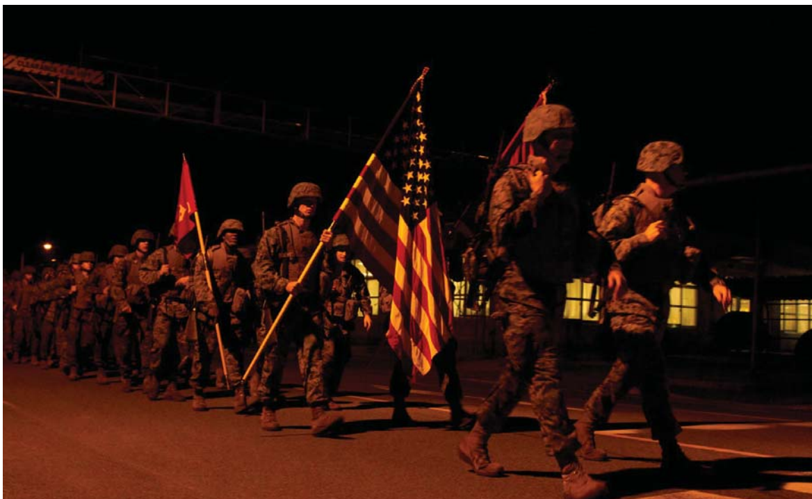
CO and SgtMaj lead H&HS Marines during a hike to celebrate the 237 th Marine Corps Birthday!