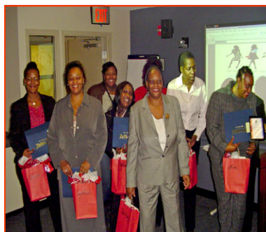
Lifetime Makeover Dress for Success Fashion Show (12/21/11)