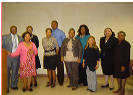
Celebrating Mentors 2011 — Cluster B's Mentors/Staff