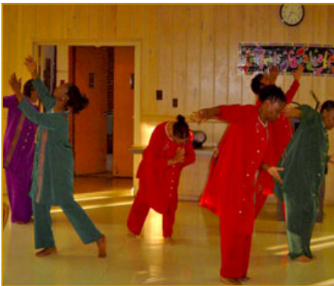
July 14, 2011 (Right) Mass Graduation & Citywide Mentor Meeting (Left) St. Teresa of Arila Dance Ministry