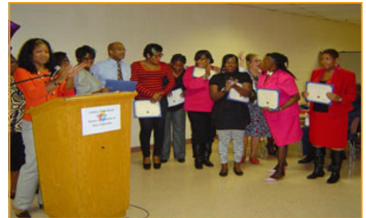
Special Emphasis Program — Mass Graduation (9/27/11)