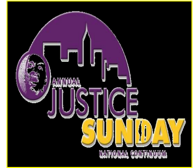
Justice Sunday 2011 @ Greater Mt. Calvary Holy