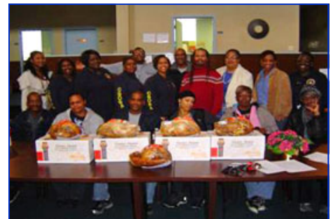
Holiday Meals for Mentees — Team 24 CSOs Rock!!!!