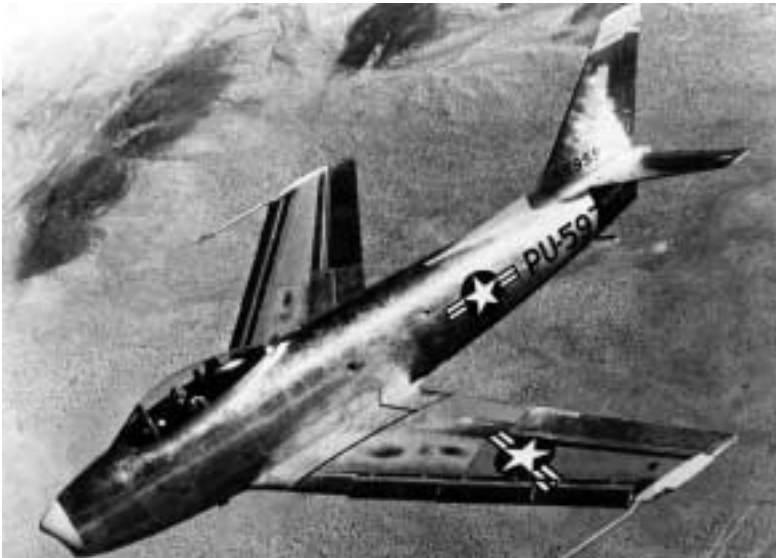
The F-86 Sabre was the preeminent USAF air-superiority fighter in the Korean War.