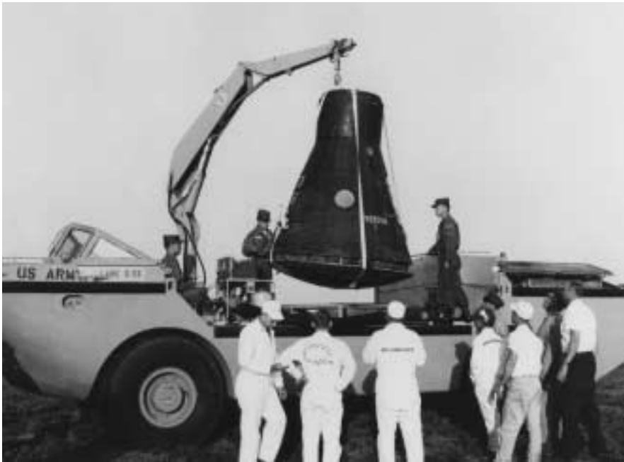
Recovery of Mercury capsule Freedom 7 on May 5, 1961

May 5: By making a suborbital flight in Mercury capsule Freedom 7 , Cmdr. Alan B. Shepard, Jr., United States Navy, became the first U.S. astronaut in space.