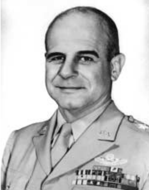
When he was a colonel, James H. "Jimmy" Doolittle led the first air raid on Tokyo.

May 7–8: The Battle of the Coral Sea was the first naval battle in which the opposing ships, beyond visual range, attacked each other entirely with aircraft. Both the United States and Japan lost an aircraft carrier, but the battle thwarted an invasion of Port Moresby, New Guinea, from which the Japanese could have invaded Australia.