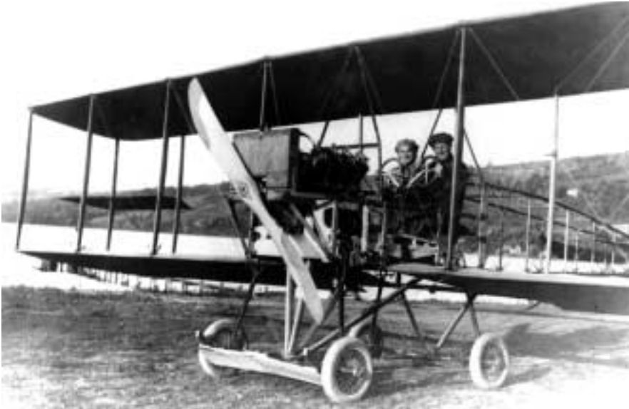
A Curtiss G tractor biplane. First purchased by the Army in 1911, its front-mounted propeller pulled the aircraft through the air:

December 8: The Signal Corps established an aviation school at North Island, San Diego, where Lt. Thomas DeWitt Milling developed the quick-release safety belt.