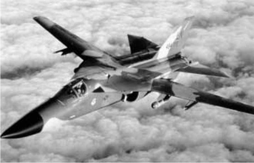
The F-111, sometimes called the Aardvark, featured swing wings that could be swept forward for slow flight or backward for greater speed.