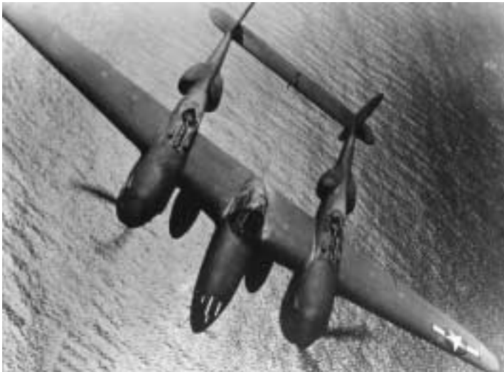
The raid to intercept and shoot down Admiral Yamamoto used the P-38 Lightning aircraft, which was also flown by the two top U.S. aces.