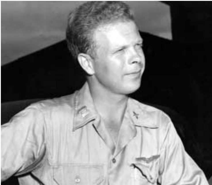
Capt. Richard I. Bong, the leading U.S. ace during World War II

December 27: Second Lt. Richard I. Bong, flying a P-38 against the Japanese in the Pacific, scored his first two aerial victories. By the end of the war, he had earned 40 such credits, making him the top U.S. ace.