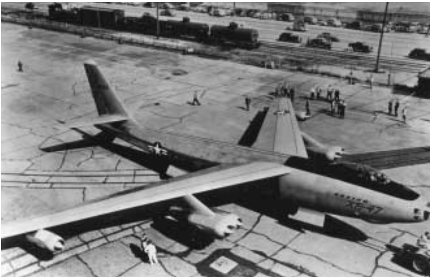
The Boeing XB-47, prototype of the B-47, the first all-jet strategic bomber

October 23: The first production B-47 Stratojet medium bomber entered service with the 306th Bombardment Wing, Medium. This aircraft became the workhorse for Strategic Air Command through most of the 1950s.