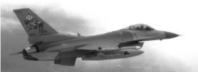
The F-16 Fighting Falcon served the Air Force in the late twentieth century as a multirole fighter.

January 6: The 388th Tactical Fighter Wing at Hill Air Force Base, Utah, received the first General Dynamics F-16 delivered to the Air Force. The F-16, the newest multirole fighter, could perform strike as well as air-superiority missions.