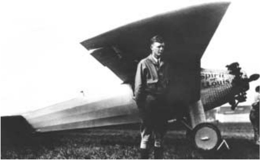
Charles Lindbergh and the Spirit of St. Louis

May 21: In his airplane Spirit of St. Louis , Charles A. Lindbergh, a captain in the Missouri National Guard's 110th Observation Squadron, completed the first solo nonstop flight across the Atlantic Ocean, from New York to Paris, a distance of 3,610 miles, in 33 hours and 39 minutes. By act of Congress, Lindbergh received the Medal of Honor for this flight.