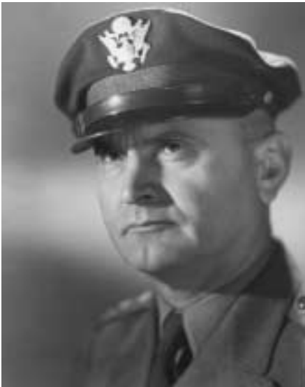
Lt. Gen. Ira C. Eaker, commander of Eighth Air Force in 1943, directed early U.S. heavy bomber raids over Europe.

February 17: Allied Force Headquarters constituted and activated Mediterranean Air Command under Air Chief Marshal Sir Arthur Tedder of Great Britain. It included three commands: Northwest African Air