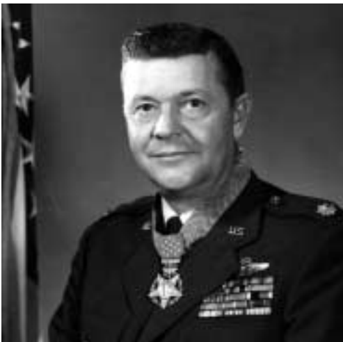
Lt. Col. Joe M. Jackson earned the Medal of Honor in Vietnam.