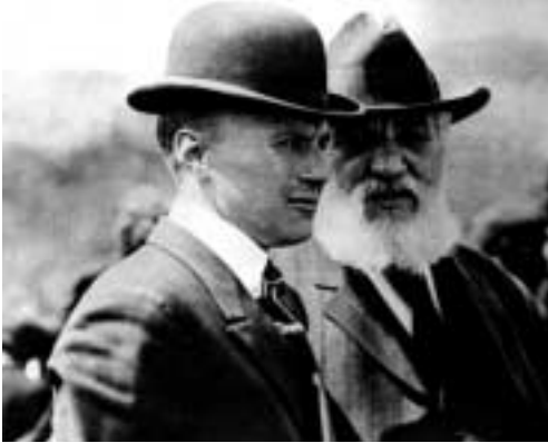
Lt. Thomas E. Selfridge and Dr. Alexander Graham Bell

September 17: Lt. Thomas E. Selfridge of the Army became the first U.S. military member to die in an airplane accident when he crashed with pilot Orville Wright during a flight test at Fort Myer, Virginia. A propeller split and broke a wire supporting the rudder. The accident delayed Signal Corps acceptance of an airplane for almost a year.