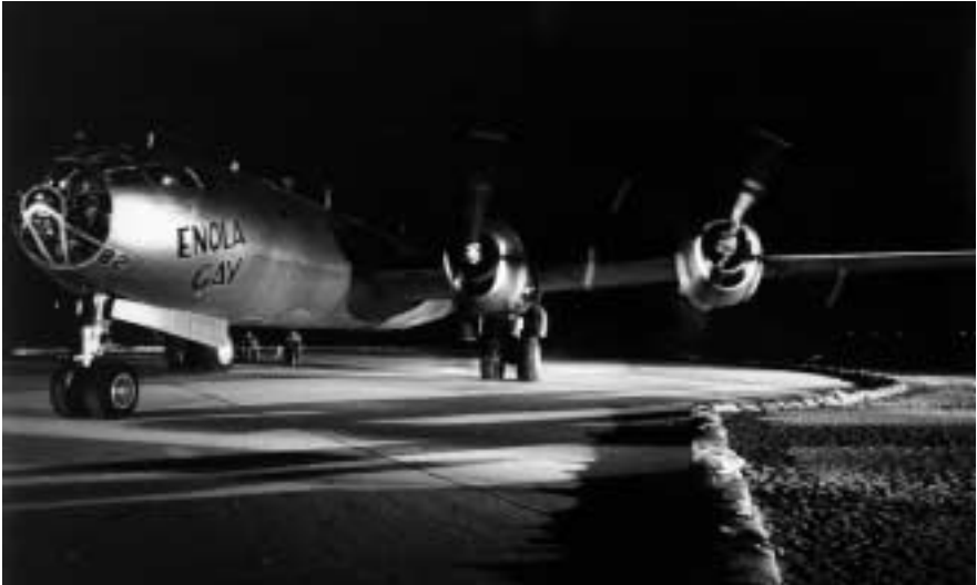
Boeing B-29 Superfortresses dropped atomic bombs on Hiroshima and Nagasaki, Japan.