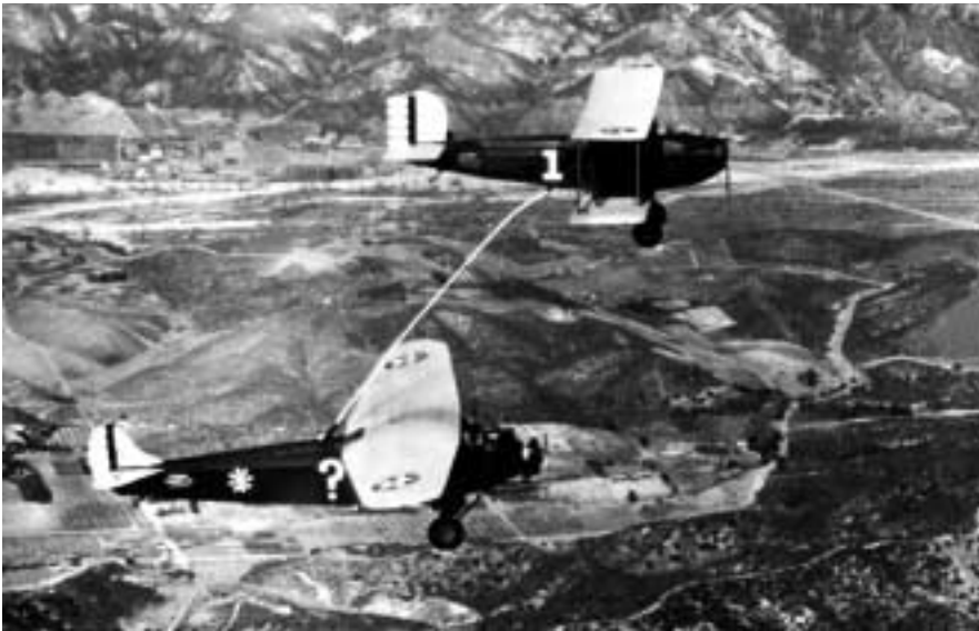
The Question Mark set a flight-endurance record in 1929.