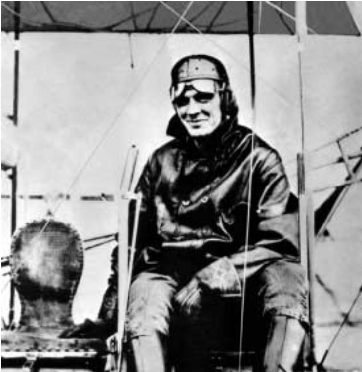
Lt. Henry H. Arnold in a Wright B airplane, College Park, Maryland, 1911. Arnold was commander of the Army Air Forces in World War II.