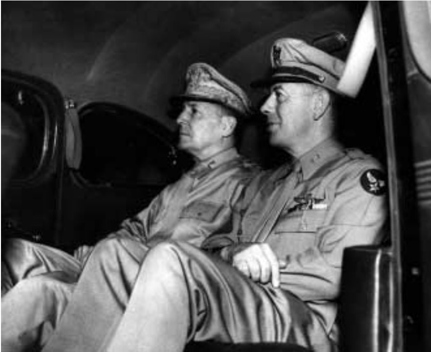
Gen. Douglas MacArthur and Gen. George S. Kenney, head of Fifth Air Force, in the Southwest Pacific during World War II

March 2–4: In the Battle of the Bismarck Sea, Fifth Air Force heavy bombers, medium bombers, light bombers, and fighters attacked a 16-ship Japanese convoy on the way to New Guinea, sinking eight troop-laden transports and four of eight escorting warships. Modified B-25s participated in the attack, using low-level skip bombing for the first time.