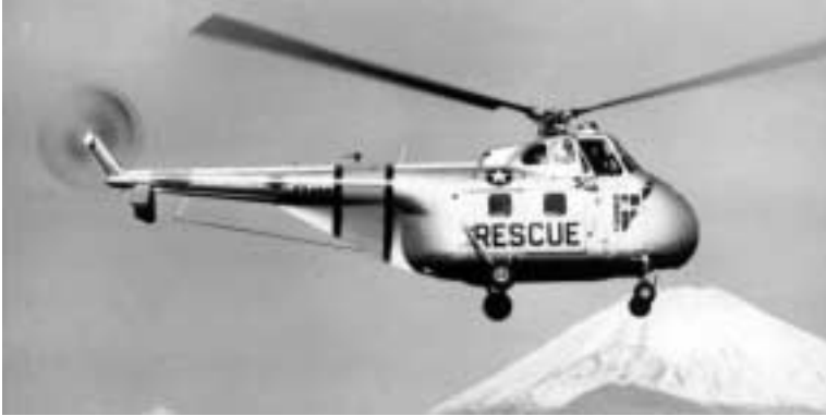
The Air Force rescued 116 U.S. servicemen from behind enemy lines in Korea using the H-19 Chickasaw, first flown in 1949.

April 18: From Holloman Air Force Base, New Mexico, an Aerobee research rocket carried the first primate, a monkey, into space.