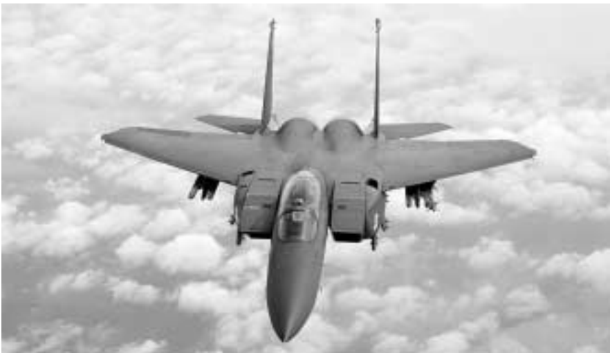
In the last quarter of the twentieth century, the F-15 Eagle served the Air Force as its premier air-superiority aircraft.