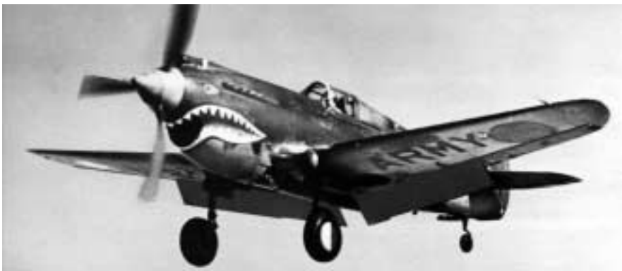
The Curtiss P-40 Warhawk, flown by the Flying Tigers (the American Volunteer Group) in China, also claimed the first aerial victories for the Army Air Forces during the Japanese attack on Pearl Harbor.

December 7: Japanese torpedo bombers, dive-bombers, and fighters from six aircraft carriers attacked naval and air installations around Pearl Harbor, Hawaii, crippling the U.S. Pacific Fleet. In two waves, the Japanese airplanes sank four U.S. battleships and damaged nine other major warships. The surprise attack, which killed some 2,390 personnel, propelled the United States into World War II. Air strikes on Hickam, Wheeler, and Bellows Fields killed 193 members of the Army Air Forces and destroyed 64 of the Hawaiian Air Force's airplanes. Six Army Air Forces pilots shot down 10 Japanese aircraft that day. Second Lt. George S. Welch shot down four, 2d Lt. Kenneth M. Taylor shot down two, and four other pilots each shot down one.