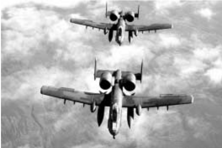
The A-10A features a large gun, armor, high load capacity, long loiter time, and a wide combat radius for close air support.