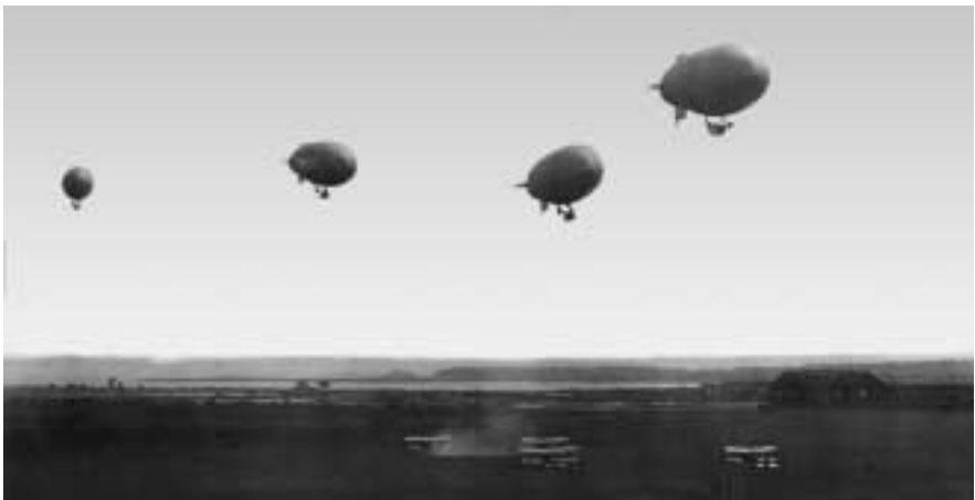
Airships over Langley Field, Virginia, 1921

December 1: The Navy dirigible C-7 became the first helium-filled airship to fly when it journeyed from Hampton Roads, Virginia, to Washington, D.C., and returned.