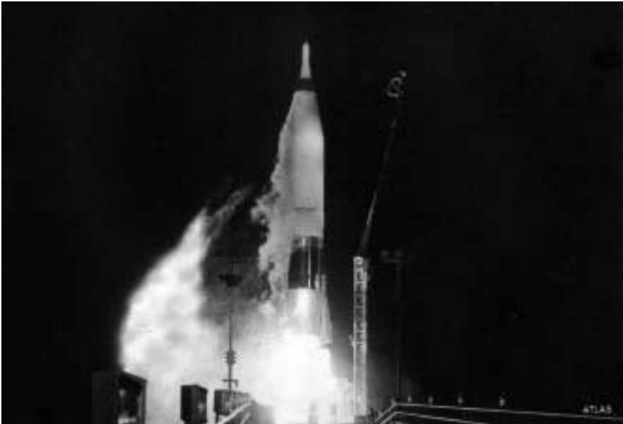
The first generation of U.S. intercontinental ballistic missiles included the Atlas.

June 21: The Air Force directed its Air Research and Development Command to create the Western Development Division under Brig. Gen. Bernard A. Schriever to oversee acceleration of the Atlas intercontinental ballistic missile program.