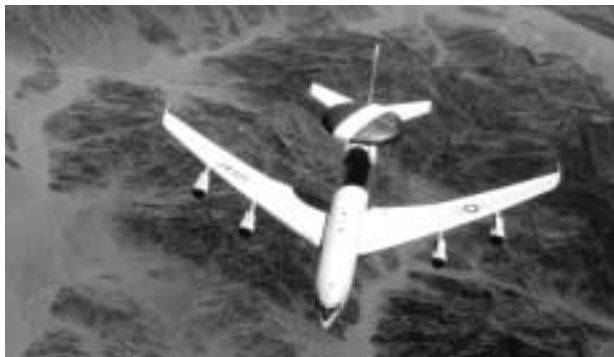
The E-3 Sentry provides all-weather surveillance, command, control, and communications.

March 9: In Operation FLYING STAR, two E-3 airborne warning and control system aircraft deployed to Saudi Arabia in response to a threat on the country's southern border.