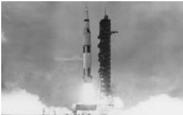
The Saturn V, the largest rocket the United States had ever developed, was designed to send men to the Moon.