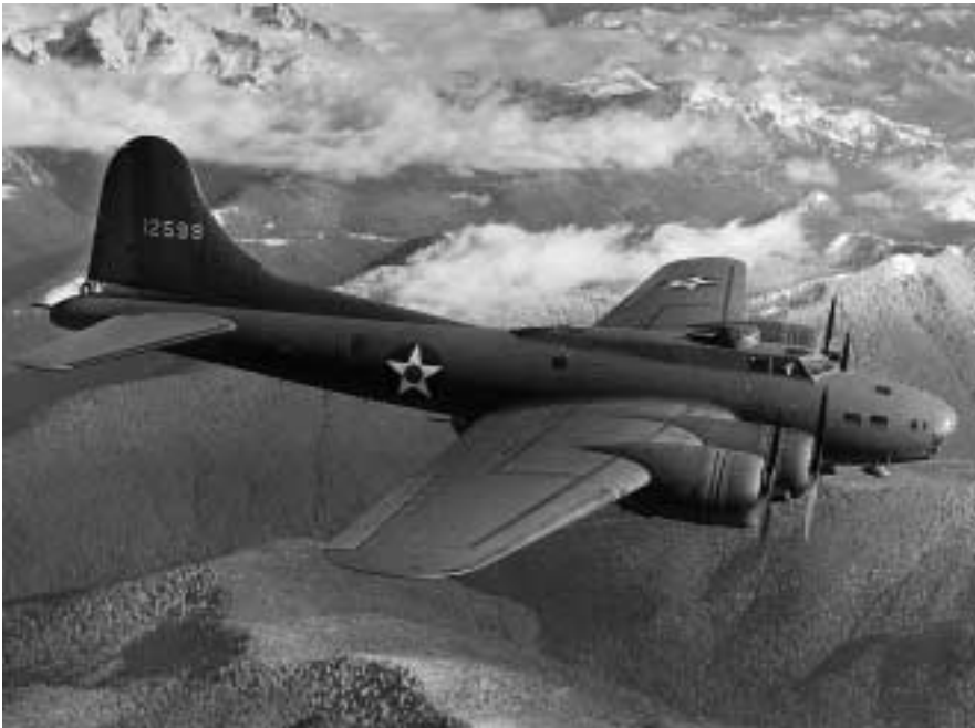
On August 17, 1942, Eighth Air Force inaugurated U.S. strategic bombing of Nazi targets in Europe with the B-17E Flying Fortress.

August 17: Eighth Air Force conducted its first heavy bomber raid in Europe. Twelve B-17s under the command of Col. Frank A. Armstrong, Jr., bombed railroad marshalling yards at Rouen in German-occupied France. The raid demonstrated the feasibility of daylight bombing.