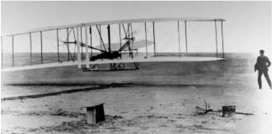
The first powered and controlled airplane flight at Kitty Hawk, North Carolina

December 17: Orville and Wilbur Wright piloted a powered heavier-than-air aircraft for the first time at Kill Devil Hill, near Kitty Hawk, North Carolina. Controlling the aircraft for pitch, yaw, and roll, Orville completed the first of four flights, soaring 120 feet in 12 seconds. Wilbur completed the longest flight of the day: 852 feet in 59 seconds. The brothers launched the airplane from a monorail track against a wind blowing slightly more than 20 miles per hour.