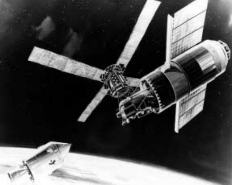
Skylab, a science and engineering laboratory, launched into Earth orbit on May 14, 1973. It fell from orbit on July 11, 1979.