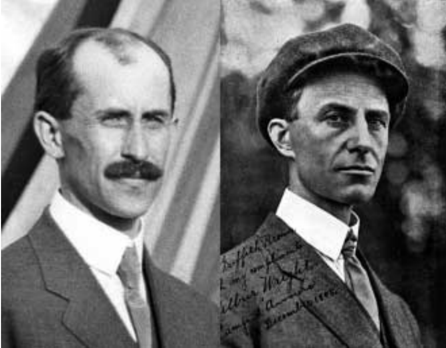
Orville and Wilbur Wright. They took turns flying the first successful airplane.