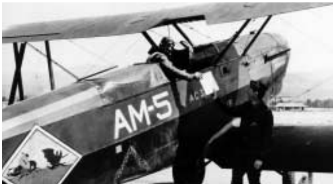
Airmail control officer dispatching a Douglas O-25C at Boise, Idaho

February 19: After President Franklin D. Roosevelt cancelled existing air-mail contracts with commercial airlines because of perceived fraud and collusion, the Air Corps began delivering airmail. The Army initially flew 18 routes, with 62 trips a day—fewer than the commercial carriers had flown. However, the Air Corps could not handle this on just a 10-day notice, so the routes and schedules had to be reduced.