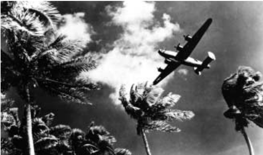
The B-24 Liberator heavy bomber

June 16: The Consolidated B-24 Liberator, a four-engine bomber that could fly faster and farther than the similarly sized B-17, entered the Air Corps inventory. More than 18,000 B-24s were produced during World War II, a greater number than any other U.S. aircraft.