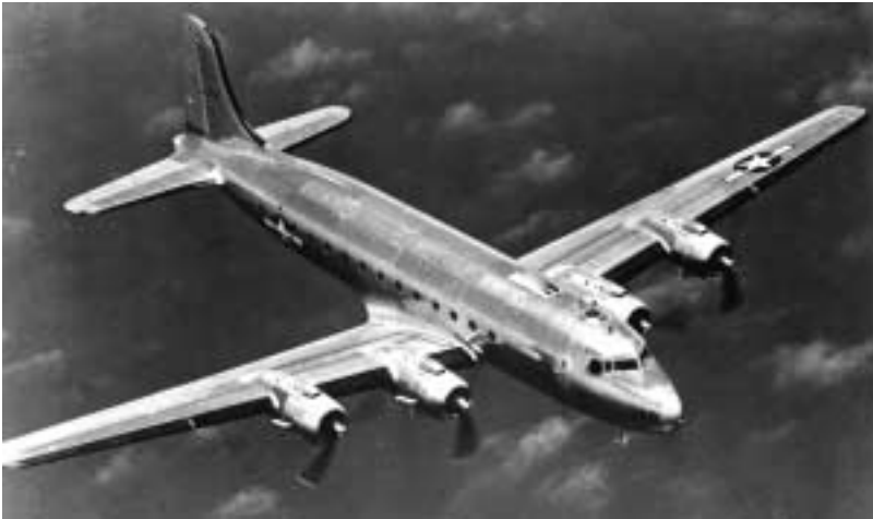
C-54 Skymaster aircraft like this one carried most of the cargo during the famous Berlin airlift of 1948-49.