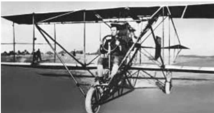
An early Curtiss aircraft equipped with a steering wheel

August 4: Elmo N. Pickerill made the first radio-telegraphic communication between the air and ground while flying solo in a Curtiss pusher from Mineola, Long Island, to Manhattan Beach and back.