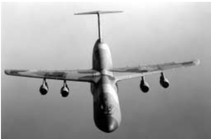
The C-5 Galaxy