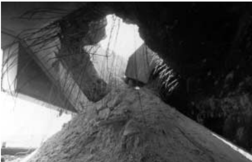
A hardened aircraft shelter in Iraq after air attack with precision-guided munitions

January 22: The Air Force began using precision-guided munitions against Iraqi hardened aircraft shelters. These attacks were so successful that Iraqi fighters began flying to Iran to escape destruction.