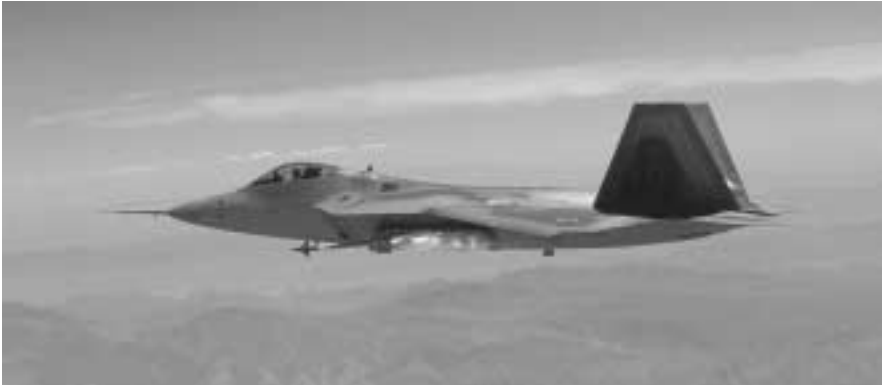
An F-22 Raptor launches an AIM-9 Sidewinder missile during a test.

September 7: At Dobbins Air Reserve Base, Georgia, test pilot Paul Metz piloted the extremely maneuverable F-22 Raptor in its first flight. A new stealth fighter with the ability to cruise supersonically, the F-22 would replace the venerable F-15 for air-superiority missions.