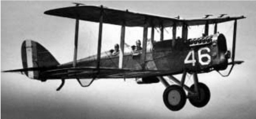
The DeHavilland DH-4. Many U.S. Air Service pilots in France during World War I flew this British-designed airplane.