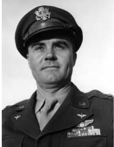
Col. Paul W. Tibbets, Jr., led the atomic attack on Hiroshima.

August 9: Three days after the destruction of Hiroshima, Maj. Charles W. Sweeney and his crew, flying a B-29 called Bock's Car , bombed Nagasaki in the second and last atomic bomb attack, which largely destroyed the city and killed at least 35,000 people.