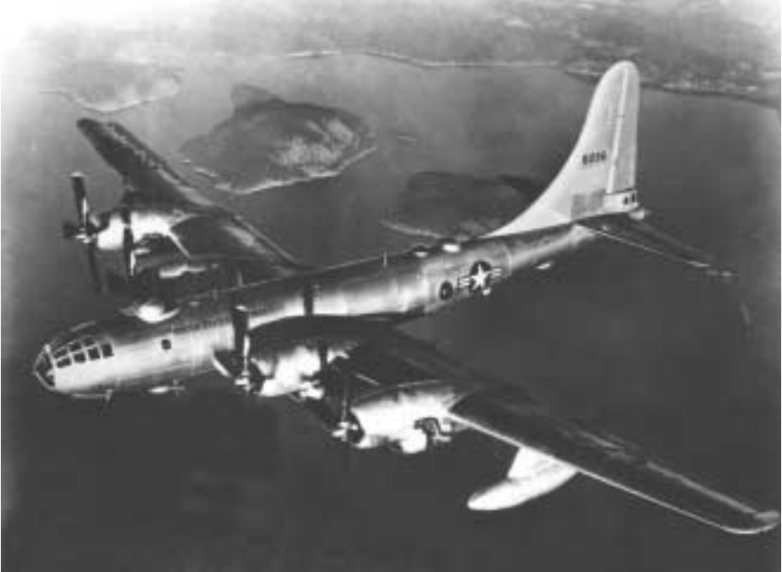
Above: The Boeing B-50 Superfortress, essentially an improved version of the B-29. Below: When the B-36 Peacemaker flew in March 1949, it was the largest bomber ever built, carrying six propeller engines, later supplemented with four jet engines, two on the end of each wing.