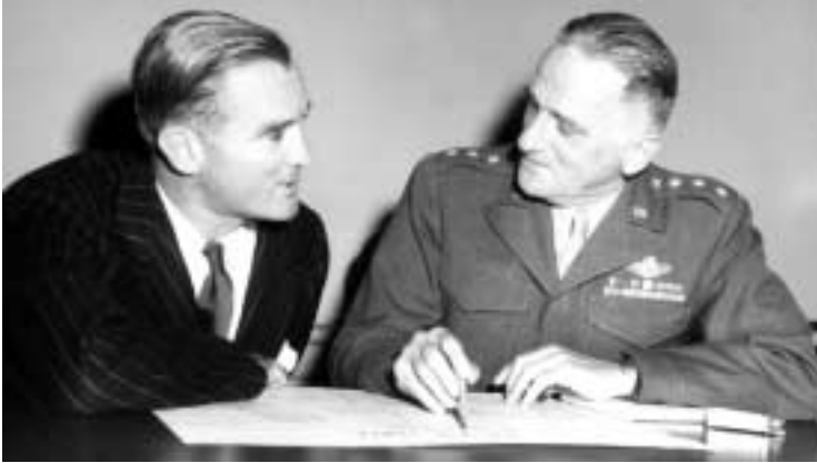
W. Stuart Symington, the first secretary of the Air Force, and Gen. Carl A. Spaatz, the first USAF chief of staff, in 1947

October 14: Capt. Charles E. “Chuck” Yeager made the first faster-than-sound flight at Muroc Air Base, California, in a rocket-powered USAF research plane—Bell XS-1—and won the Mackay Trophy for the most meritorious flight of the year.