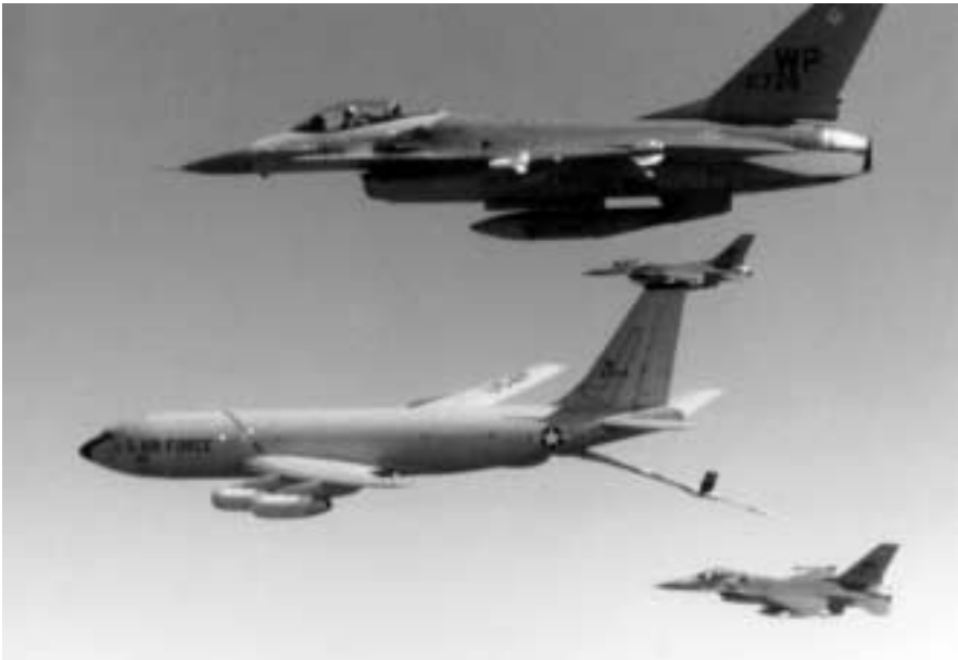
The KC-135 Stratotanker, the first jet tanker in the USAF inventory, refueled a variety of aircraft, including F-16 fighters, pictured here.