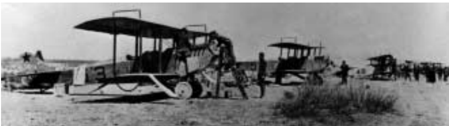
Curtiss JN-3s of the 1st Aero Squadron at Columbus, New Mexico, during the campaign against Pancho Villa, 1916

April 7: Mexicans fired on Army aviators Lt. Herbert A. Dargue and Capt. Benjamin D. Foulois at Chihuahua City, Mexico, when they landed with dispatches for the U.S. consul.