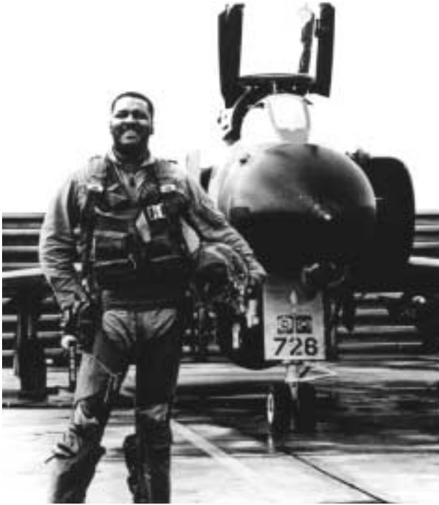
Col. Daniel "Chappie" James, Jr., next to his F-4 Phantom in Thailand during the Vietnam War