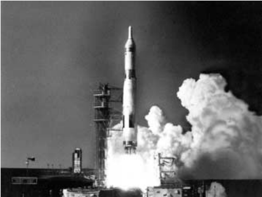
Test launch of a Titan I missile

April 18: At Lowry Air Force Base, Colorado, Strategic Air Command declared operational the Air Force's first Titan I unit—the 724th Strategic Missile Squadron. Its nine missiles were the first to be placed in hardened underground silos.