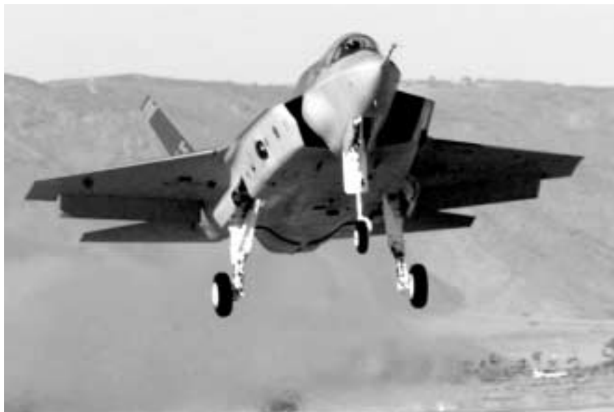
Lockheed Martin's X-35A Joint Strike Fighter landing at Edwards Air Force Base, California, after its first flight on October 24, 2000

earned the Mackay Trophy by rescuing another MH-53 crew whose helicopter had crashed on a rescue mission in the mountains of Afghanistan.