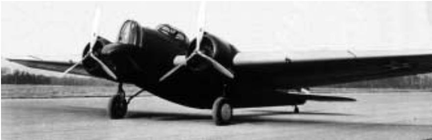
The Martin B-10 bomber featured an enclosed cockpit and retractable landing gear.

November 27: The Army accepted delivery of its first production-model Martin B-10, the nation's first all-metal monoplane bomber produced in quantity. The twin-engine airplane featured an internal bomb bay, retractable landing gear, rotating gun turret, and enclosed cockpit. A precursor of World War II bombers, the B-10 could fly faster than contemporary pursuit aircraft and much faster than previous biplane and triplane bombers.