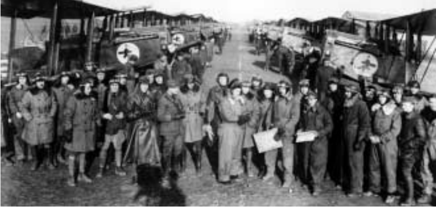
Personnel of the 11th Aero Squadron Day Bombardment, Maulan, France, 1918