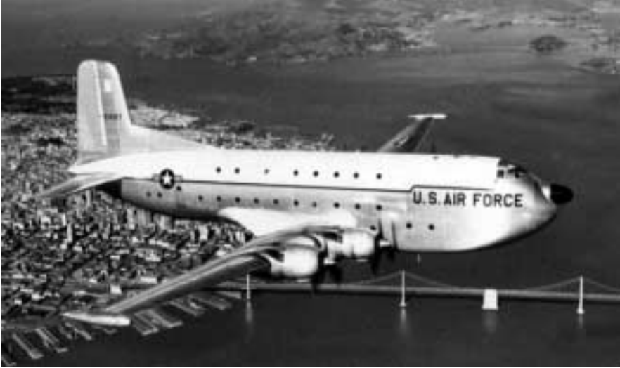
The Douglas C-124 Globemaster II could be loaded through large clamshell nose doors.

October 23: The first production B-47 Stratojet medium bomber entered service with the 306th Bombardment Wing, Medium. This aircraft became the workhorse for Strategic Air Command through most of the 1950s.