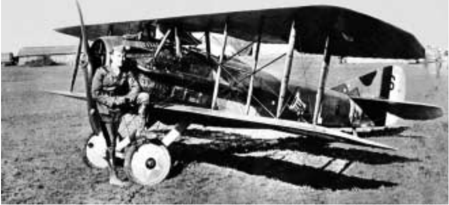
Capt. Edward V. Rickenbacker and a Spad 13