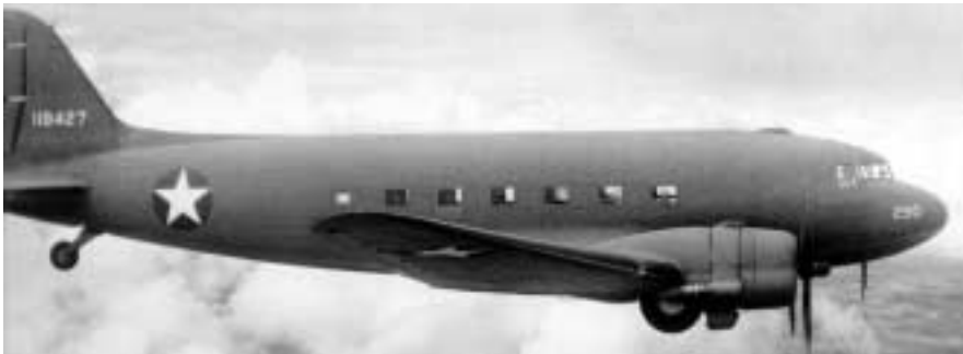
The Douglas C-47 Skytrain, derived from the DC-3 commercial airliner of the 1930s, served the Army Air Forces during World War II and the Air Force for decades after the war.

November 8: Operation TORCH, the Anglo-American invasion of North Africa, began with amphibious landings in Morocco and Algeria. Twelfth Air Force supported the invasion with troop-carrying C-47s of the 60th Troop Carrier Group and Spitfire fighters of the 31st Fighter Group.