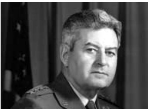
Gen. Curtis E. LeMay became commander of Strategic Air Command in 1948 and chief of staff of the Air Force in 1961.

February 20: Strategic Air Command received its first B-50 Superfortress bomber, an improved version of the B-29 with larger engines, a taller tail fin and rudder, and equipment for in-flight refueling.