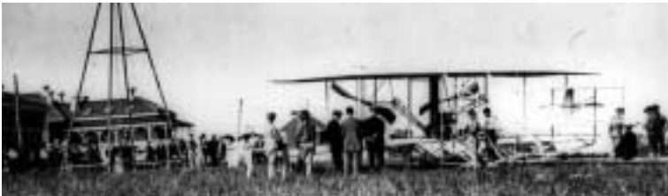
The first Army airplane, a Wright Flyer

August 25: The Army leased land at College Park, Maryland, for the first Signal Corps airfield.