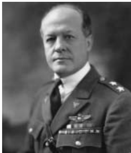
Maj. Gen. Benjamin D. Foulois, chief of the Air Corps from 1931 to 1935