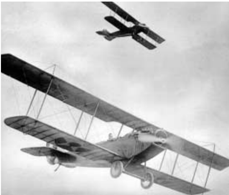
Many Air Service pilots first learned to fly in the Curtiss JN-4 “Jenny.”