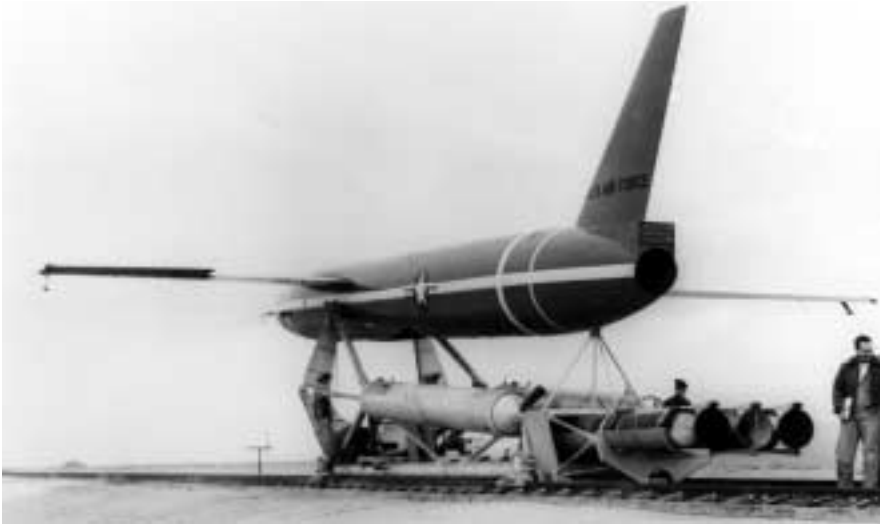
The Snark was the nation's first intercontinental guided missile.

November 26: The Northrop B-62 Snark—a turbojet-powered, subsonic, long-range missile—flew for the first time.