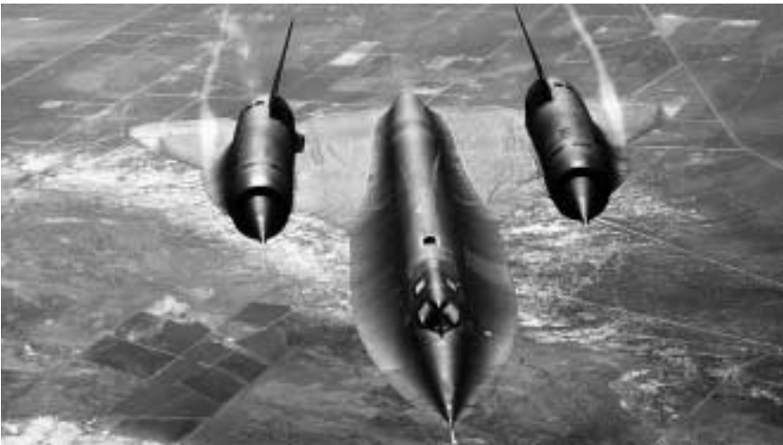
The Lockheed SR-71 Blackbird, a strategic reconnaissance aircraft and the world's fastest and highest-flying production airplane, first flew in 1964.

January 1: The Air Force's first SR-71 Blackbird unit, the 4200th Strategic Reconnaissance Wing, activated at Beale Air Force Base, California. The SR-71 could attain a speed of more than Mach 3 and altitudes beyond 70,000 feet, but it required special fuel and maintenance support.