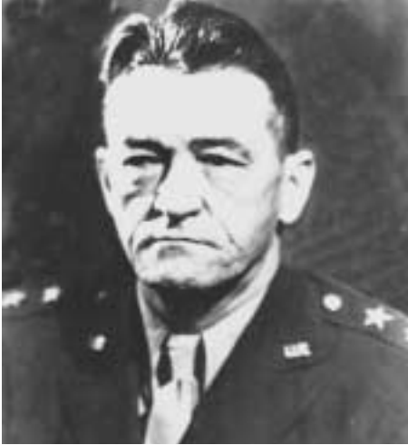
Maj. Gen. Claire Chennault, commander of Fourteenth Air Force in 1943