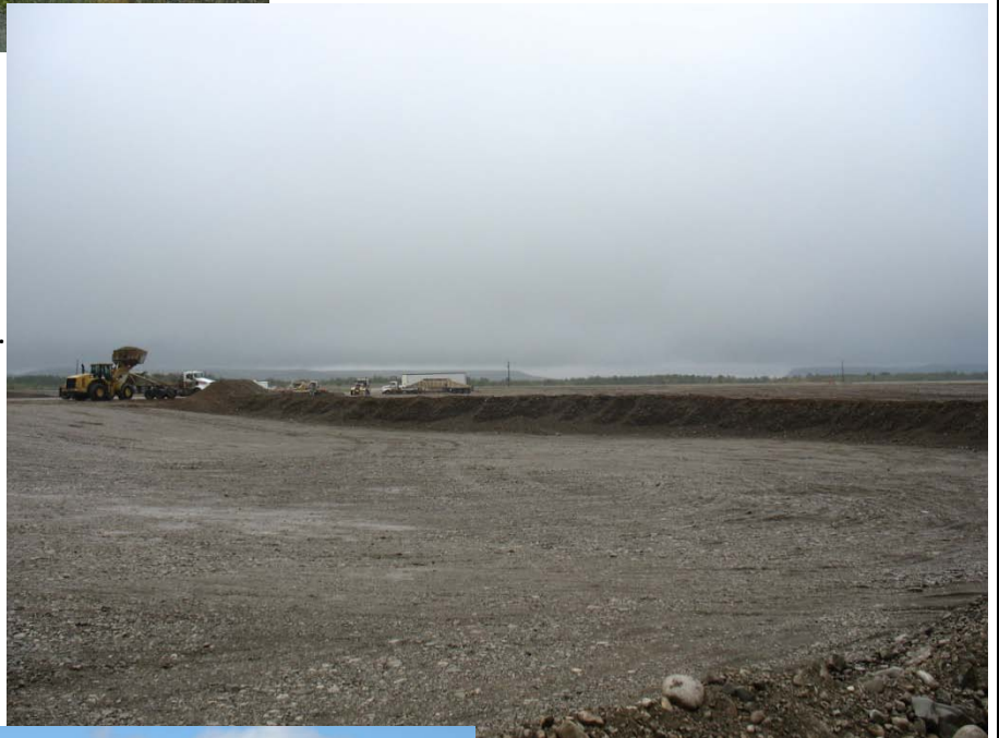
Pit clearing and embankment material mining at the Pebbles Pit.