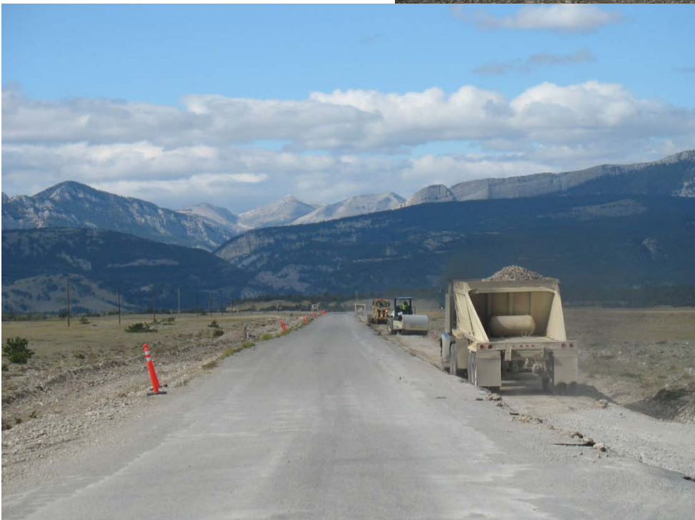
Building up and shaping new side slopes.