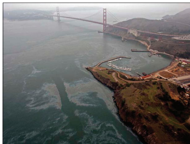
Cosco Busan, San Francisco Bay - see case highlights.