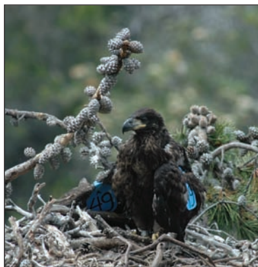
Montrose Settlement Restoration Program, Palos Verdes - see case highlights.