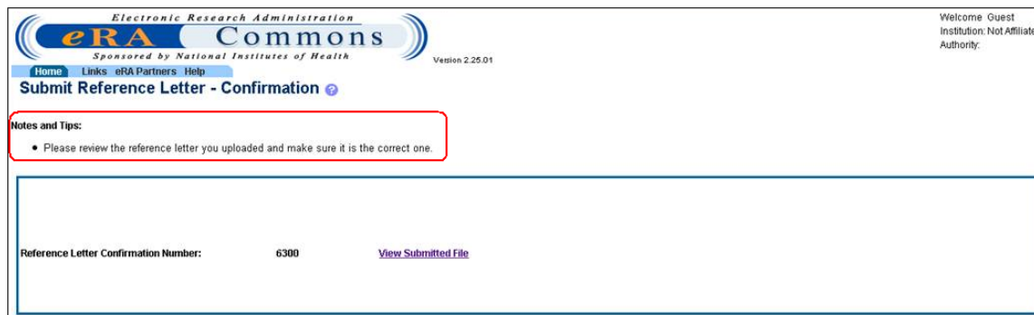
Figure 7: Submit Reference Letter – Confirmation Screen

Please review the reference letter you uploaded, and make sure it is the correct one.