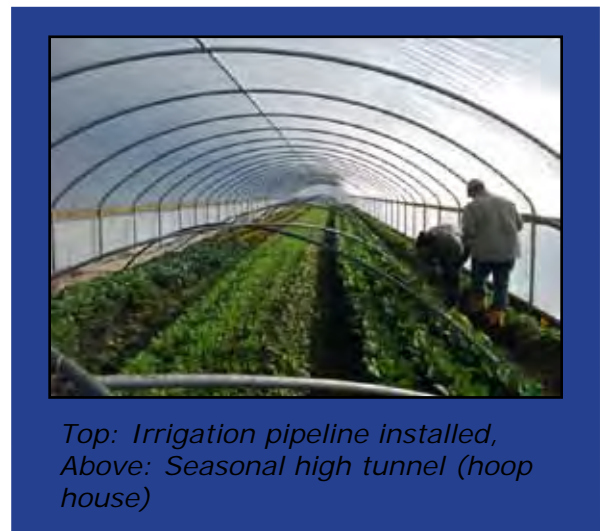
Top: Irrigation pipeline installed, Above: Seasonal high tunnel (hoop house)

Irrigation efficiency and the need for reliable water sources for productivity on limited resource and socially disadvantaged owned and operated farms is a pressing and urgent priority in rural counties in North Carolina. North Carolina Department of Commerce has divided our state into three tiers. Each tier represents counties that are identified as economically depressed. North Carolina's Coastal Plain region consists of 41 counties. Of the 41 counties, all but five are in tiers one and two with most being in the tier one category for greatest economic distress. Furthermore, the Coastal Plain region has the largest proportion of cropland and is the most ethnically diverse in the state. For these reasons, NRCS identified 23 counties in the Northern Coastal Plain region to be part of a pilot project to focus Farm Bill assistance to address water quality and quantity, and other conservation needs on agricultural lands.