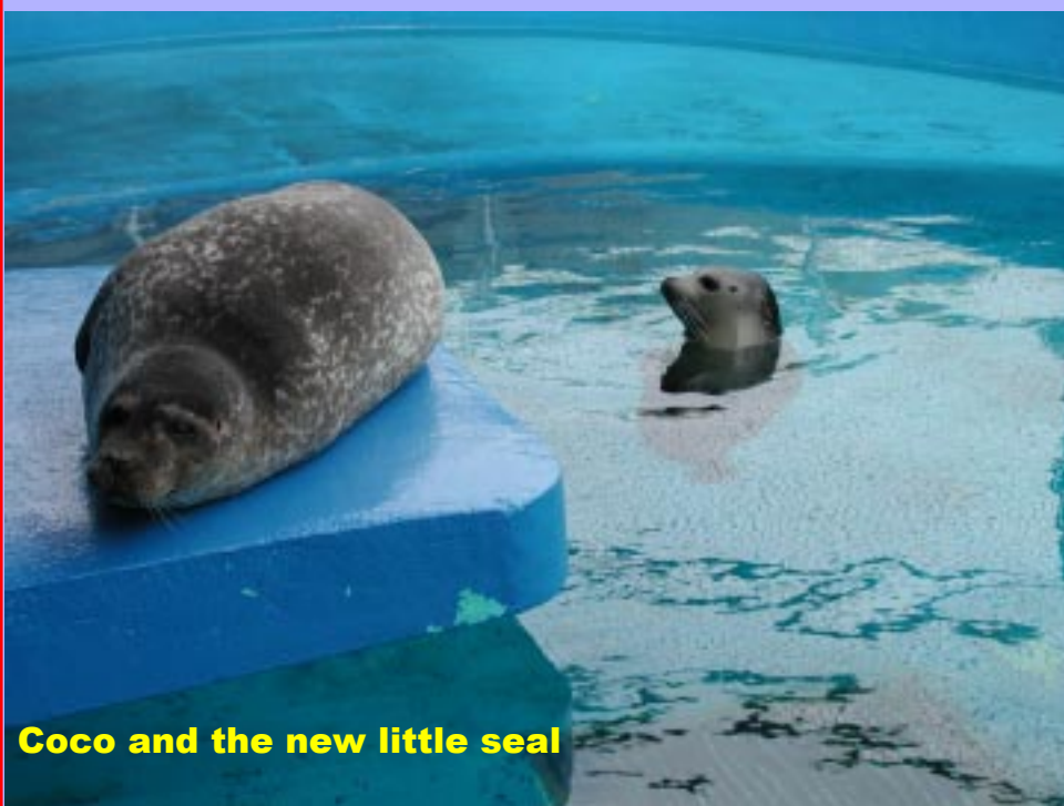
Coco and the new little seal