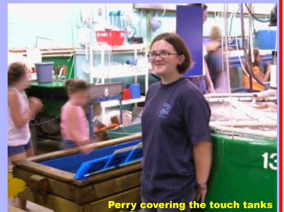
Perry covering the touch tanks