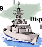
Display Ship Barry

Pass/ID Office 202-433-3017 Parking Information 202-433-2239 Yellow Cab 202-544-1212 Diamond Cab 202-387-6200 Fire/Ambulance 202-433-3333 Police 202-433-2411