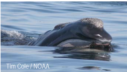
Tim Cole / NOAA