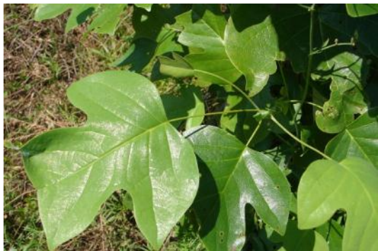
(Left) Yellow-poplar seedling on Gatliff Coal Company mine site. (Right) Tennessee mine site planted in 1959.