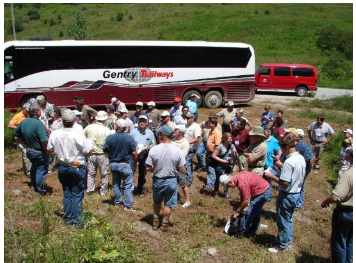
The ARRI conference tour moved through the mine sites by bus, stopping at several places along the way. Tour participants listened to speakers describe the reclamation they saw.