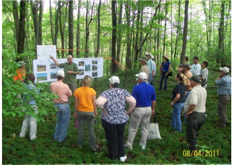
The forest depicted in these top three photos is a pre-SMCRA mine site planted in uncompacted soil in 1959. The tree species used in planting were black locust and pine species, although many other species are now present. The ARRI conference members enjoyed hearing about the history of this mine site and took a walk through the forest to view the tree species.