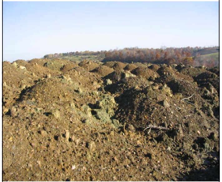
The replaced material in this photo has a good seed base of ginseng, may apples, wild flowers and other mature trees already growing in the area. The old tree roots will offer organic material for the newly planted trees.