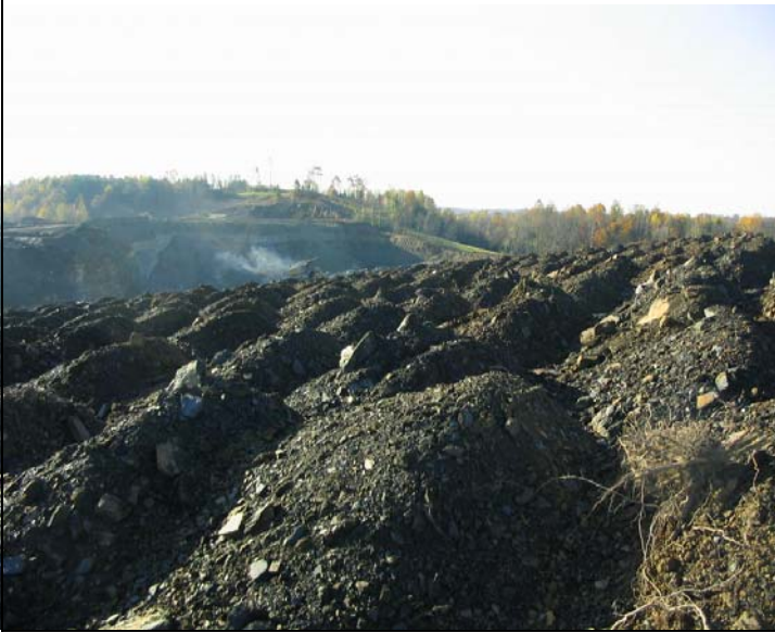
This picture shows a close-up of old tree roots in the re-spoiling material with an active pit in the background. Because this site was previously mined there is little or no topsoil left for cover, therefore ARM was used as top soil substitute.