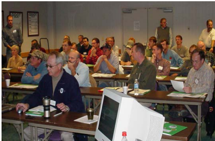
Attendees listened to a presentation about ARRI and FRA at the New Philadelphia, Ohio workshop.

workshops were the first of many planned for in Appalachia discussing ARRI and the use of FRA.