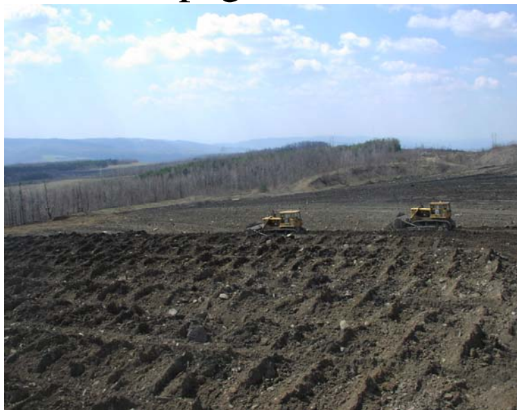
D-9 bulldozers pushed soil from the stockpile area and deposited it on the surface of the demonstration plots. The bulldozers then pushed a blade full of soil to the back of the demonstration plots, butting each against the previous. In this manner, the topsoil was never compacted by bulldozer traffic.

The initial results appear to show greater tree growth and survival rates on the FRA sites, although a late summer drought in 2005 has affected the results on Plot #1. It will require at least one or two more growing season before the benefits can be visually observed.