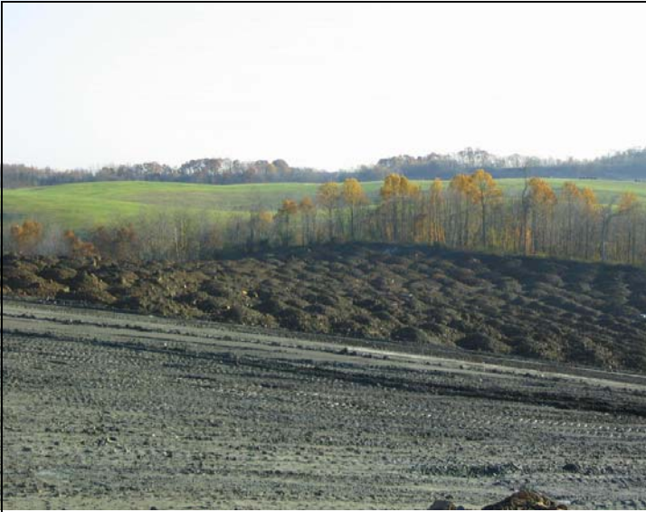
Jockey Hollow Wildlife Area, Ohio. In front of the tree line, Cravat Coal Company has used Alternative Respoiling Material, or ARM, to prepare the area for tree planting this spring. Behind the tree line is an area that was previously reclaimed to traditional pastureland.

The following pictures show examples of the Forestry Reclamation Approach on a reclaimed mine site in Ohio before the trees have been planted.