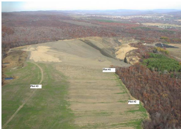
Three areas of Savage Mountain demonstrate the Forestry Reclamation Approach .