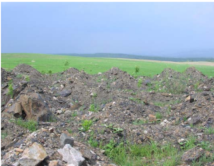
This photo shows the loose soil on the surface of the mine. Tree seedlings have been planted.