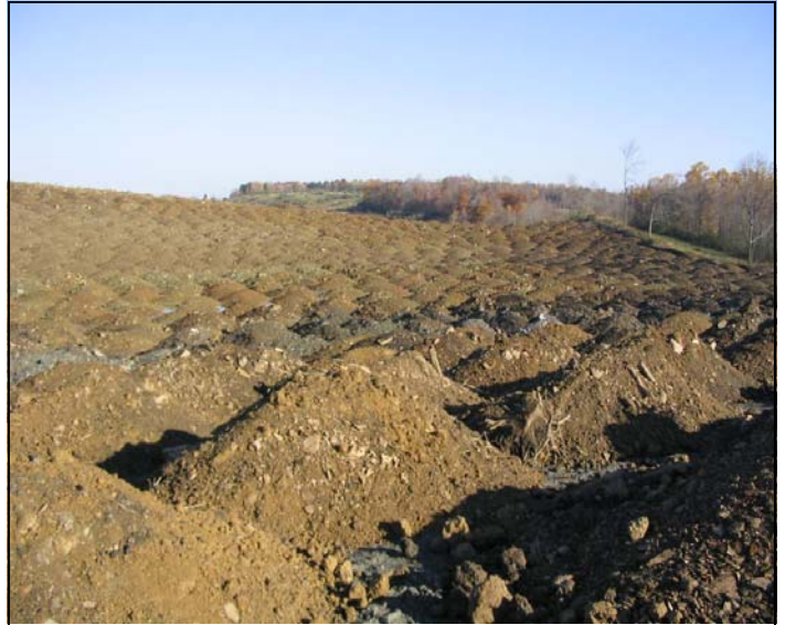
This site at Jockey Hollow is approximately 25 to 35 acres. This spring, each acre will be planted with 600-800 trees per acre consisting of a wildlife forest mixture. There will be an estimated 21,000 trees on this reclaimed mine site.