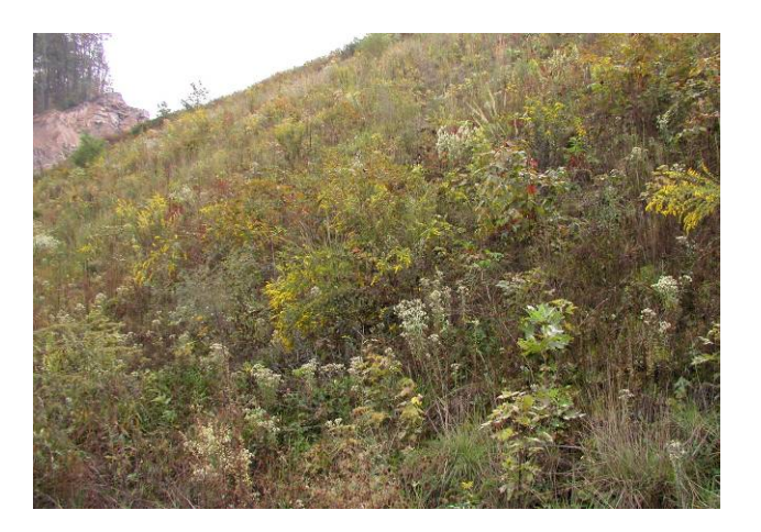
Figure 1. Ground cover vegetation on coal mine sites.

Natural processes can establish ground cover readily when soil conditions are favorable for reforestation: uncompacted, with a rough surface; constructed from topsoil and/or weathered brown sandstones, either alone or mixed with overburden; and with pH in the range of 5.5 – 6.5. On steep slopes, on areas far from native seed sources within large mining operations, and in states with specific ground cover standards, grasses and legumes will need to be sown even when using the FRA.