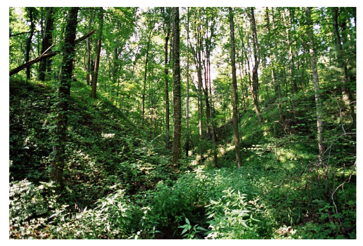
Photo 1. Succession and invasion of native species over 47 years formed a forest on this mine site in eastern Tennessee. This site was mined and reforested with various pine species and black locust in 1959 on un-compacted spoil with no planted ground cover. Succession has occurred over the years and the pine forest has been replaced with vegetation similar to the nearby native forest: yellow-poplar dominant in the overstory, red maple, sassafrass and northern red oak in the mid-story, and blueberries, ground pine, Virginia creeper and ferns in the understory

This advisory describes the ways in which reclamation methods can encourage rapid succession and accelerate development of high quality postmining forests.