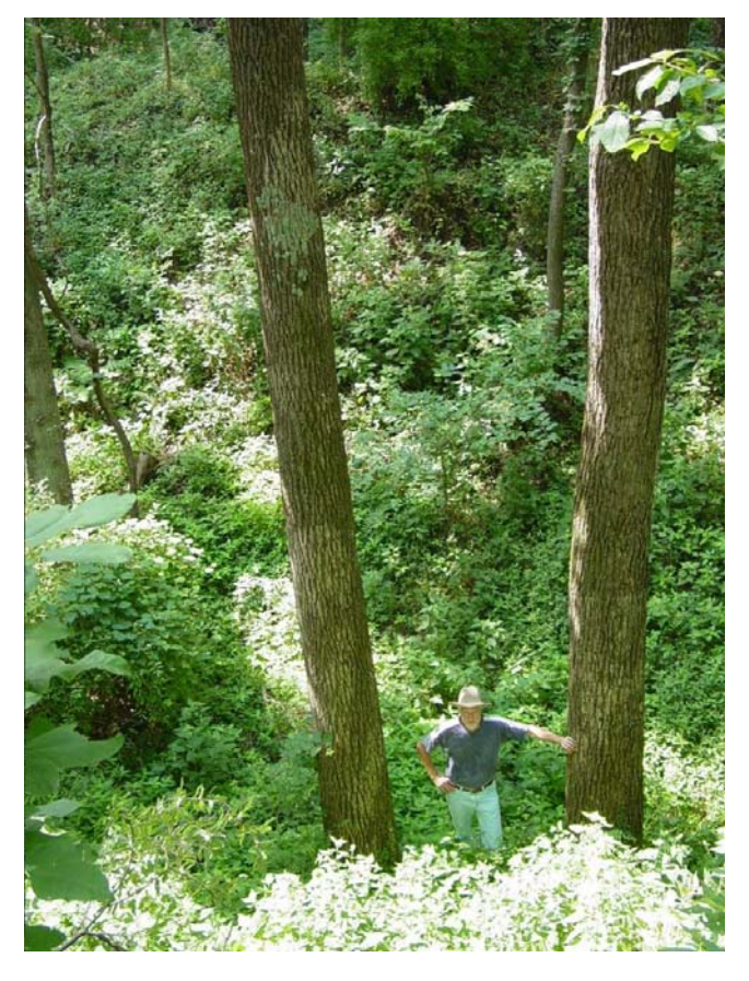
Photo 3. These 55-year-old black walnut trees were planted and grew on spoil banks in Pike County, Indiana.

Rooting medium quality: If soil replacement results in a rooting medium that is shallow or has been compacted, the site will be prone to drought and plant nutrition problems. Mine soil pH that is too high (pH>7) or too low (pH<5) and mine soils that have high levels of soluble salts can also cause plant nutrition problems. Seeds of unplanted forest species that are carried to the mine site by wind or wildlife will not germinate and grow if the soil surface is compacted or has chemical properties that are not well suited to their needs. Those grass and shrub species that are able to establish and grow on such soils will dominate on such sites, and forest succession will progress slowly. In contrast, a deep and loose growth medium that contains plant nutrients encourages invasion and canopy development by species from the native forest. These soil properties promote a diversity of trees and other vegetation and are productive for timber and wildlife.