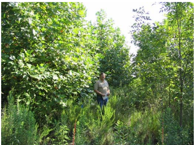
Photo 2. On this eight year old mine site in Perry County, Kentucky the following species of trees were planted: white oak, white ash, eastern white pine, northern red oak, black walnut, and yellow poplar. The high-quality growth medium on this site (loose-dumped, uncompacted mine spoils) allowed planted seedlings to achieve greater survival and faster growth while allowing more invasion by non-planted forest species, compared to an adjacent mine site that was graded using conventional practices (Angel 2006).

After harvest in natural forests, most regenerating hardwood trees grow as sprouts from well-established root systems. This type of regrowth cannot occur on reclaimed mines because those rooting systems have been removed. Unless native forest soils are used in reclamation, mine sites lack the seed and bud banks (live seeds on or in the forest floor and buds that can produce sprouts) of native forests so the vegetation immediately following reclamation is unlikely to be as diverse.