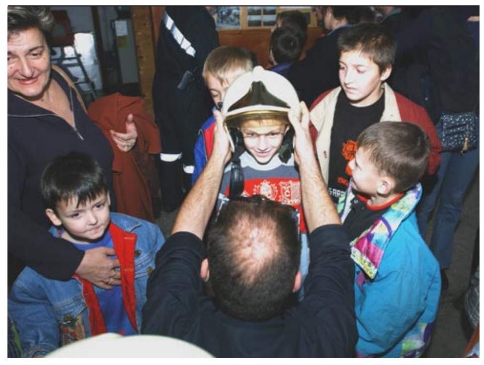
A few years ago angry mobs were staging protests throughout Bosnia and Herzegovina. Today, the country has become more unified despite its diverse, ethnic mix.

Despite having European forces overseeing the peace in his country and ongoing diplomatic discussions over land rights,