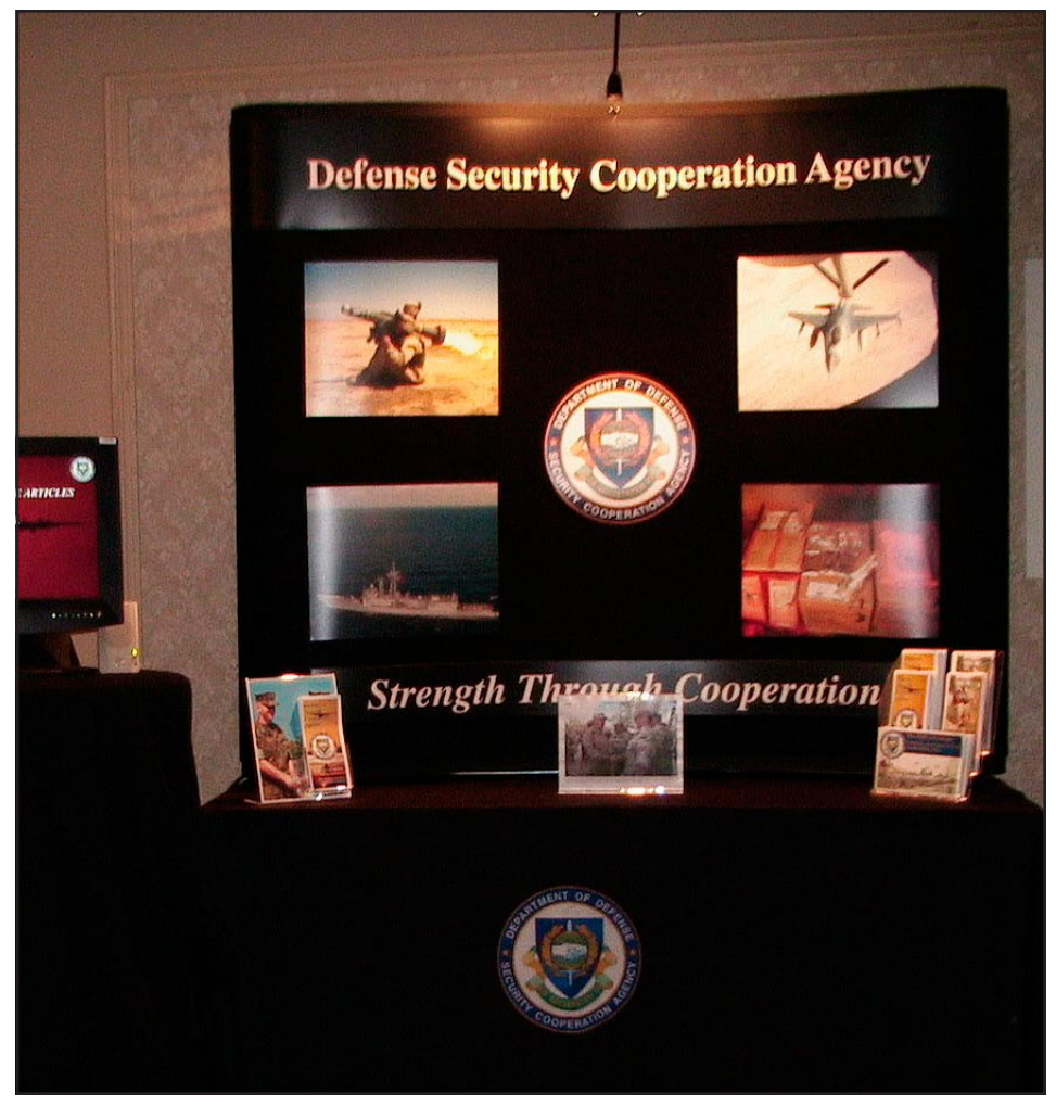
During the upcoming conference, organizations will set up displays representing many elements of the security cooperation community.