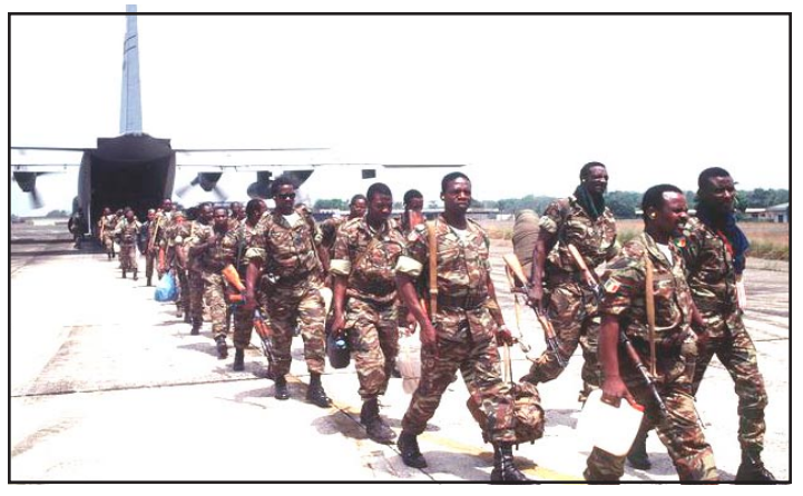
GPOI is a five-year international initiative with the primary goal of training and equipping 75,000 military troops, a majority of them African, for peacekeeping operations by 2010.

He said, "State will obligate much of this funding through current contracts, but has transferred $27.34 million to DSCA. Currently DSCA Country Program Directors are working with the combatant commands to definitize requirements. To date, 17 of 29 requirements packages have been sent to State for approval, and five Letters of Offer and Acceptance, prepared by the military departments, have resulted so far."