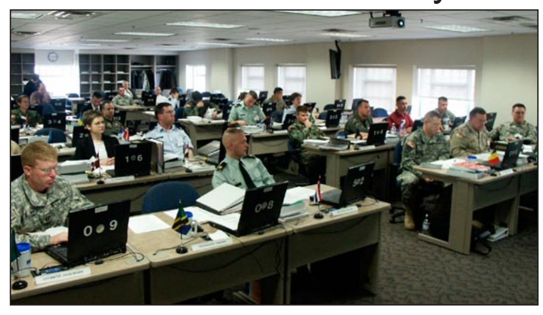
Activation of the Professional Development On-line Certification Application and Tracking system will assist future students with career planning.

The DoD guidelines describe the certification portion of the personnel initiatives. The International Affairs Certification and Career Development Guidelines (IAC&CDG) are established primarily for personnel performing International