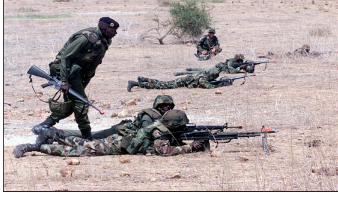
U.S. special forces assist Kenyan soldiers during one of that country's many combat training exercises.

GPOI is a multilateral, five-year international initiative with the primary goal of training and equipping 75,000 military troops, a majority of them African, for peacekeeping operations by 2010.