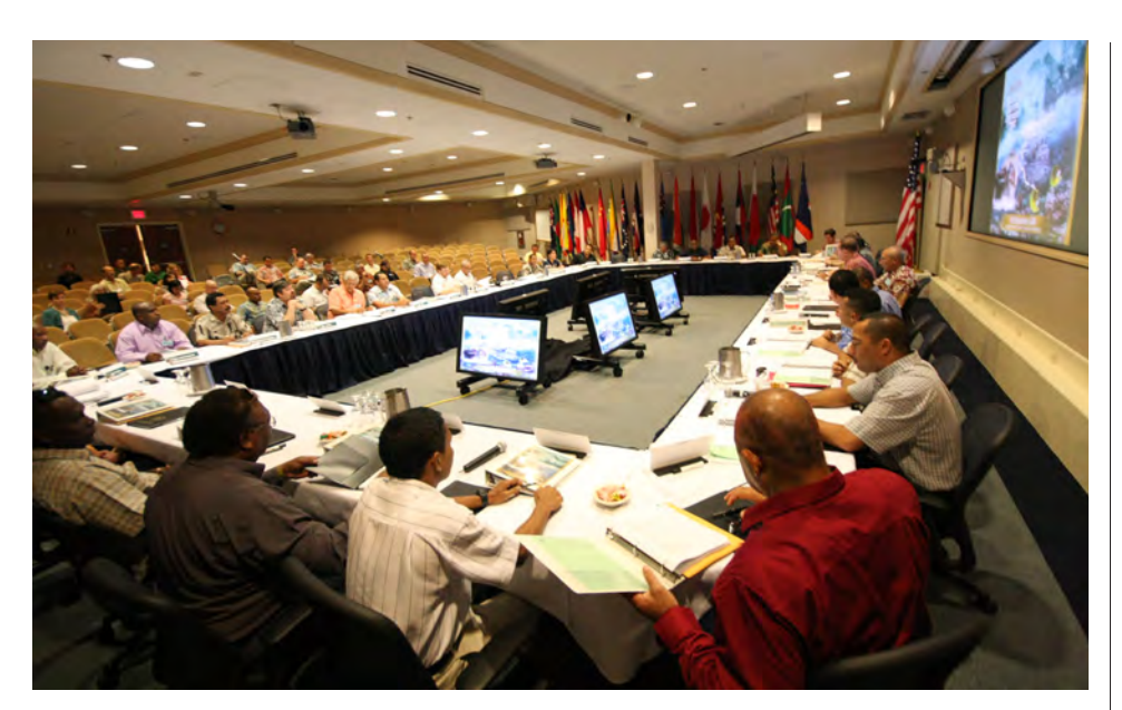
APCSS hosted the Maritime Security in the Pacific Island Region. The workshop focusing on developing awareness, sharing ideas and identifying challenge's Pacific Island nations face.