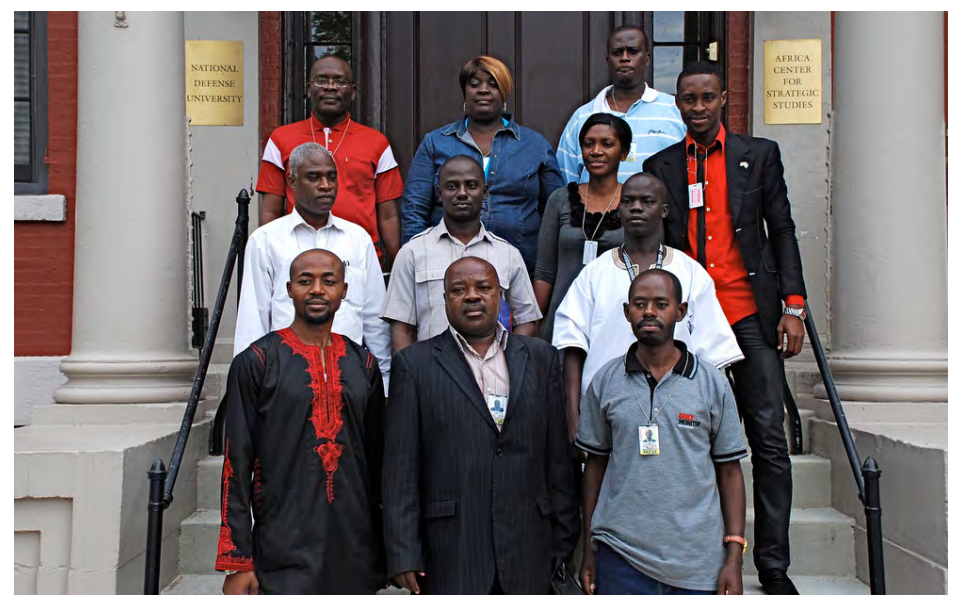
The journalists who visited the Africa Center represent a combined total audience of more than 100 million.