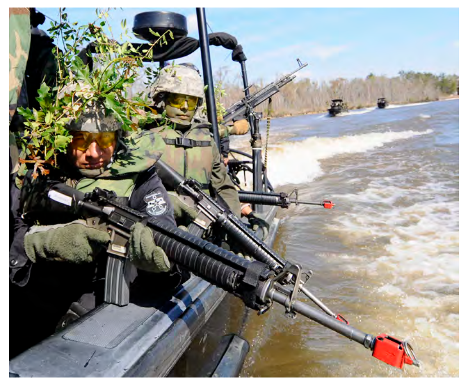
Students from various partner nations train during one of four past joint Field Training Exercises held at NAVSCIATTS.