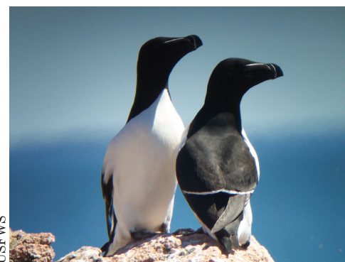
Seabird restoration activities help Razorbill colonies.