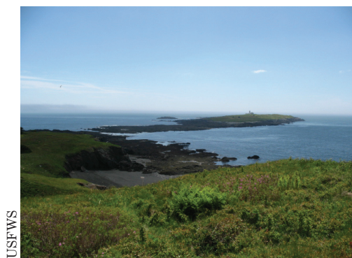
Maine Coastal Islands National Wildlife Refuge