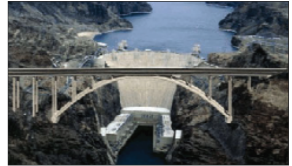
Hoover Dam Bridge Project

Hoover Dam Bypass Bridge on US-93 in Arizona and Nevada. Construction of a bridge over the Colorado River.