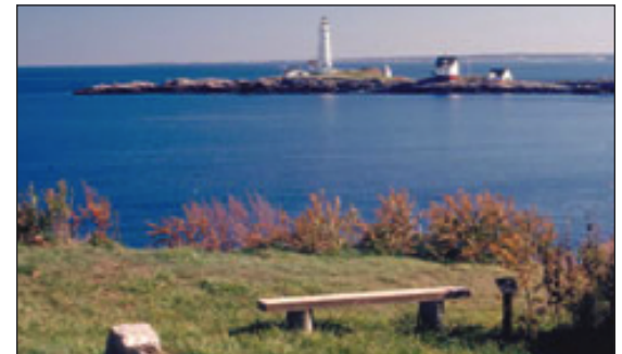
Boston Harbor Islands National Park