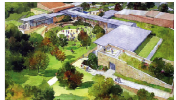
Chickasaw Cultural Center