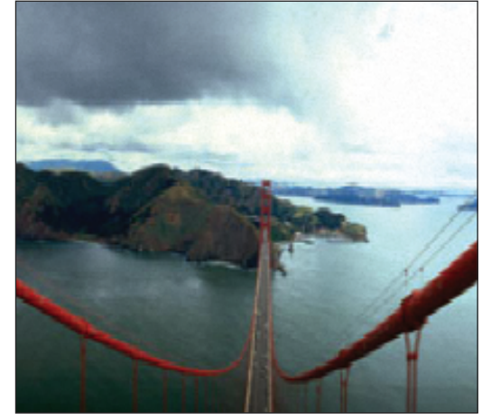
Golden Gate National Park

been used for transit facilities, parking lots, roadside rest areas, bike trails, walkways, and transportation planning activities. The 2005 Safe, Accountable, Flexible, Efficient Transportation Equity Act: A Legacy for Users (SAFETEA-LU) authorized over $1.65 billion for the PLH program for FY 2005-2009, of which 34 percent is discretionary.