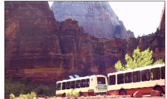
Zion Canyon Scenic Drive, Zion National Park