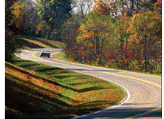
Natchez Trace Parkway

parkways, bridges, and tunnels under NPS jurisdiction, providing access to over 275 million visitors every year. From 2003-06, PRP funded 912 miles of road improvements and 62 bridge repairs. The 2005 Safe, Accountable, Flexible, Efficient Transportation Equity Act: A Legacy for Users (SAFETEA-LU) authorized $1.05 billion for the PRP program for FY 2005-09.