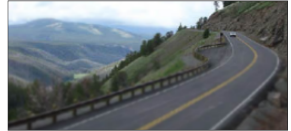
Grand Loop Road, Yellowstone National Park

Mammoth Cave South Entrance Road. The Eastern Federal Lands Highway Division (EFLHD) rehabilitated 6.2 miles of the South Entrance Road and reconfigured two intersections leading to Mammoth Cave National Park, in Kentucky, and the park's visitor-center parking areas. EFLHD constructed a new 0.4-mile-long bus access road linking into a rehabilitated visitor center parking area to improve visitor access and pedestrian flow. Reconstruction of the South Entrance Road has improved park visitor traffic flow, making the road the preferred access route into the park.