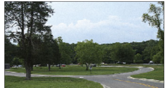
Visitor Center Parking, Mammoth Cave National Park