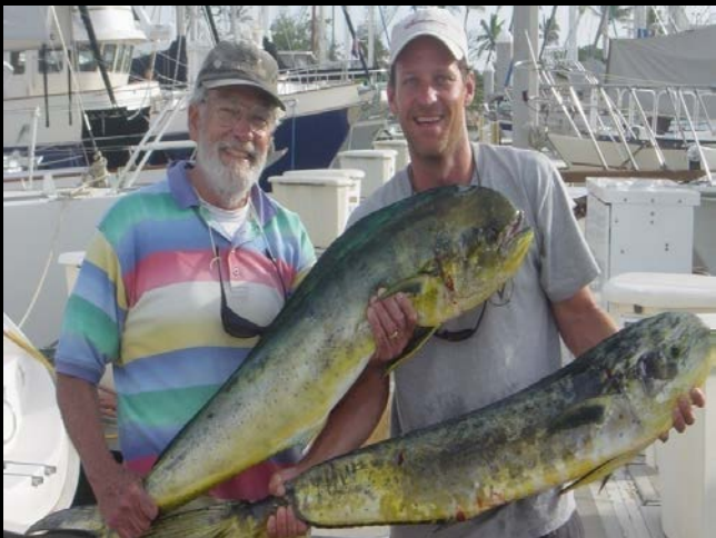
Turning the Corner in Fisheries Management