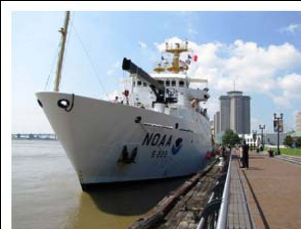
NOAA Ship Thomas Jefferson in port in New Orleans, Louisiana, before heading out for its mission.