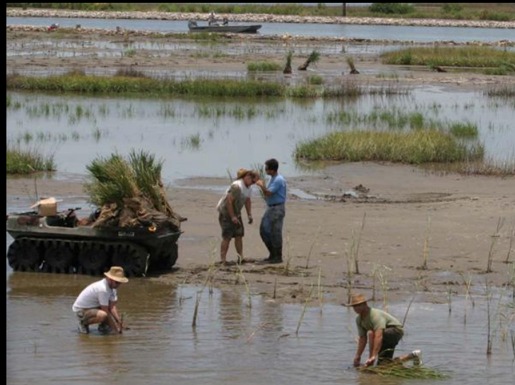
Restoration of the Gulf of Mexico