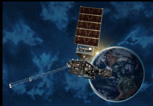
Improved satellite capabilities