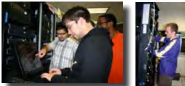
Students testing QDR Infiniband hardwar

This highly-selective program is designed for third year (i.e., Junior) and above undergraduate students, although in some cases, Sophmore applicants may be considered. Acceptance into the program will be based on academic record (3.0 GPA minimum), interest and goal statement, and a letter of recommendation.