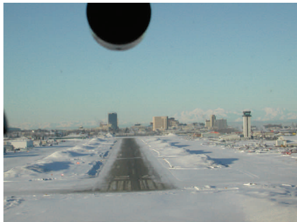
Practice normal crosswind and short field landings at locations that provide enough room to make mistakes.

Just as aircraft have limitations, so do we as operators and maintainers. These limits are a little harder to recognize since they are always changing and are not identified in a operator's manual. How proficient are we in operating a particular aircraft or performing a particular maneuver? Did you know that most Alaska aviation accidents occur during the landing phase of flight? Many factors include crosswind or strong winds, flaring too high, loss of directional control after touchdown, unsuitable landing field (too short, too muddy, too rocky, too much snow). Being landing proficient takes practice. Practice picking out suitable landing fields. Practice normal crosswind and short field landings at locations that provide enough room to make mistakes before going to your favorite fishing spot.