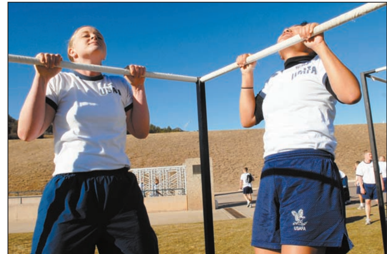
The obstacle course challenged strength, determination and the will to win during Comm's Challenge.