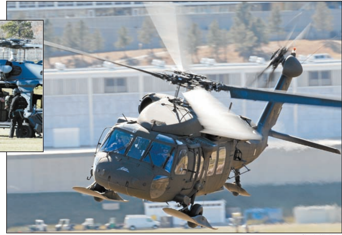
UH-60 Blackhawk helicopters provided transport for cadets to and from Jacks Valley.