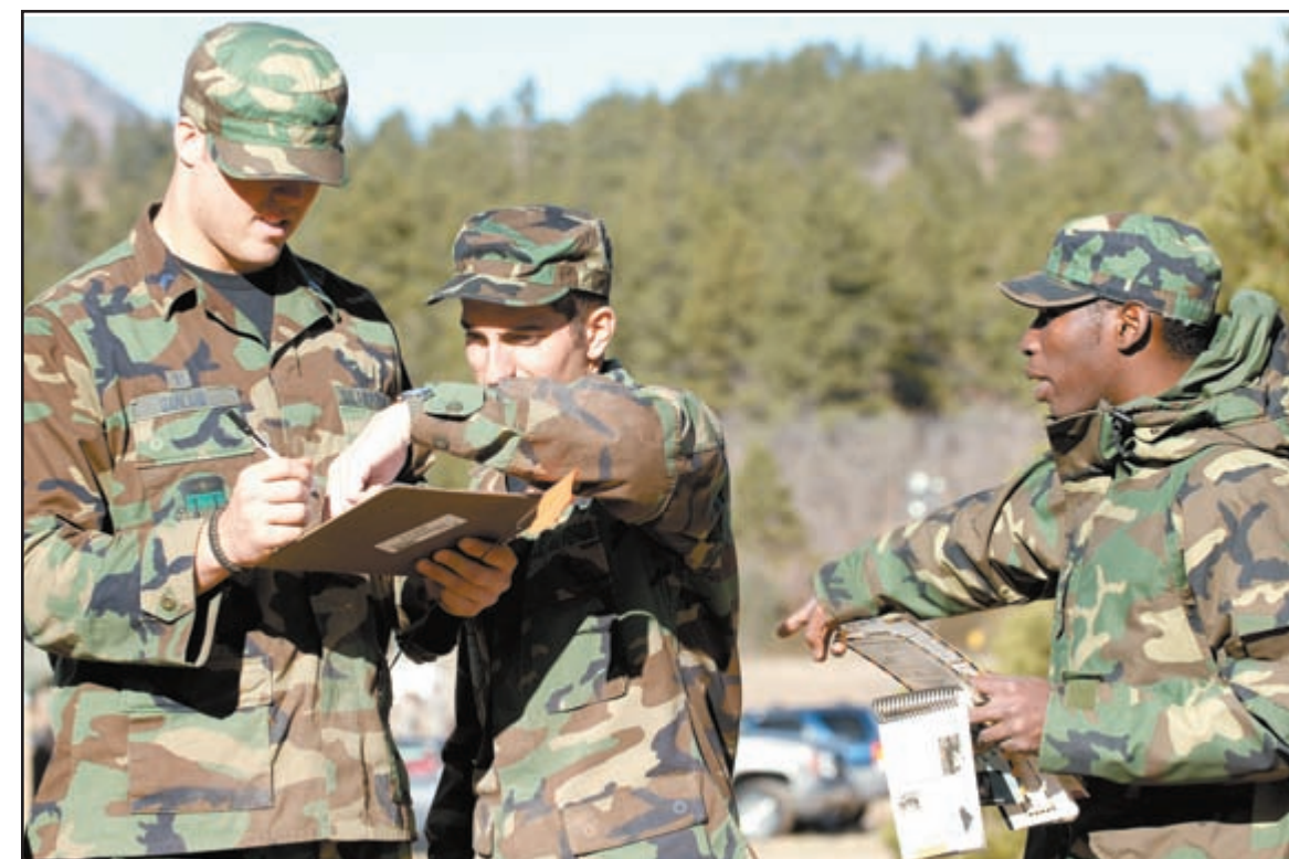
Testing of cadets' land navigational skills was critically overseen by cadre members.