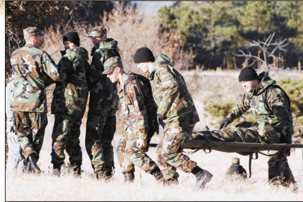
Getting "wounded" to safety for timely treatment is critical in a combat situation.