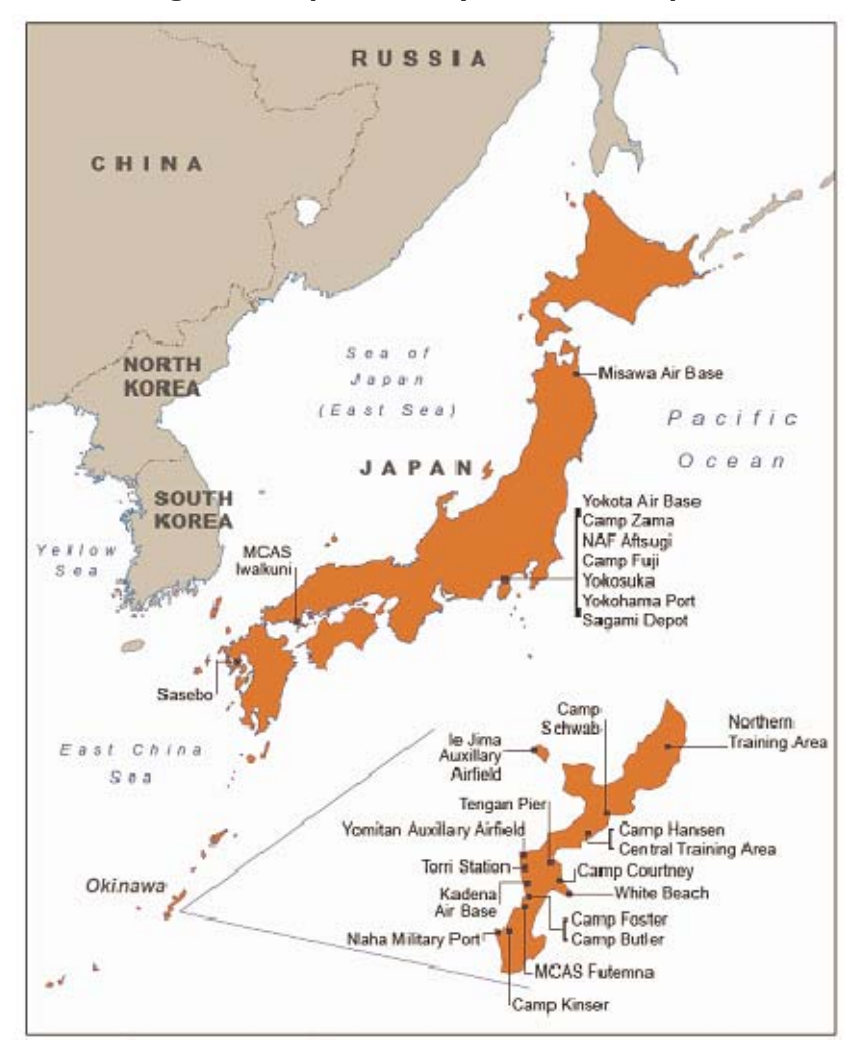
Figure 2. Map of Military Facilities in Japan

A U.S.-Japan program of cooperative research and development of anti-ballistic missiles began in 1999. The decision to acquire the ground-based U.S. Patriot Advanced Capability-3 (PAC-3) system and the ship-based U.S. Standard Missile-3 system was justified largely on the basis of North Korea's missile program. In December 2005, Japan's Defense Agency agreed that Japan will pay over $1 billion for the project over nine years. Following North Korean missile tests in July 2006, officials announced that the deployment of the PAC-3 system to Okinawa would accelerate. In December 2007, a Japanese destroyer successfully intercepted a missile in a test exercise near Hawaii.