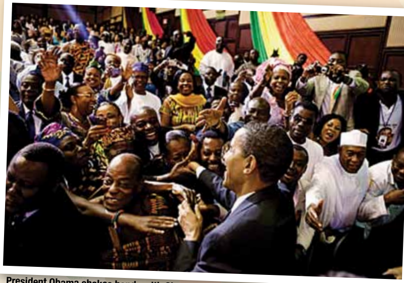
White House (Pete Souza)