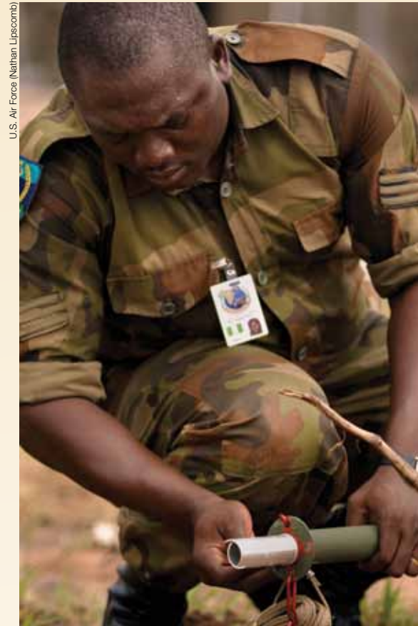
Nigerian soldier prepares to raise antenna during interoperability exercise Africa Endeavor 2008

Promoting African-led Strategic Dialogue. Our experience is showing that the African people are growing more aware of their security challenges and feeling more empowered to address them. While not all will have the opportunity to contribute equally to the solution, the fact that the dialogue is taking place is important. We need to encourage and sustain this dialogue by expanding strategic communications opportunities and ensuring our actions and effects are consistent with what both our partner militaries and the people they serve