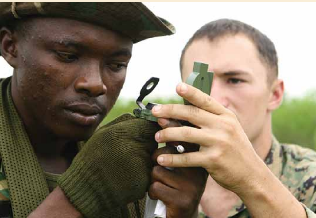
U.S. Marine Corps (Nicole Teet)

African countries have been increasingly demonstrating the political will to overcome these challenges and take ownership of their security domain. For example, several nations banded together to dismantle significant elements of the Lord's Resistance Army. The partnership developing among the Gulf of Guinea nations to improve maritime security is another. The AU and its five Regional