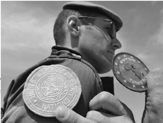
A French Soldier of the 517th regiment of the “Train de Chateauroux” changes his insignia during a hand over ceremony, 15 March 2009 in Abeche.

Countries in the region are poor, underdeveloped, and corrupt. It is a region of complex, mixed ethnic, tribal, religious, and cultural divisions in a very harsh climate and environment not controlled by borders. There are a number of different active rebel movements in the region as well as cross-border disputes between the states where these rebel movements are based.