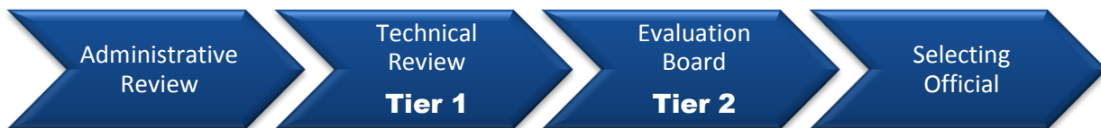
Figure 1. NIST Selection Process

In June 2009, NIST published a Federal Register notice announcing that $180 million in Recovery Act funds were available for construction grants. With OMB agreement, NIST would