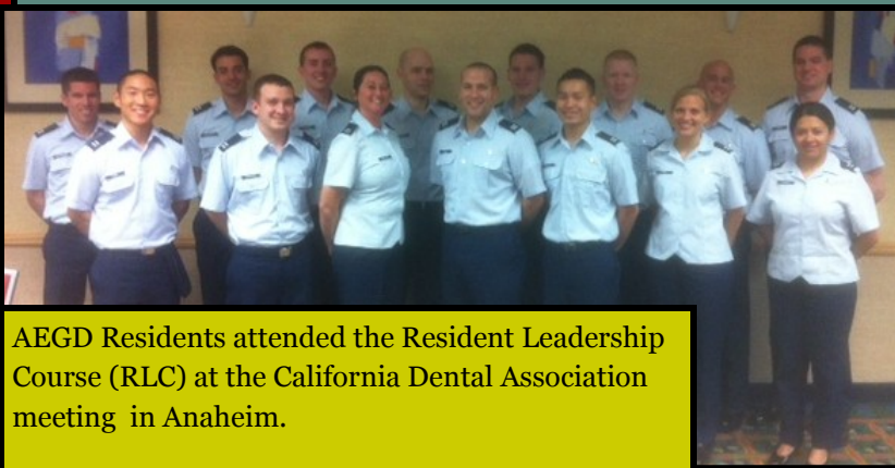
AEGD Residents attended the Resident Leadership Course (RLC) at the California Dental Association meeting in Anaheim.

From Airman to Chief and Captain to Colonel, our focused developmental courses are crucial in developing our next leaders. For our enlisted, the process of becoming a leader starts in Airman Leadership School and continues to Senior NCO Academy. For our officers and enlisted, we have the dental leadership and intermediate executive skills course to provide that additional leadership training. For our clinic commanders and other leaders, we offer CDS workshops, Squadron/Group Commander courses, and other advance senior leadership courses. These courses coupled with professional military education (PME) provide the foundation for future success.