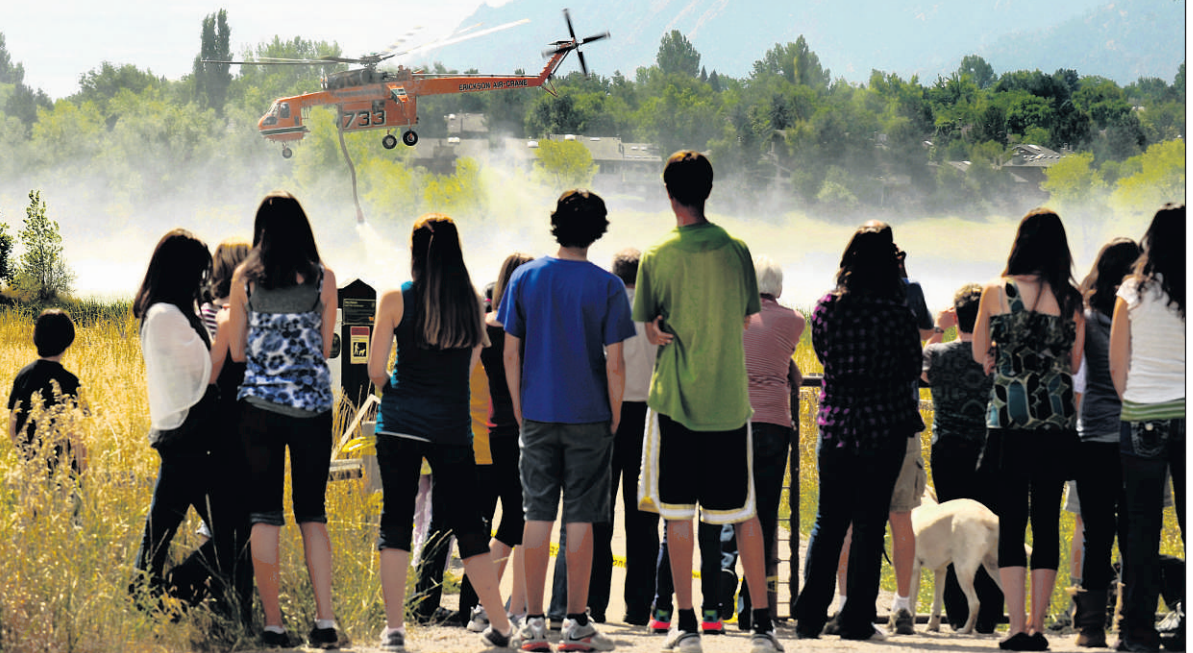
evacuated from about 1,000 homes A helicopter takes off after loading up with water. Seven of the country's 19 heavy air tankers have been sent since the 6,168-acre fire broke out to Colorado to fight the blaze, which has burned 6,168 acres.

It's unclear whether the eight linked to some of the 53 homes that has been making a stand against tion center they operate.