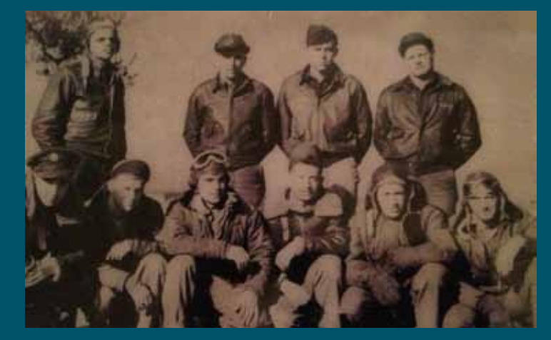
Crew of the Stargrazer