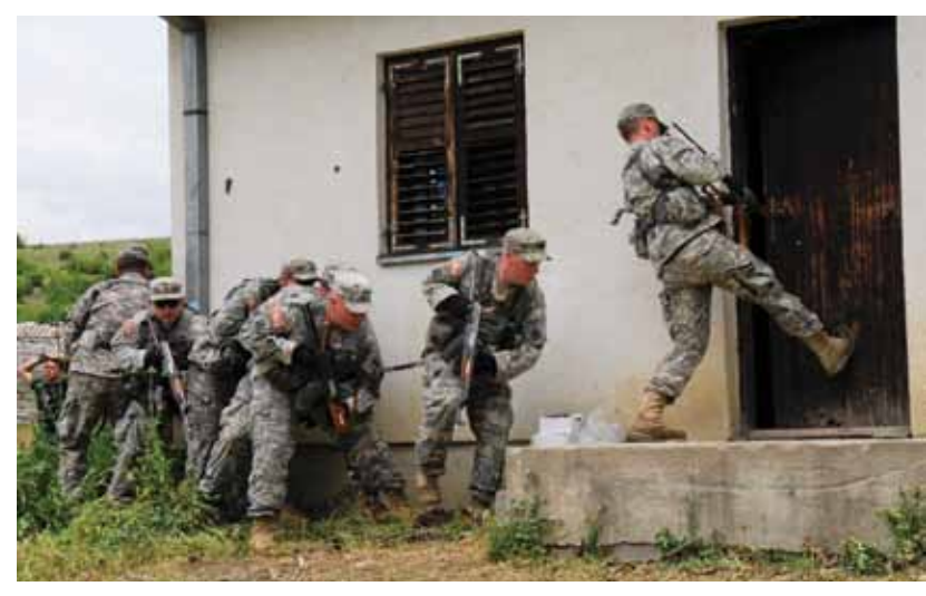
U.S. soldiers from the Vermont Army National Guard prepare to clear a target house at the Krivolak Training Area.