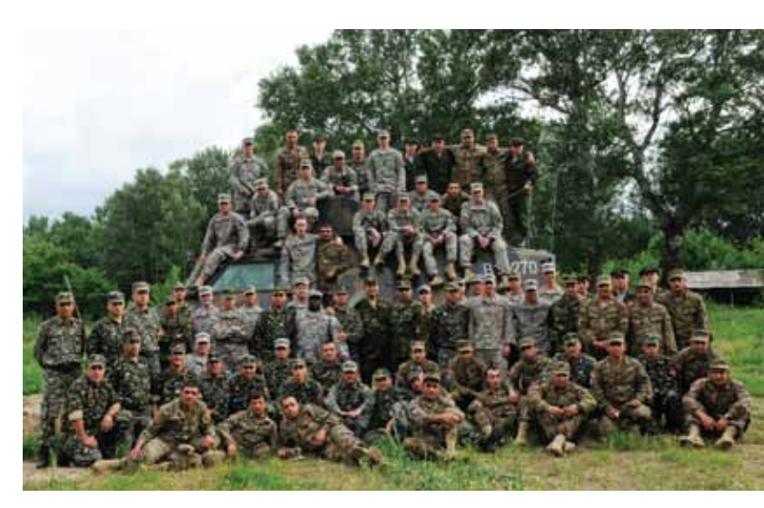
American, Armenian, Belarusian and Macedonian soldiers pose for a group photo at Camp Strella, Krivolak TrainingArea.