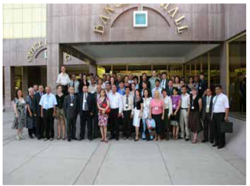
Conference participants' group photo in front of the Ak Altyn hotel