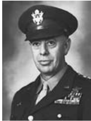
General George C. Kenney, who, as the first commander of Strategic Air Command, resided in Belle Chance from 1946 to 1948.