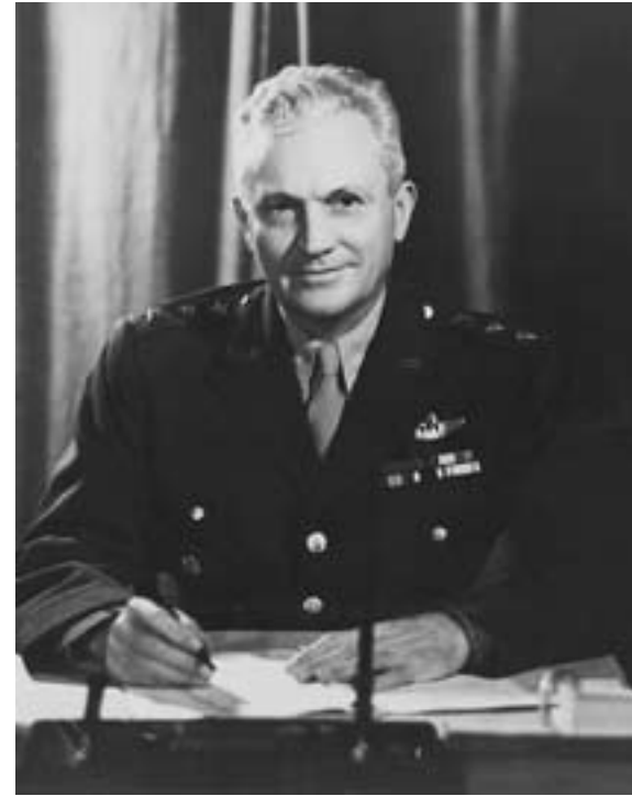
Lieutenant General Frank M. Andrews, for whom Andrews Air Force Base was named.