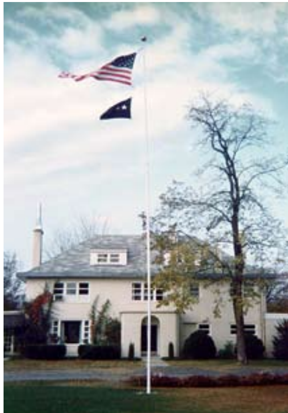
Entrance of Belle Chance during General Schriever's tenure.

Lieutenant General Schriever became the first AFSC commander and was promoted to full general in July 1961. During its early years, which fell during the Kennedy administration, the command gave considerable attention to the research and development of weapons and ordnance for conventional wars, which had been overshadowed by nuclear and