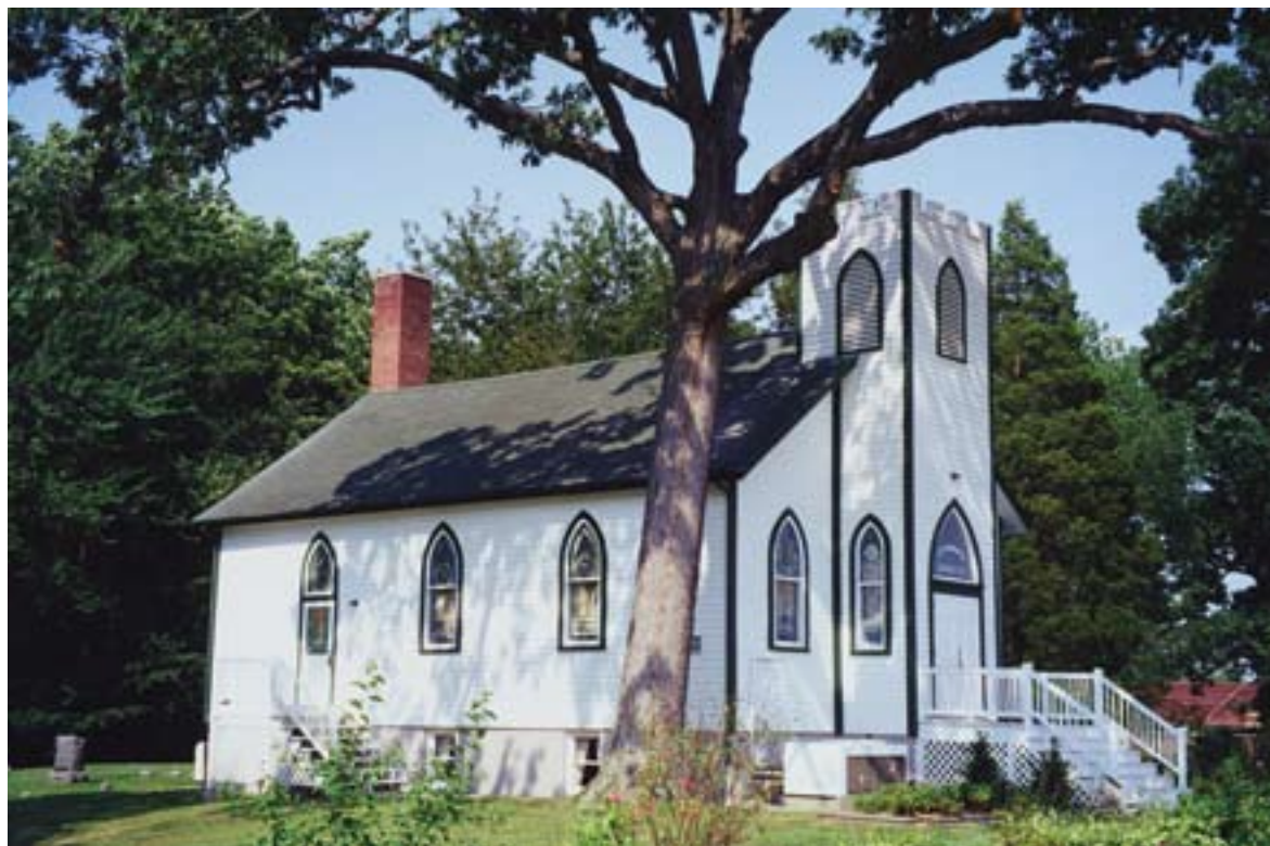
Chapel 2, Andrews Air Force Base. Forest Grove Church, the chapel's original designation, was built in 1854 by members of the Methodist Episcopal Church South.