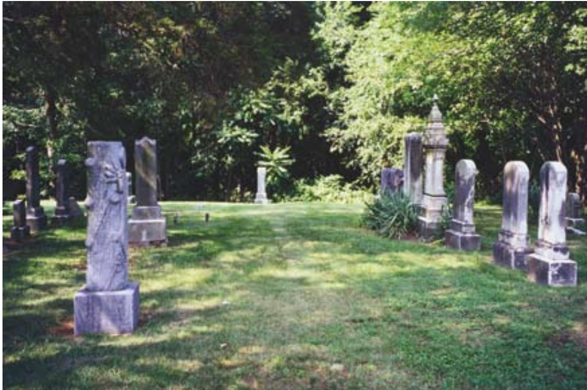
The cemetery at Chapel 2.

Protestant churches were likewise divided. The Baltimore Conference, for example, voted to accept the General Conference's condemnation of slavery. But in strongly pro-Southern Prince George's County, which would give Republican Abraham Lincoln only three votes in the election of 1860, many churches rejected this position. A number of congregations in the Bladensburg circuit decided to leave the Baltimore Conference over this issue and declared themselves part of the Methodist