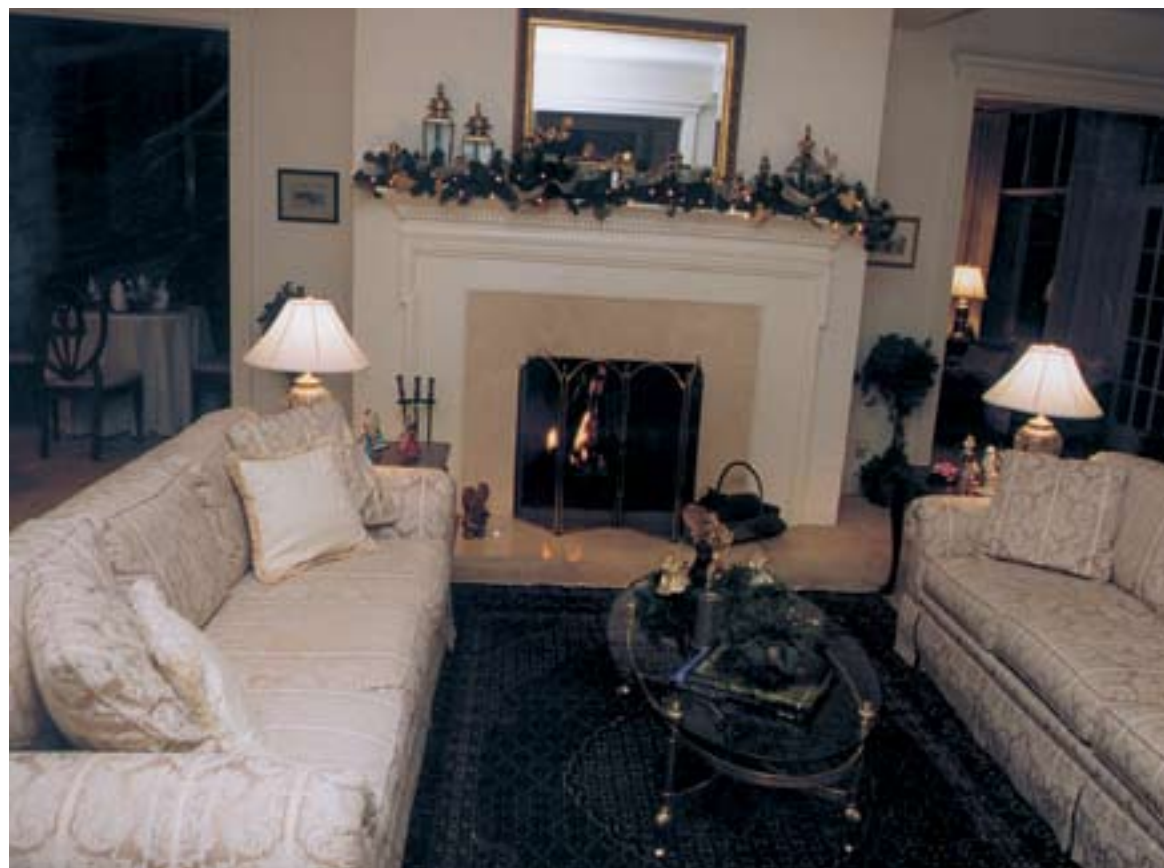
Christmas at Belle Chance, 2000. The house's architectural richness is enhanced by seasonal decorations. (Below) main living room with central fire place; (opposite, clockwise) alcove table with reindeer, gift box, poinsettia plant, and tree; dining room with central fire place and tree; entrance with stairway to second floor.

deserves special treatment." And a third general officer summed up the enduring qualities of Belle Chance: "It's a place of history, a place of beauty, and a place of refuge." 25