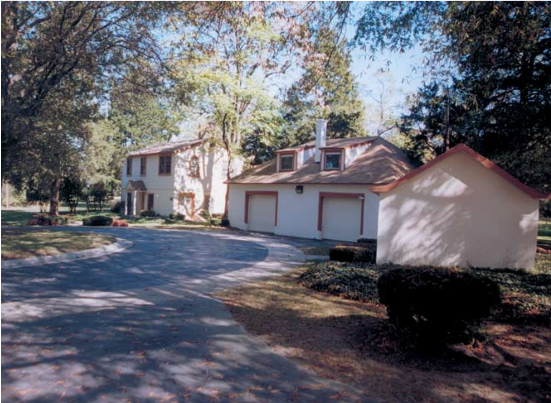
Belle Chance's guest house (left), garage with upstairs apartment (center), and side view of the garden house, 2000.