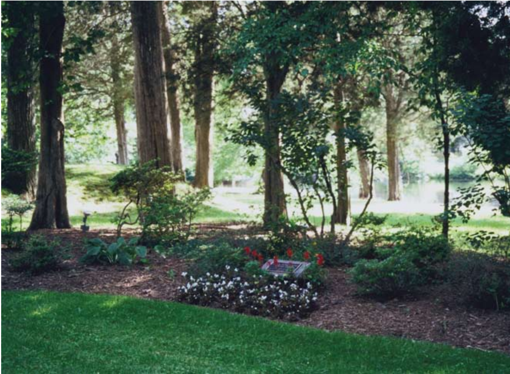
A peaceful setting for contemplation at the General George S. Brown Memorial Garden within the woods of Belle Chance, 2000.