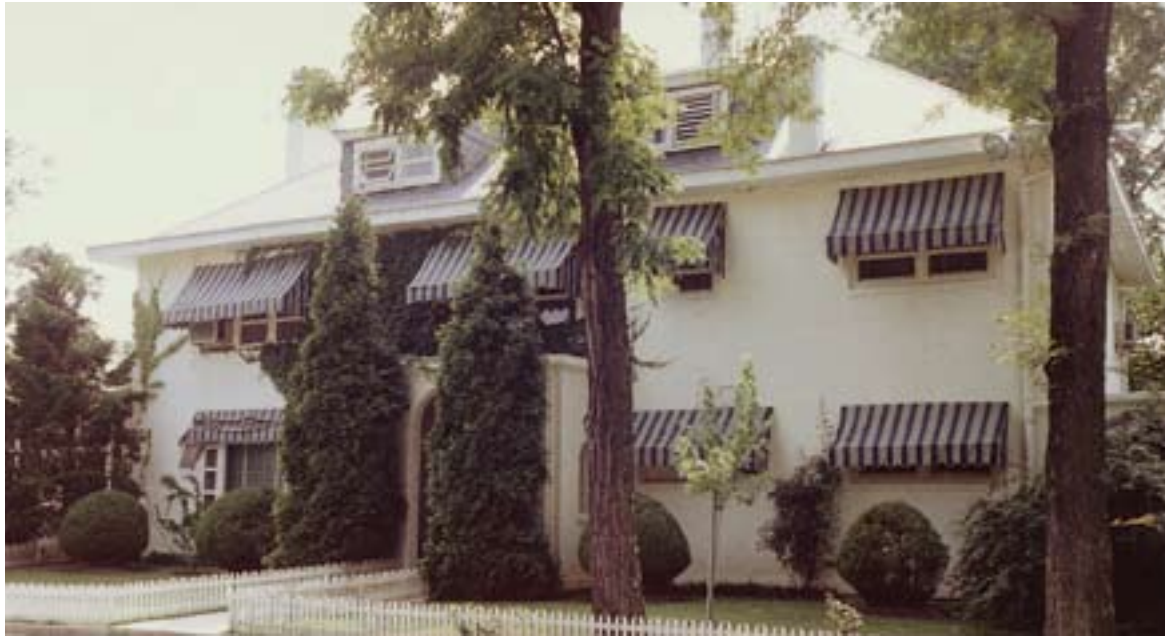
The entrance to Belle Chance, after a major renovation of the home in 1952.

Bremen, Germany. He was graduated from Texas A&M University in 1931, joined the army, and completed pilot training at Kelly Field, Texas, in 1933. 28 Out of the service briefly during the 1930s, he returned to duty as an engineering officer and test pilot, earned a master's degree in aeronautical engineering at Stanford University, and flew sixty-three B-17 combat sorties in the Southwest Pacific. 29