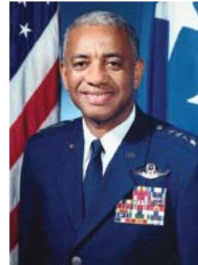
Lt. General Lloyd W. Newton, 1995–1997