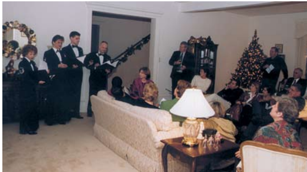
A musical interlude with the USAF's Singing Sergeants.