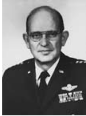
General Lew Allen, Jr., commander, AFSC, from 1977 to 1978, later served as Air Force Vice Chief, and then Chief of Staff.

In view of his background, it is not surprising that General Allen’s Air Force career was directed to space programs, special projects, and research and development efforts. From 1957 to 1961 he served as a science adviser at the Air Force Special Weapons Center; from 1961 to 1965 in the Office of the Secretary of Defense’s Directorate of Research and Engineering; from 1965 to 1969 in the Office of the Secretary of the Air Force; and then in a series of Air