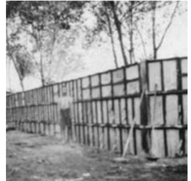
Construction of the concrete retaining wall between Belle Chance and Dr. Stewart's Old Fishing Hole, one of the three spring-fed ponds behind the property, 1920.