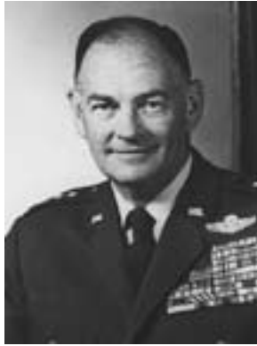
General George S. Brown, commander, AFSC, from 1970 to 1973. He was one of two residents of Belle Chance to become Air Force Chief of Staff and the only one to become Chairman of the Joint Chiefs of Staff.

Director of Laboratories; the Air Force Office of Scientific Research was established; and four laboratories came under the purview of Headquarters AFSC. 50