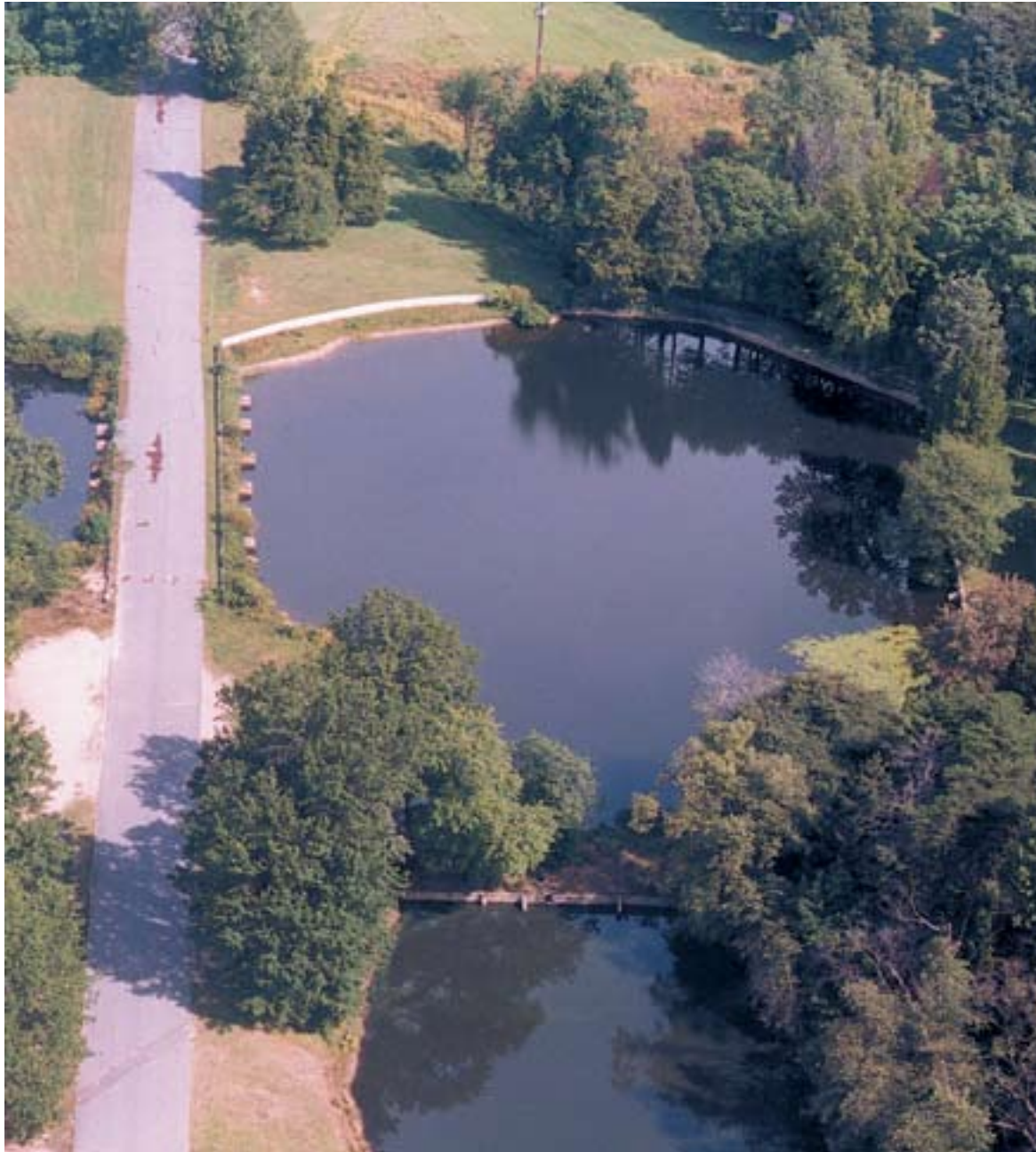
Ponds at Belle Chance, 2000.