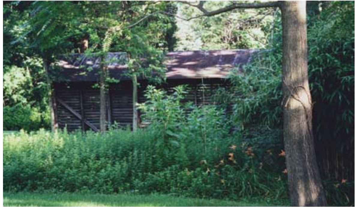
The old corn crib, a rustic backdrop for many flower and vegetable gardens grown throughout the years at Belle Chance.

General Kuter held an extraordinarily diverse range of senior positions