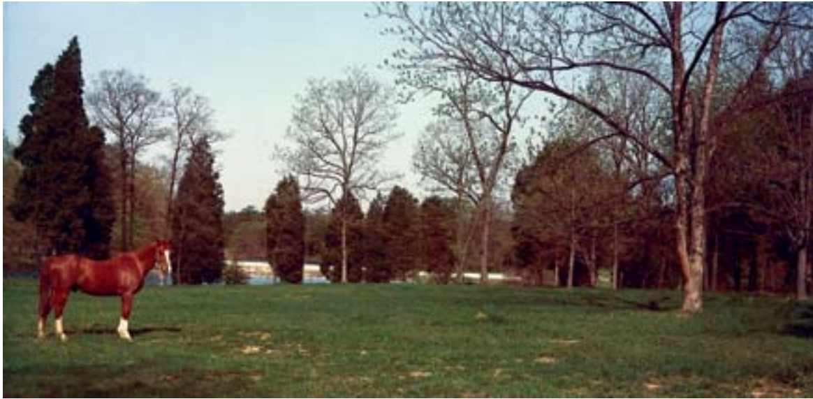
One of the horses quartered by General and Mrs. Schriever in a stable, which stood in some woods near the old corn crib.