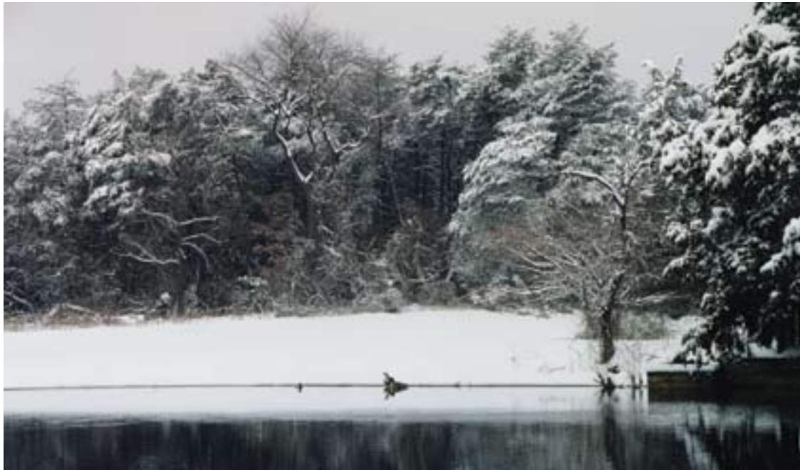
Belle Chance in winter, 1990s. Lovely all year round, Belle Chance and its grounds have a dramatic beauty under gray skies and a dusting of snow.