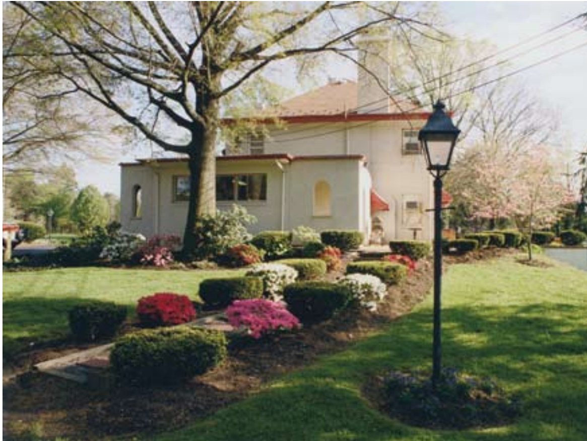
Gardens at Belle Chance, 2000. (Opposite), irises encircle a sundial across the curving driveway at the main house's entrance. Azaleas (left), pansies (below, left), and hostas interspersed with begonias (below, right) brighten the main house and its generous grounds.