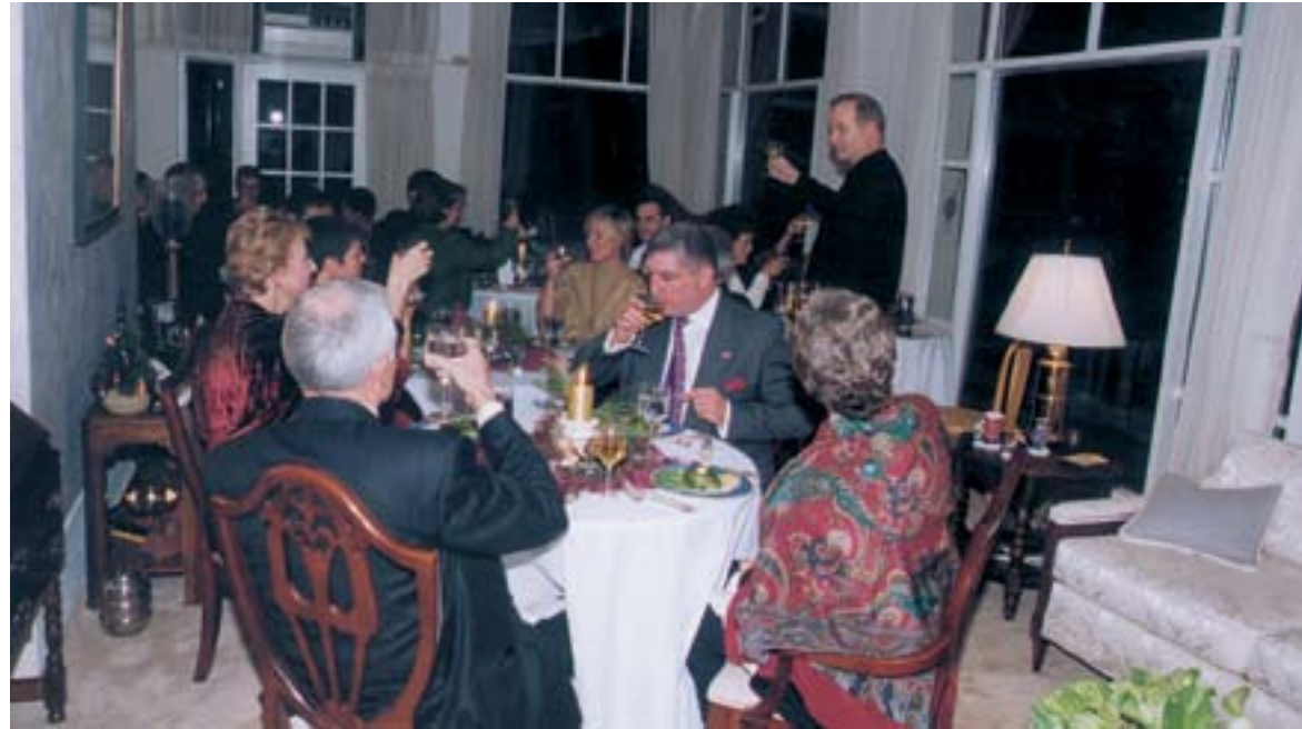
A toast to good friends in Belle Chance's sun room.