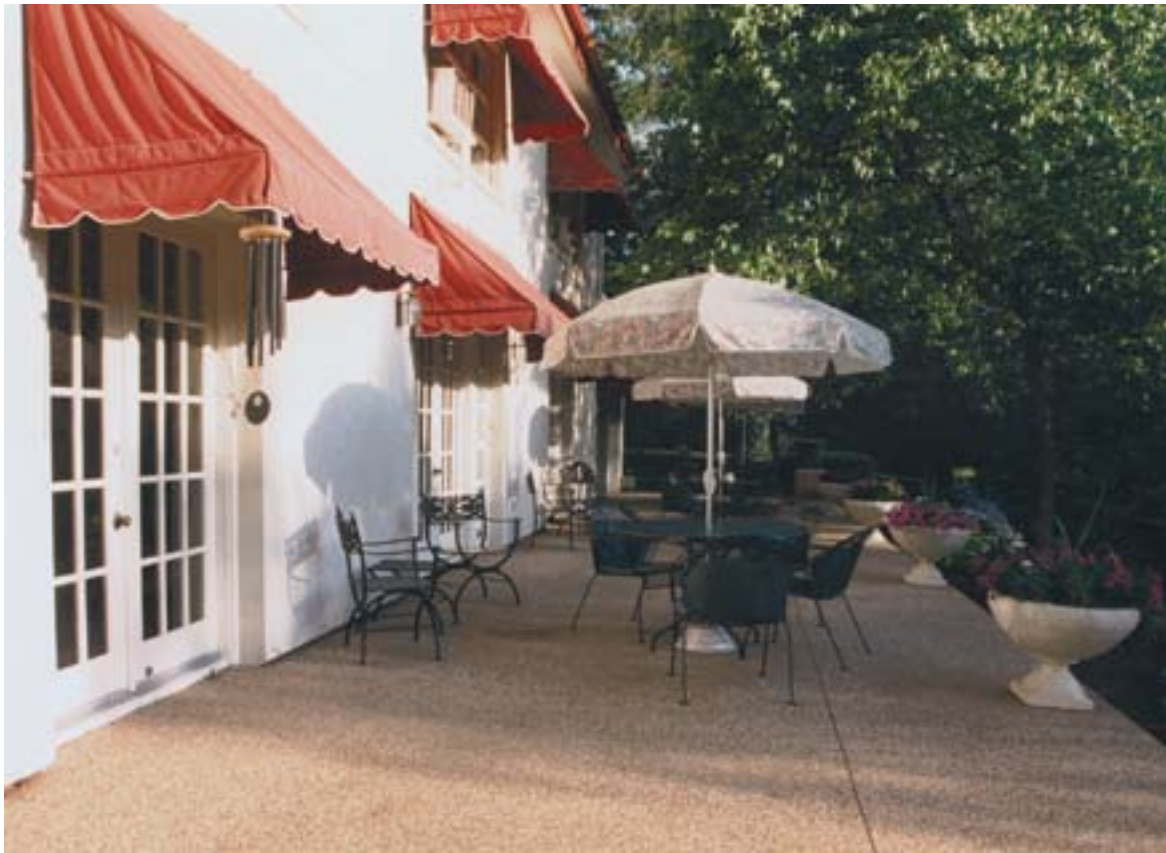
Belle Chance's patio, 1999.