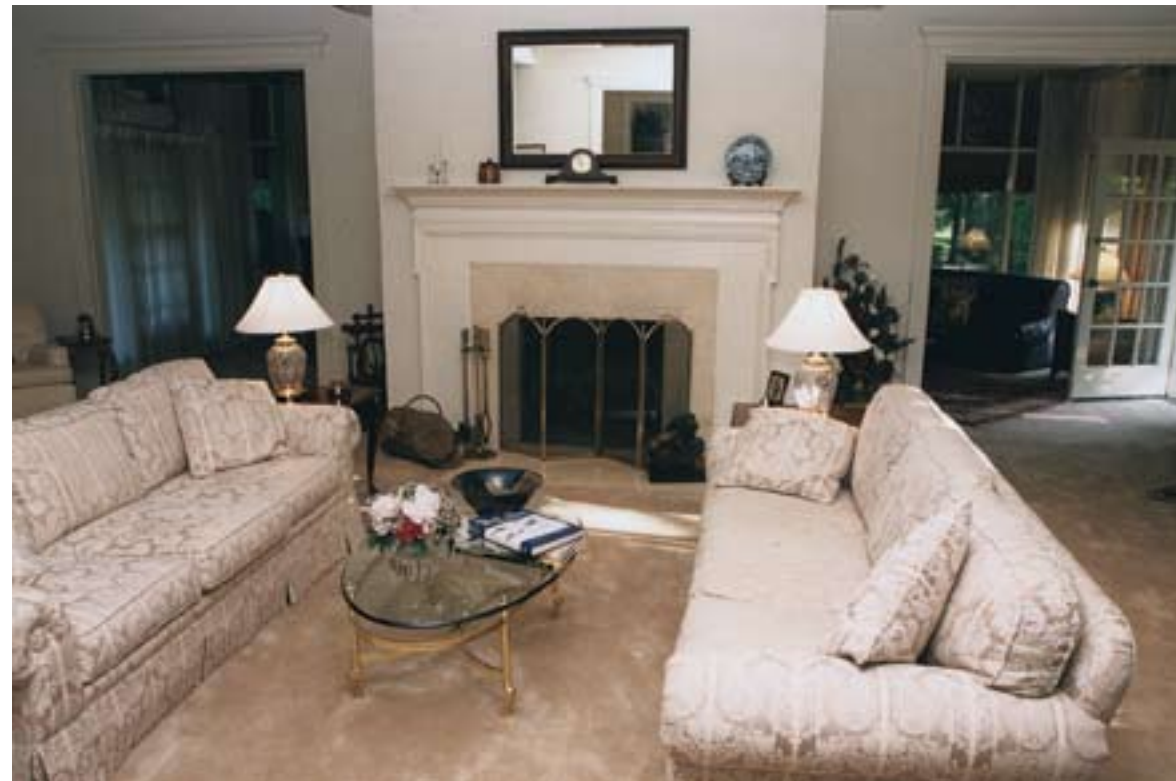
Main living room, 1990s.

The Veselys appreciated the Newtons' extensive redecorating, but Belle Chance—like any house—required