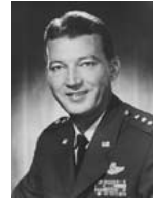
General Bernard A. Schriever, who, as second commander of Air Force Research and Development Command and first commander of Air Force Systems Command, enjoyed the longest tenure in Belle Chance, from 1959 to 1966.

While working with the Atlas test program, General Schriever introduced an important management strategy, "concurrency." Driven by competition with the Soviet Union, the American ballistic missile programs of the 1950s urgently needed many systems—test facilities,