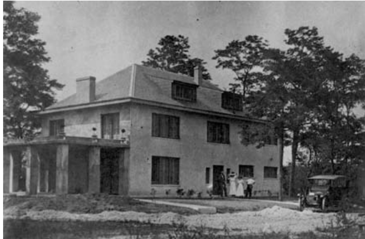
Dr. Stewart's new all-concrete Belle Chance in 1912, under construction and during the summer and autumn. It was one of the first buildings in the area designed to be completely fireproof.

Workers finished the second Belle Chance in 1912. The handsome new house had elements of Colonial Revival and quasi-Spanish styles, two motifs that enjoyed popularity in early twentieth-century America. Its interior details were impressive, particularly in view of the limitations enforced by its one-foot thick concrete walls. An imposing central stairhall opened into two parlors to the north, and a large living room, later called the sun room, to the south. The interior trim featured simplified Colonial Revival detail. A handsome wooden mantel with shouldered molding, cushion frieze, and dentillated cornice highlighted each of the largest two rooms. 67