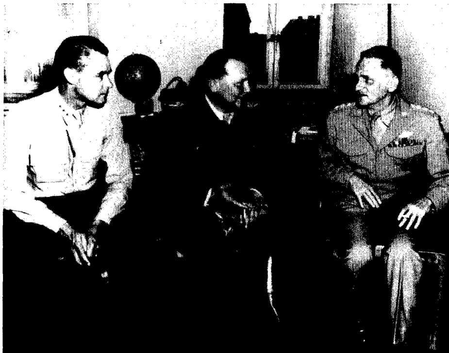
Van, Reich Marshal Hermann Goering, and Gen Carl Spaatz in May 1945.