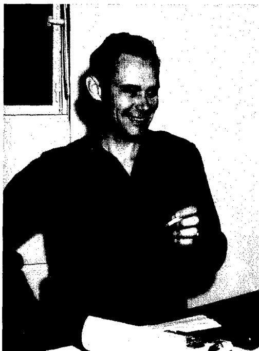
The youthful major general as commander of the Ninth Air Force in 1944.