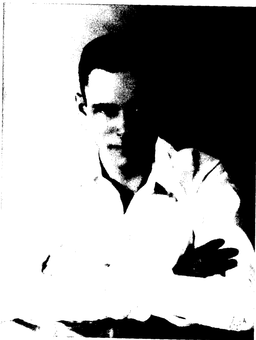
The handsome young officer, father, and husband in 1930.