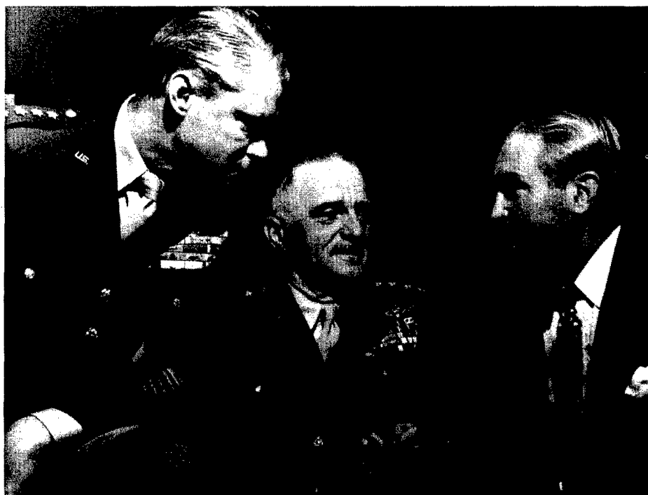
Van, Spaatz, and Air Force Secretary Stuart Symington in early 1948.