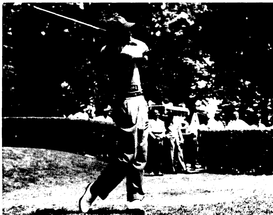
Still trim, the chief—cigarette firmly in place—tees off at Burning Tree.