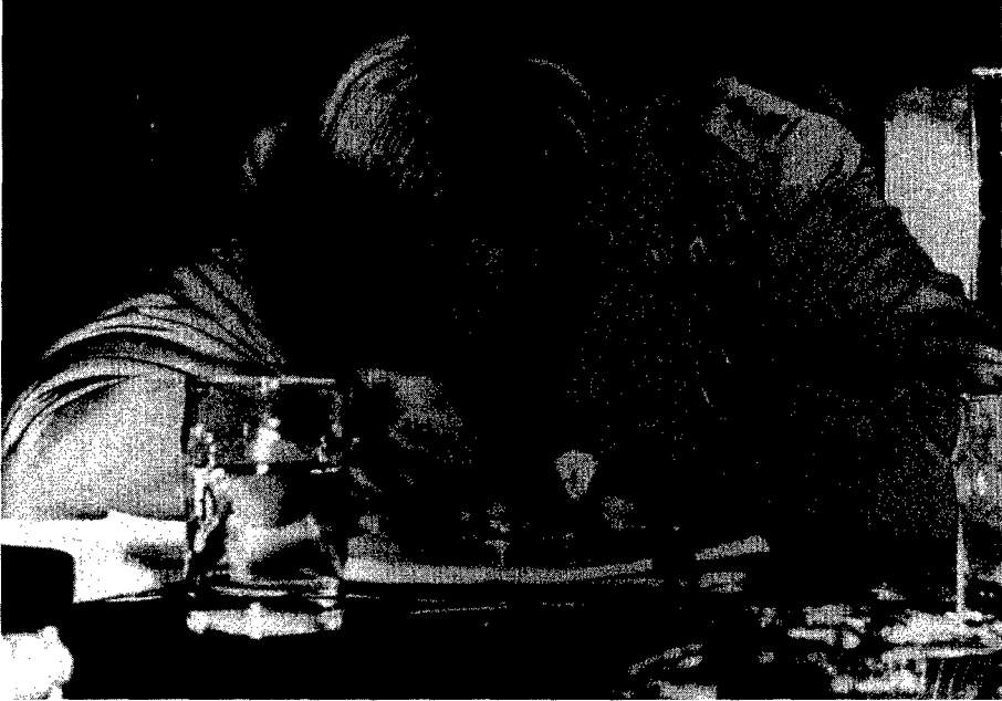
The exhausted chief trying to regain his stamina while testifying before the Senate for the last time in June 1953.