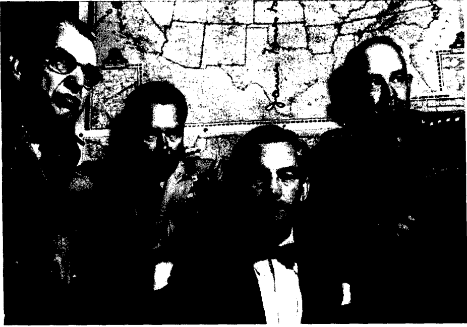
The Joint Chiefs—Adm Louis E. Denfeld, Van, and Gen Omar N. Bradley— with Defense Secretary James Forrester.