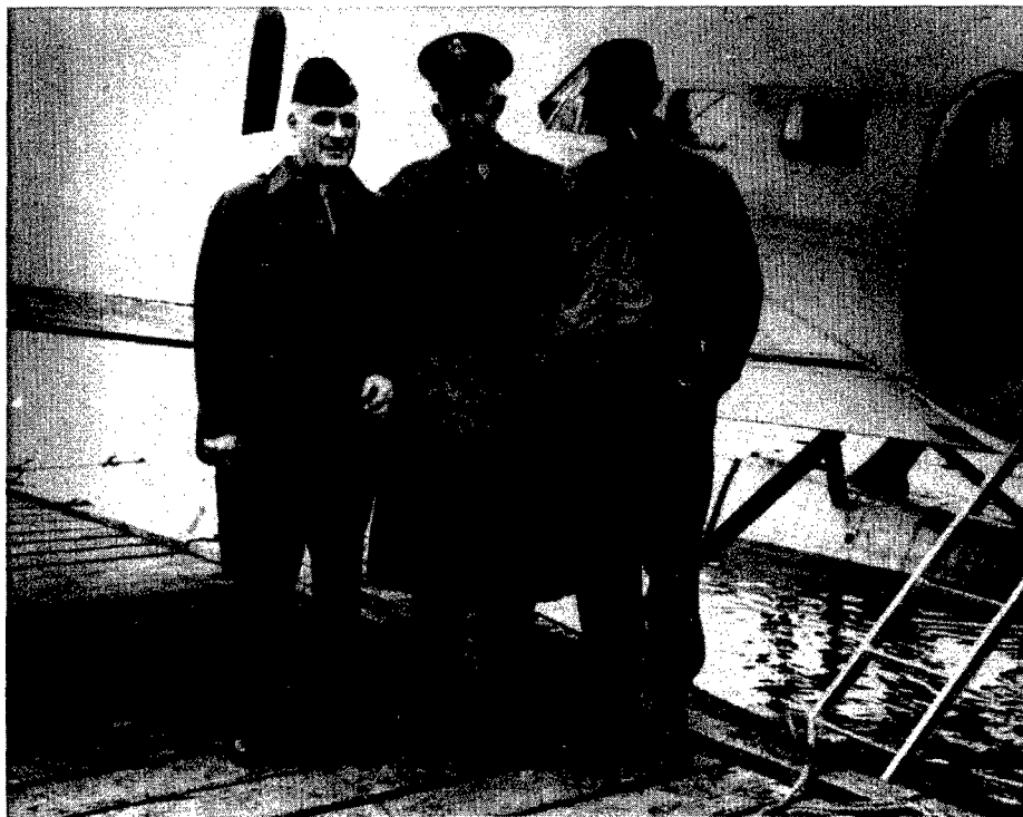
Gen Nate Twining, Bradley, and Van on a fishing trip to Alaska in 1950.