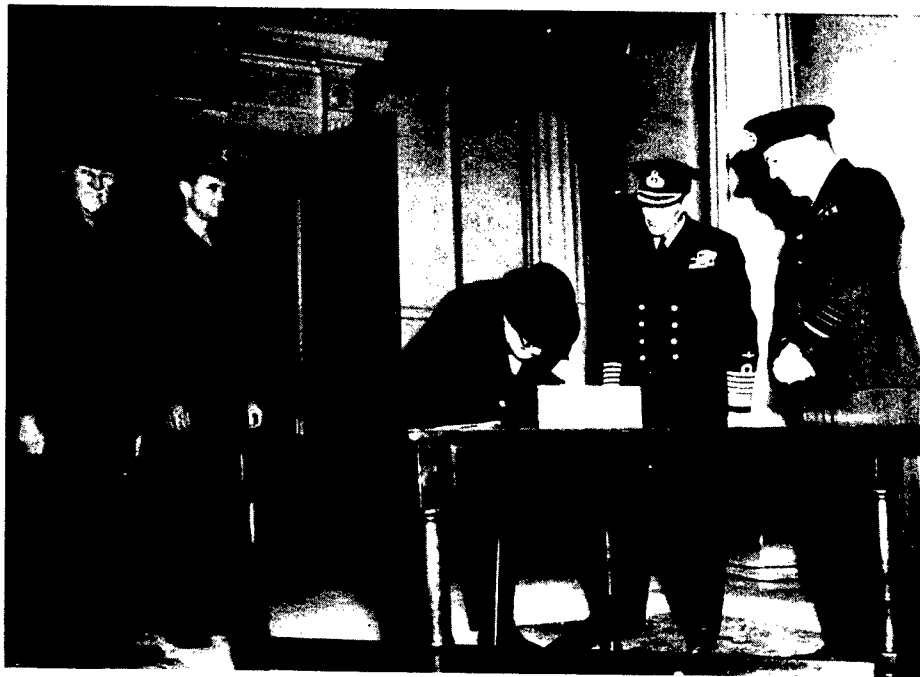
Maj Gen Vandenberg when deputy commander in chief of the AEA. Left to right: Field Marshal Jan Christian Smuts, Van, Winston Churchill, King George VI, and Air Chief Marshal Sir Trafford Leigh-Mallory.