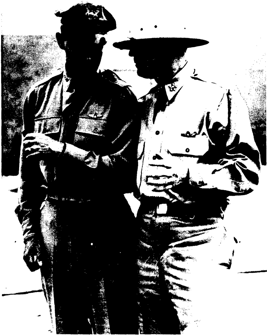
Lt Gen Vandenberg with Gen "Hap" Arnold in September 1945.