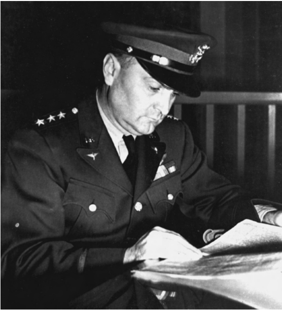
Advocates of continued daylight bombing included ( above ): Ira Eaker, and ( right ): Carl Spaatz (left) and Hap Arnold.