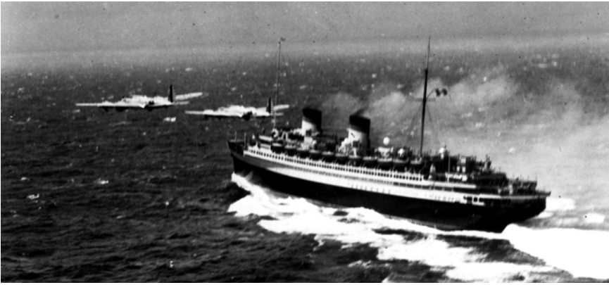
Two B-17s flying past the liner Rex , May 1938.

Andrews wrote: “The situation with reference to our strategic mission and the proper equipment with which to perform it, seems to be getting progressively worse, and we have no court of appeal that I can think of . . .” Then came the August 1938 meeting with Marshall. The War Plans Division Chief, upon returning from his nine days of air power indoctrination, found that, indeed, the airmen had no real representation on the General Staff. He was to become Andrews’s court of appeal.