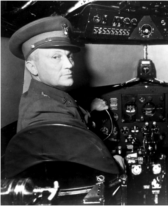
Maj. Gen. Frank Andrews, Commanding General of GHQ Air Force in cockpit of his C-32 command plane, 1936.

previous activities offers insight into the forward reach of his thinking at a time when the military was economically and strategically constrained, locked into the rigidity of the status quo.