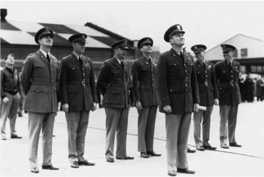
Brig. Gen. Frank Andrews and staff being honored with an aerial review at the newly created GHQ Air Force headquarters, Langley Field, Virginia