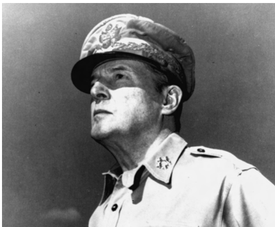
Gen. Douglas MacArthur