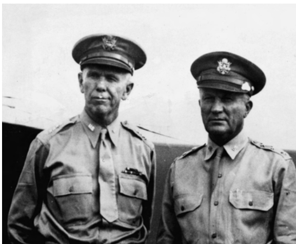
Gen. George C. Marshall, Army Chief of Staff, (left) and Lt. Gen. Frank M. Andrews, Commanding General of the Caribbean Defense Command, at Wright Field, Ohio, July 1942.

If it takes three months to train an artilleryman and ten months to build a cannon, then you have got to have a reserve of cannon. But when it takes a year to build an airplane and up to three years to train