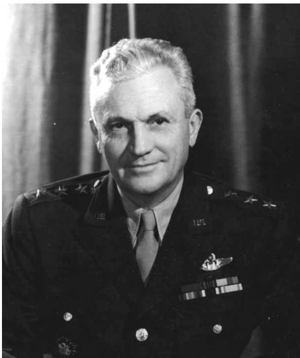
Lt. Gen. Frank M. Andrews

While he had served in the Caribbean for nearly two years, Andrews's command of USAFIME was extremely brief, lasting only three months. In that short time he brought cohesion to the widely spaced service units under his control. Two weeks after his arrival he wrote Marshall a detailed account of his progress: no unity of command amongst the British but fine cooperation nonetheless. As to the future: "I am working now on some plans for the use of our bombardment when we get the Axis out of Africa. Now, of course, everything is devoted to that objective. I hope soon to be able to make contact with