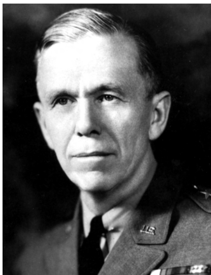
Gen. George C. Marshall

been in full agreement on anything. Nevertheless, Marshall prevailed and the appointment was announced. It was the first time in U.S. military history that an airman had been appointed one of the four assistant chiefs of staff on the Army General Staff.