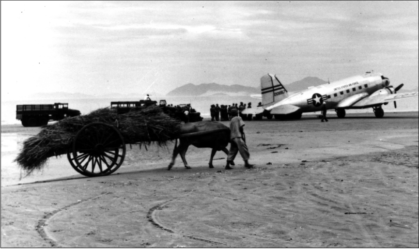
C-47 on the beach at Chodo during Operation Beachcomber, September 1952