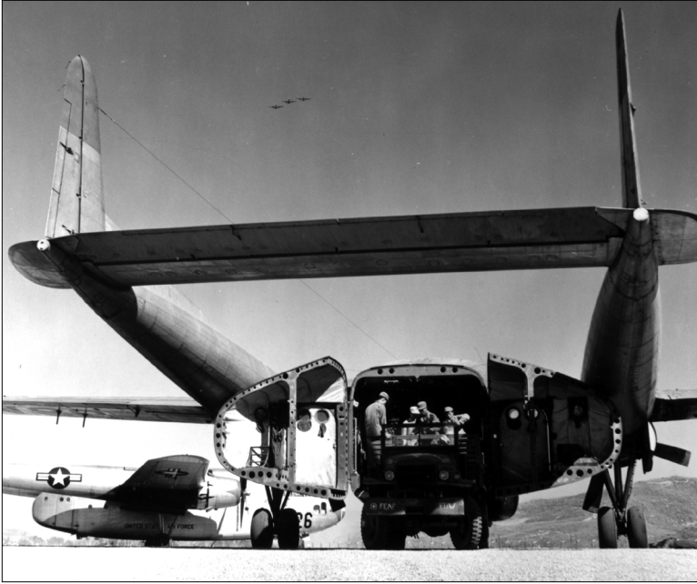
A C-119 is unloading a jeep at an advanced air base in Korea.

gistical situation, and the efficiency with which the officers and airmen of Combat Cargo Command carried out the highly important operation again demonstrates the close cooperation that exists between ground and air in the Korean War.”