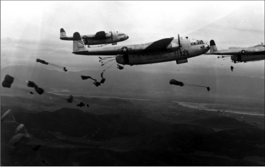
Airdrops over Sunchon, October 20, 1950

October 10, plans were finalized for a drop in the Sunchon-Sukchon area, 35 miles north of Pyongyang. The aim of the operation was to seize critical road junctions and cut off retreating enemy forces. Planners also hoped that U.S. prisoners of war (POWs) might be liberated from the trapped North Koreans.