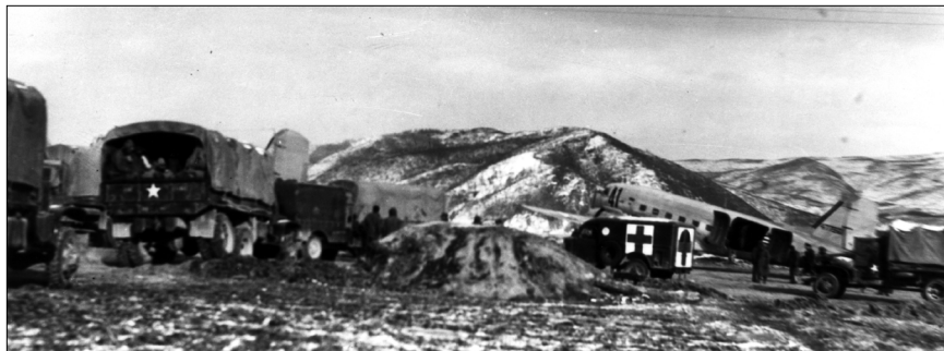
Casualties being loaded aboard Combat Cargo C-47s at Hagaru-ri, December 1950. The hills in the background are controlled by Chinese troops.

from the Royal Hellenic Air Force flew 8. The 62 sorties brought in 254,851 pounds of freight and 81 replacement marines. They took out 1,561 casualties and 12,200 pounds of cargo. Unfortunately, there was neither the time nor the space on the airplanes to bring out all the bodies of the dead.