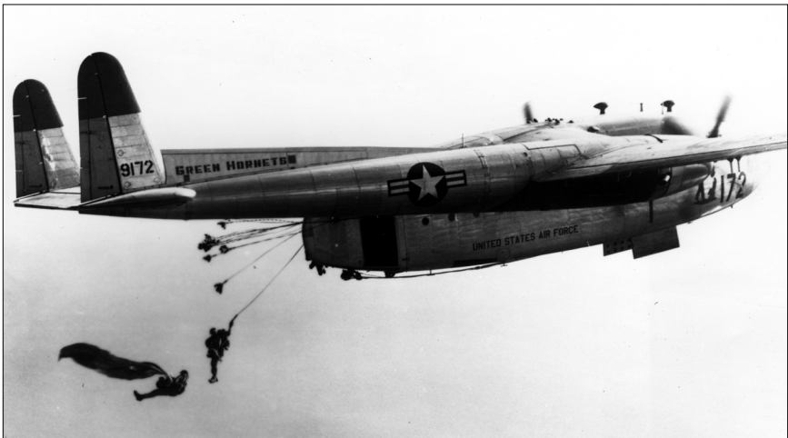
Paratroopers from the 187th Regimental Combat Team leave a C-119 during a practice jump in Japan.

On March 7, 1951, the Eighth Army again took the initiative, pushing north from Wonju. The offensive made rapid progress, and Seoul fell to the advancing U.N. forces on March 15. Planners in Tokyo had hoped to drop the 187th Regimental Combat Team in the Seoul area, but the speed of the U.N. advance caused the objective of the airdrop to shift to Chunchon. The new DZ had a number of advantages. Chunchon was an important rail terminus, just south of the 38th parallel in central Korea and a promising site for an airfield. The airborne troops would be dropped when the front line was 10 miles away and the two forces could be linked up within 24 hours. The operation, if successful, would trap a large number of enemy troops in flight northward.