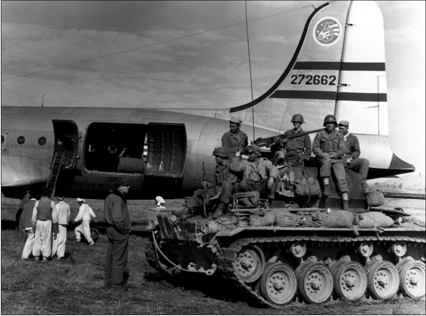
A C-54 unloads drums of gasoline at Sinmak for Eighth Army's northern advance, October 1950.

center of the resupply effort, Tunner jumped at the opportunity to use airfields closer to the advancing front. On October 26, Eighth Army captured an abandoned communist airstrip at Sinanju on the south side of the Chongchon River. Army engineers quickly patched and rolled hard the sand and gravel runway, extending it to 5,500 feet. Combat Cargo aircraft began using K-29 on October 30, often landing in the midst of enemy sniper and artillery fire. By November 17, Tunner's airmen had delivered 4,041 tons of urgently needed supplies to advance elements of Eighth Army.