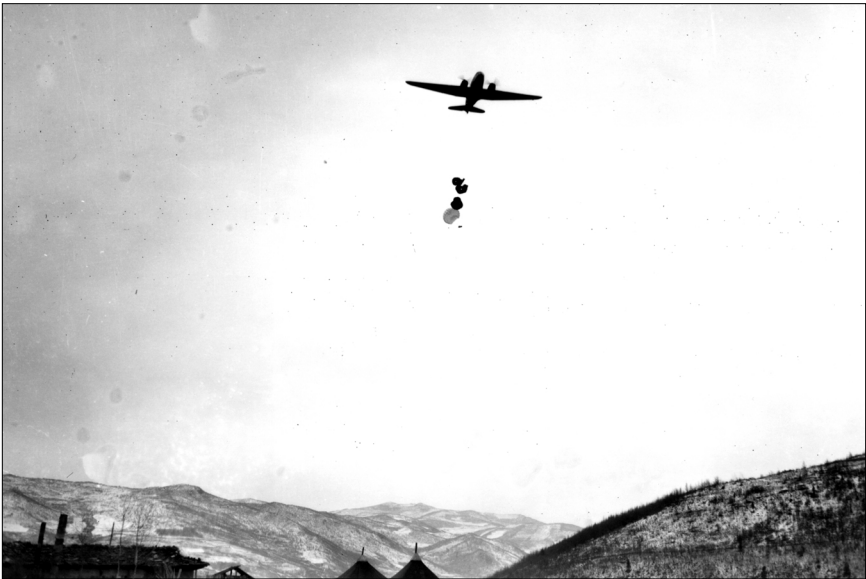
A C-47 making an airdrop at Yudam-ni, November 29, 1950.

Maj. Gen. Oliver P. Smith, commander of the 1st Marine Division, recognized that it was essential to hold Hagaru-ri if his men were to escape the Chinese trap. On November 28, he had ordered a relief convoy sent from Koto-ri to Hagaru-ri. Task Force Drysdale, however, was ambushed by Chinese troops on November 29. It lost 162 men killed or missing and 159 wounded, plus 75 vehicles. Nonetheless, a portion of the force—some 400 U.S. marines and Royal Marine Commandos—managed to escape. "The casualties of Task Force Drysdale were heavy," Smith acknowledged, "but by its partial success