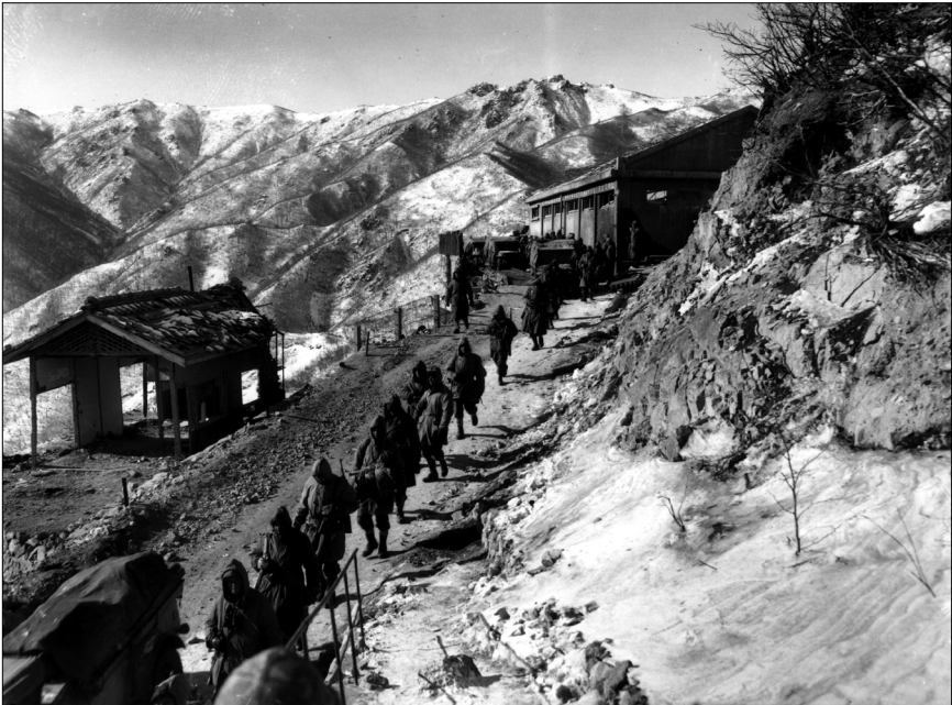
Marines gaze at the gap in the bridge over the Funchilin Pass that must be spanned to permit them to bring out their equipment. The next day, December 10, 1950, the men are crossing on the treadway bridge that was airdropped to them and that they have installed overnight.