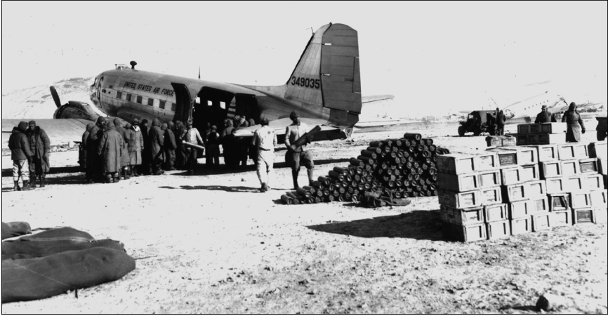
Artillery ammunition is being off-loaded from a Combat Cargo C-47 at Hagaru-ri as a group of walking wounded wait to board. December 5, 1950.

Ten thousand pictures could not convey the composite sensations to the viewer; significantly the smell—a horrible, pungent combination of blood on filthy combat fatigues, unwashed bodies, spent gunpower, and vehicle exhaust fumes—all accented in the nostrils by subfreezing temperatures. Nor could pictures convey the miserable bone-chilling cold (stunning to this ex-Minnesotan) at this altitude in the high country of northeast Korea.