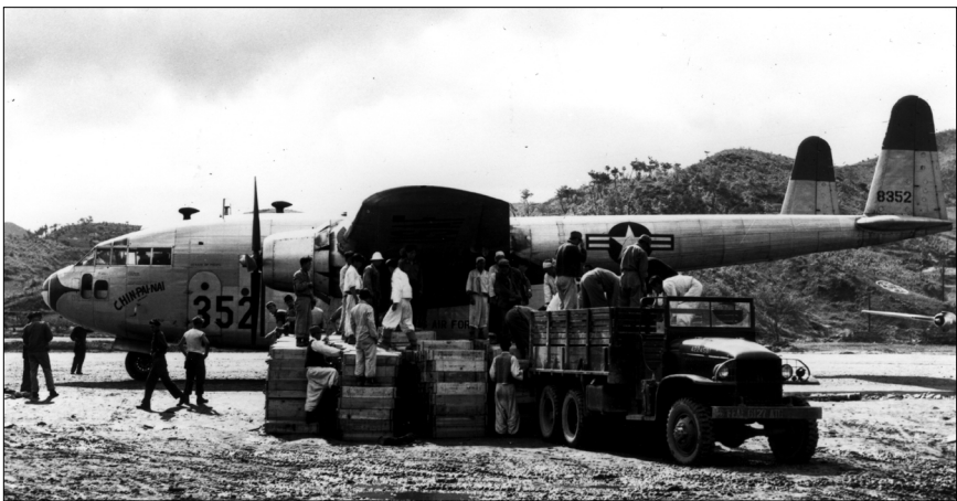
C-119 unloads at an airfield near the frontlines in Korea, June 1951.

Fortunately, a significant number of modified C-119s were available to permit a major airlift of ammunition to Korea beginning on May 20. The Chinese launched a vicious offensive in mid-May when some 175,000 men struck