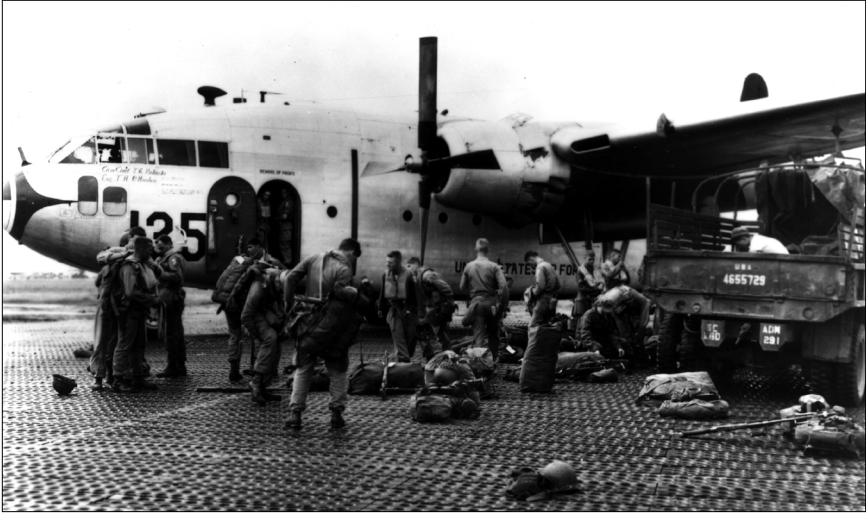
Paratroopers from the 187th Regimental Combat Team prepare to board a C-119 for a flight from Japan to Korea.

sion and the Eighth Army linked up near Osan, 20 miles south of Seoul. The South Korean capital fell to the 1st Marine Division the next day. In early October, MacArthur followed the directives of the Joint Chiefs of Staff and President Truman and ordered the Eighth Army to pursue retreating NKPA forces across the 38th parallel. At the same time, he shifted X Corps to the east coast of Korea, where it seized the port of Wonsan and began a drive toward the Yalu River.