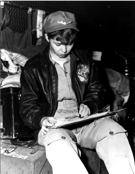
A flight nurse with the 801st Medical Air Evacuation Squadron, above , offers a cigarette to an evacuee of the Korean War during a C-124 flight in December 1952. Another nurse from the same unit completes paperwork, this during a C-54 flight in May 1952.