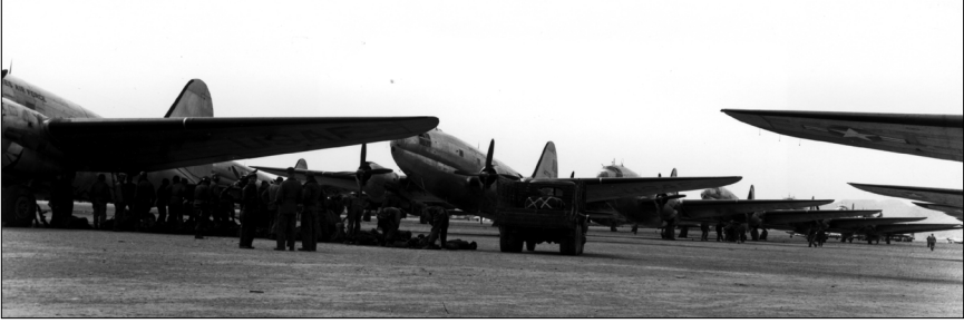
Paratroopers prepare to board C-46s for airdrop at Munsan, March 23, 1951.

On March 18, Eighth Army advised FEAF that D day would be March 22. Twenty-four hours before the planned drop, however, Chunchon fell to the swiftly moving U.N. forces. Eighth Army then switched the target to Munsan, 20 miles northwest of Seoul on the Imjin River, with the drop to take place on the morning of March 23.