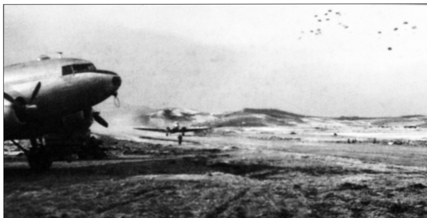
Operations at Hagaru-ri airstrip, December 1950. A C-47 at the left is being loaded with wounded as the C-47 in the background begins its takeoff. The C-119 overhead is dropping supplies.

The 5th and 7th Regiments of the 1st Marine Division reached Yudam-ni, about halfway up the west side of the Chosin Reservoir and 14 miles from Hagaru-ri, on November 25. Three infantry battalions and one artillery battalion of the 7th Infantry Division simultaneously advanced along the east side of the reservoir. Meanwhile, the 1st Marine Regiment protected the main supply route from Hagaru-ri to Koto-ri. Enemy opposition had been light throughout the advance.