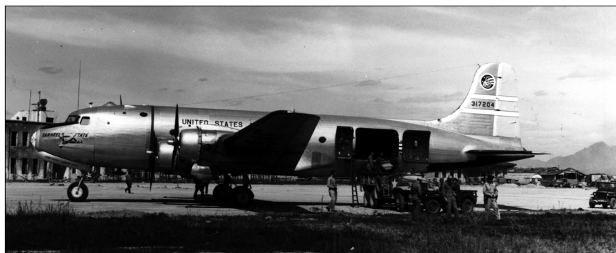
A C-54 unloads at Kimpo Airfield, September 1950.

The invasion of Inchon got underway on September 15. Taken by surprise, the enemy offered only light opposition. Three days later, advance elements of