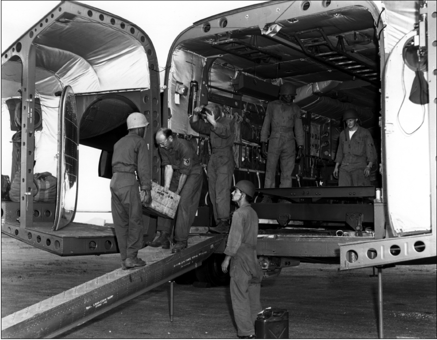
A C-119 unloads at Kimpo Airfield shortly after its capture, September 1950.

X Corps seized Kimpo Airfield, K-14, outside Seoul. At 1055 on September 19, Tunner notified his subordinates that aircraft could begin landing on Kimpo's long, hard-surfaced runway. The first C-54 arrived at 1426. It was followed by 8 additional C-54s and 23 C-119s. The transports brought in 208 tons of supplies and personnel, with most of the matériel destined for the Airlift Support Unit, which would handle the flood of aircraft and cargo in the days ahead.