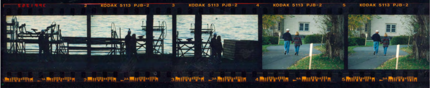
Clintons in Chautauqua, New York.