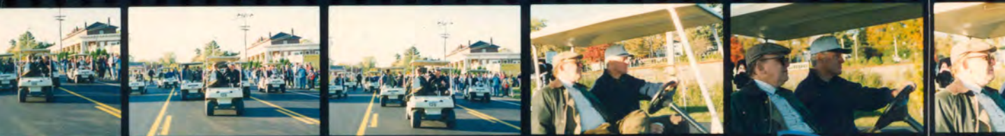
36 37 38 39 40 41 A-1 36 KODAK 5115 PJA-1 37 KODAK 5115 PJA-1 38 KODAK 5115 PJA-1 39 KODAK 5115 PJA-1 40 KODAK 5115 PJA-1 41 KODAK 5115 PJA-1