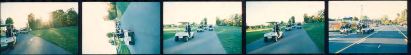
25 26 27 28 29 A-1 25 KODAK 5115 PJA-1 26 KODAK 5115 PJA-1 27 KODAK 5115 PJA-1 28 KODAK 5115 PJA-1 29 KODAK 5115 PJA-1