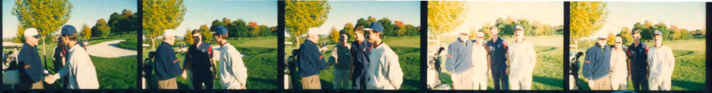
1 2 3 4 5 A-1 5 KODAK 5115 PJA-1 6 KODAK 5115 PJA-1 7 KODAK 5115 PJA-1 8 KODAK 5115 PJA-1 9 KODAK 5115 PJA-1