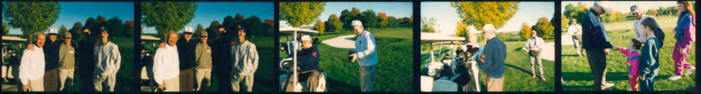
10 11 12 13 14 A-1 10 KODAK 5115 PJA-1 11 KODAK 5115 PJA-1 12 KODAK 5115 PJA-1 13 KODAK 5115 PJA-1 14 KODAK 5115 PJA-1