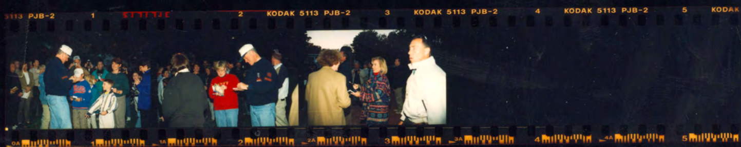
Clintons in Chautauqua, New York.