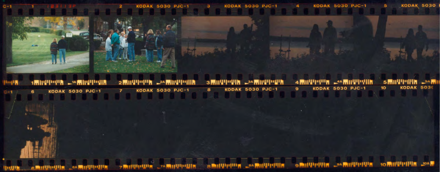
Clintons in Chautauqua, New York.