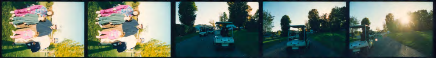
20 21 22 23 24 A-1 20 KODAK 5115 PJA-1 21 KODAK 5115 PJA-1 22 KODAK 5115 PJA-1 23 KODAK 5115 PJA-1 24 KODAK 5115 PJA-1