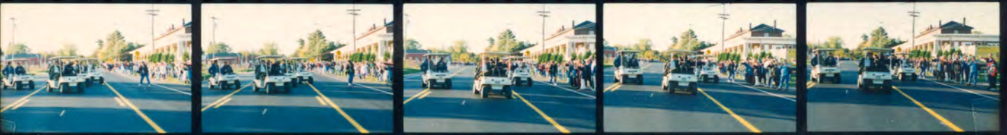
30 31 32 33 34 35 A-1 30 KODAK 5115 PJA-1 31 KODAK 5115 PJA-1 32 KODAK 5115 PJA-1 33 KODAK 5115 PJA-1 34 KODAK 5115 PJA-1 35 KODAK 5115 PJA-1