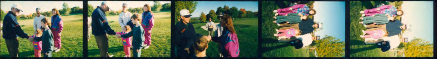
15 16 17 18 19 A-1 15 KODAK 5115 PJA-1 16 KODAK 5115 PJA-1 17 KODAK 5115 PJA-1 18 KODAK 5115 PJA-1 19 KODAK 5115 PJA-1