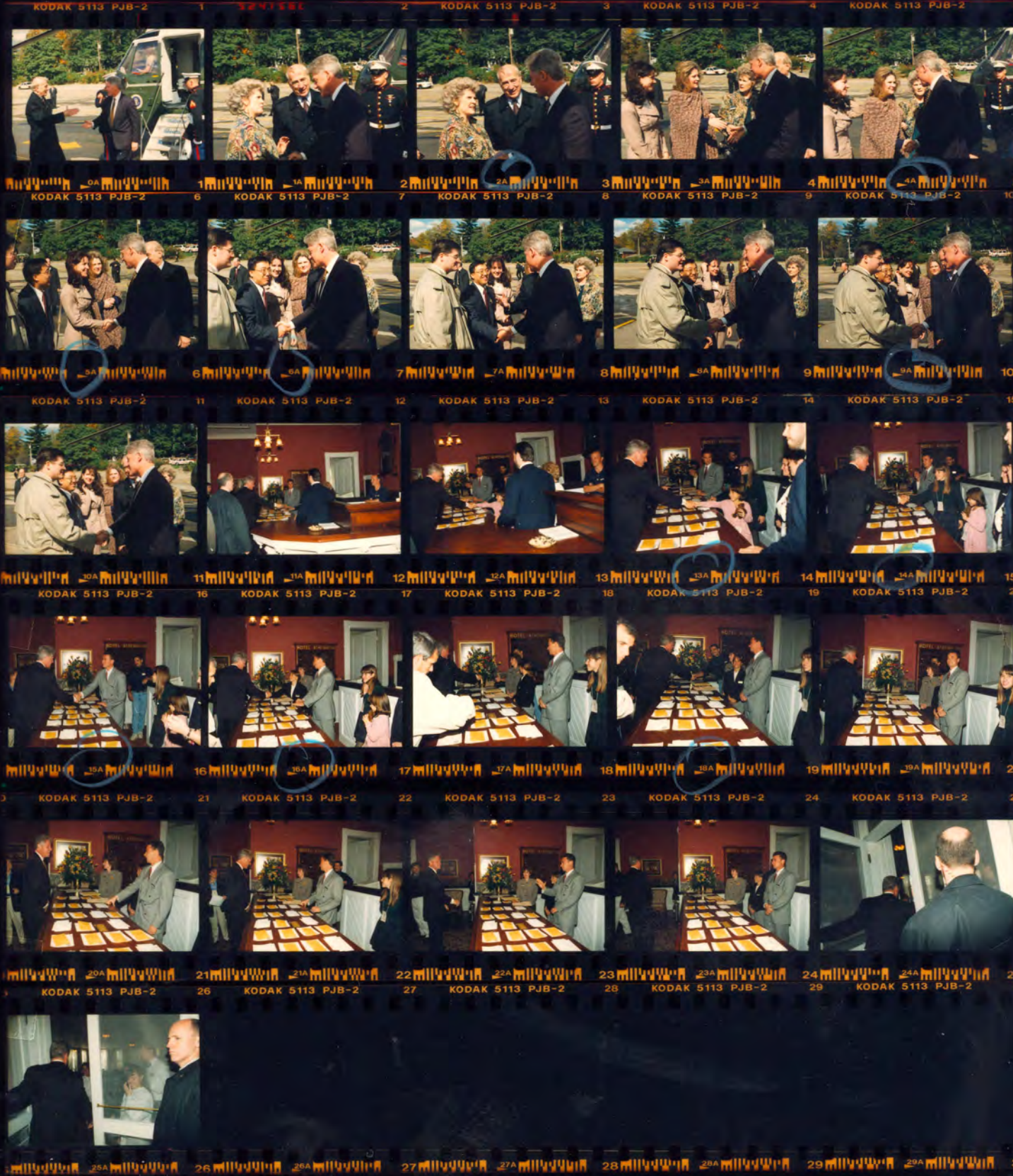
BC Arrives Hotel Athenaeum, Chautauqua, NY