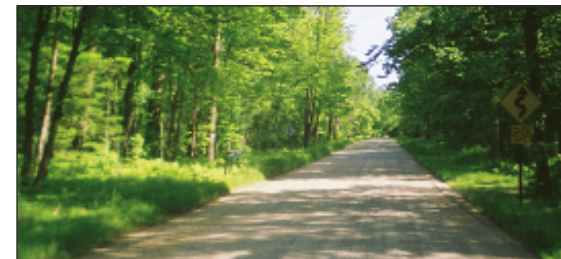
Forest Highway 22 through the Chippewa National Forest in Minnesota (FH)