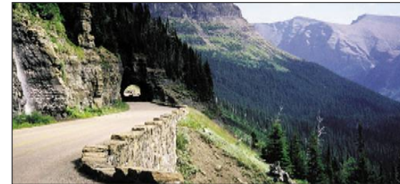
Going to the Sun Road in Glacier National Park in Montana (PRP)