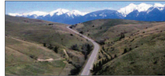
US Highway 93 through the Flathead Indian Reservation in Montana (IRR)