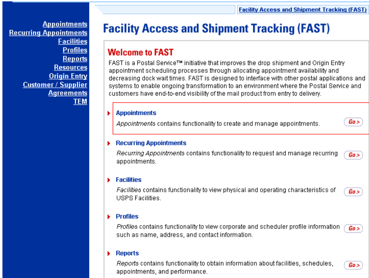
Figure 2: FAST Landing Page

Step 4: From the FAST Landing Page, click the Appointments link.