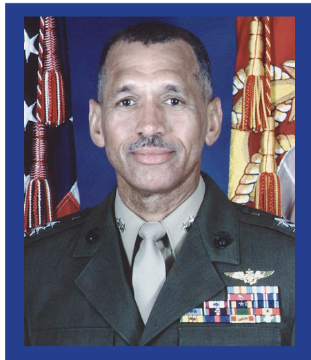
Maj. Gen. Charles F. Bolden, Jr.

In making the announcement of his nominations, President Obama said that "these talented individuals will help put NASA on course to boldly push the boundaries of science, aeronautics, and exploration in the