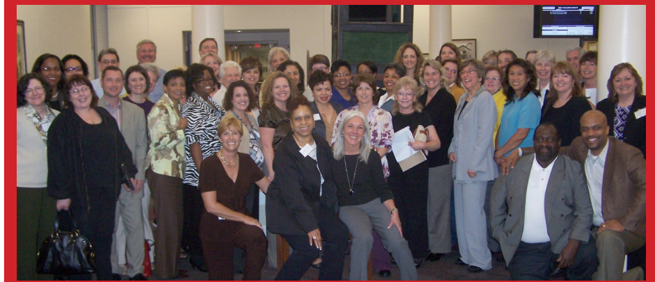
A group photo of the ODEO and OHCM communities.

Ms. Dawsey agreed, stating that the work of the two offices is "becoming more and more interrelated on many levels, e.g., recruitment, training and development, and cross-generational activities. We both fo-