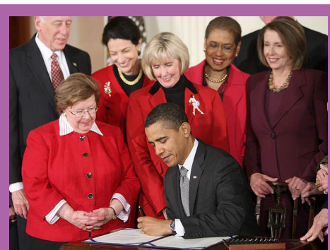
President Obama signs the Lilly Ledbetter Fair Pay Act.

The act restores the pre-Ledbetter position of the EEOC that each paycheck that delivers discriminatory compensation is a wrong actionable under the Federal EEO statutes, regardless of when the discrimination began. As noted in the act, it recognizes the "reality of wage discrimination" and restores "bedrock principles of American law."