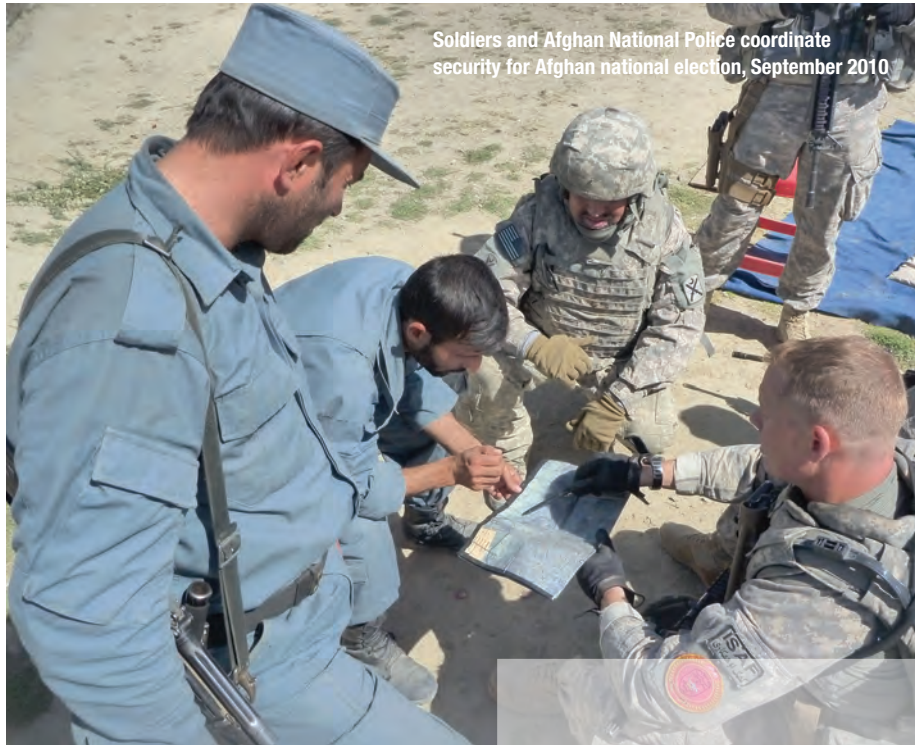
Soldiers and Afghan National Police coordinate security for Afghan national election, September 2010