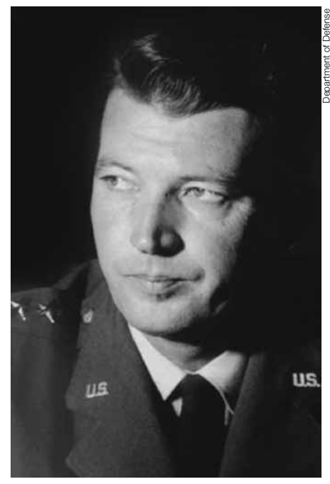
Gen Bernard Schriever worked outside staff structure to create Air Force ballistic missile and military space program

It is true that since 9/11, students have far more combat experience than in past years, but that experience is tactical and not strategic. It is based on demonstrated skill connected to a specific weapons system (for example, the F–15 or Distributed Ground Station) and to a lesser extent on leadership at the small unit level, but not on critical examination and participation in the development of national and operational strategy. We do