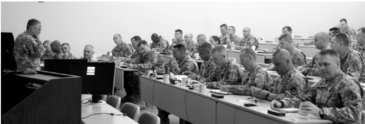
Chief of Staff of the Army GEN George W. Casey, Jr., talks with unit commanders who will lead forces in Afghanistan, Fort Drum, NY, 30 July 2010.

In a counterinsurgency, missions that require interaction with the local populace and relationship-building may require longer tour lengths or repeated deployments to the same location to facilitate the necessary interpersonal relations between soldiers and key leaders in local governance, tribal, and