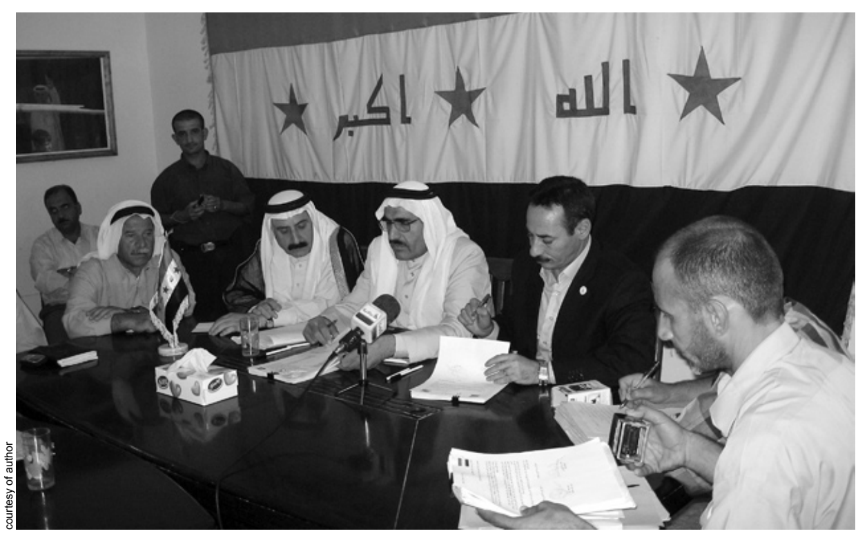
The District Council signs the first Tal Afar District Operating Budget, approved in August 2006.

based on the percentage of the provincial population inside its borders. The Tal Afar district was home to 11 percent of the people in Nineveh Province, entitling it to $22 million in capital improvement funds. The district then developed a practical plan for the projected $22 million. (Al Anbar Province received a similar amount of money from the Ministry of Finance.)