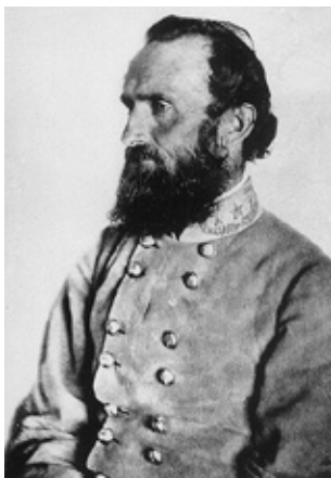
General Stonewall Jackson

The purpose of military deception is to further the aim of plans to operate on the line of least expectation and least resistance, or to deny such an advantage to an opponent. The U.S. military tends to assume that its physical power is the enemy’s only