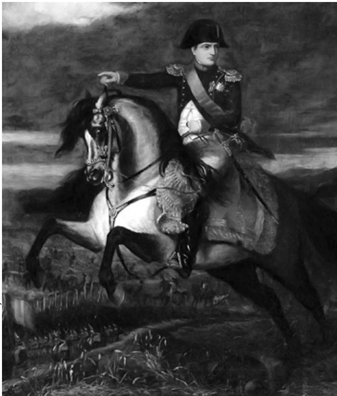
Alfred G.C. Comte d'Orsay

Gaining moral ascendancy over your opponent is fundamental to fighting and pacification at all levels, and across all time. But breaking the will of an opponent is more difficult to do than is commonly thought. What might intimidate one person may simply enrage some and inspire others to greater efforts. Human beings who willingly sacrifice life for perceived gains (ideal or real) are plentiful. Combatants risk life and limb, not because they fear punishment, but because they fear letting down their companions. These soldiers will not want to be the first to yield, and they will bear great hardship and deprivation as long as they have hope either in this life or an imagined other.